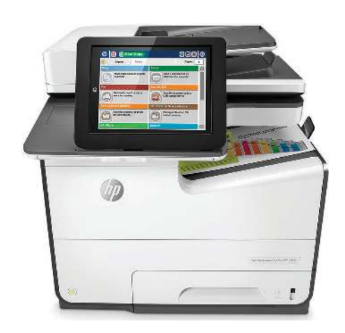
HP PageWide Managed Color MFP E58650dn