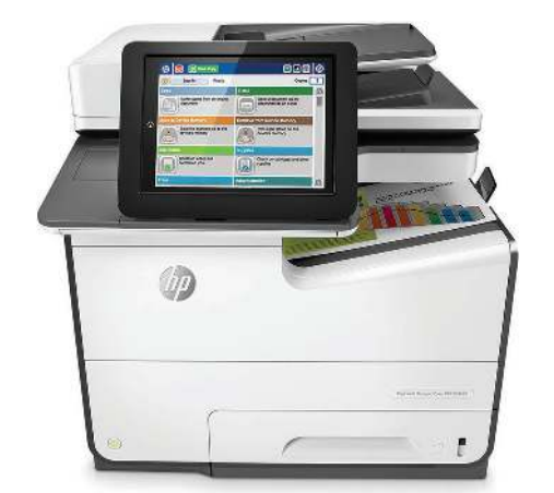
HP PageWide Managed Color Flow MFP E58650z