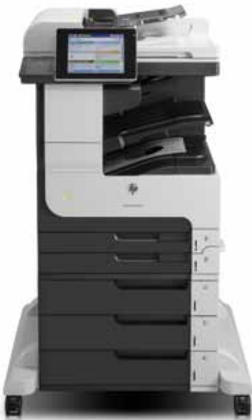
HP LaserJet Enterprise MFP M725z

Enable large-volume printing on a wide range of paper sizes—up to A3—with a 4,600-sheet maximum input capacity. 2 Preview and edit scanning jobs. Centrally manage printing policies. Safeguard sensitive business information.