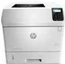
HP LaserJet Enterprise M605n

Accelerate business results with outstanding print quality. Tackle large jobs and equip workgroups for success wherever business leads. 2 Easily manage and expand this impressively fast, versatile printer—and help reduce environmental impact.