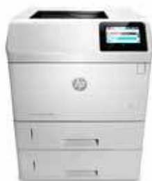
HP LaserJet Enterprise M605x