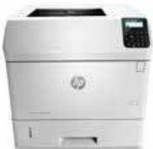
HP LaserJet Enterprise M605dn