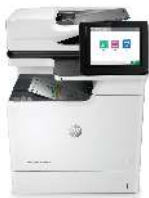
HP Color LaserJet Managed MFP E67650dh

This HP Color LaserJet MFP with JetIntelligence combines exceptional performance and energy efficiency with professional-quality documents right when you need them—all while protecting your network with the industry's deepest security. 1