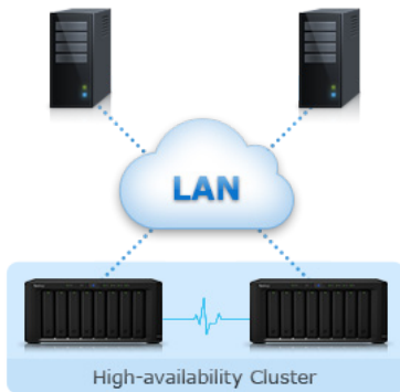
Figure 1) Reliability, Availability & Disaster Recovery

Synology High Availability ensures seamless transition between clustered servers in the event of server failure with minimal impact to businesses.