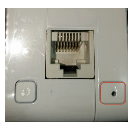
Step 4: Wait for 2 min for the device to fully power on after reset.

Step 3: Use a paper clip to press and hold the Reset Button for 30 second.