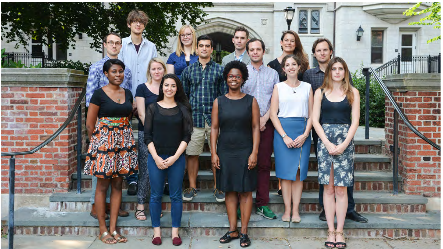
Below: Graduate Students in The Yale Department of French, Fall 2015