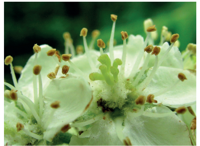
Hermaphrodite white flowers with 5 petals, 5 styles and numerous stamens.

Diseases of apple, such as European canker of apple ( Nectria galligena ) and apple scab ( Venturia inaequalis ) can affect the service tree and cause premature leaf fall 8 . Across Europe, the species is very rare and its genetic diversity is threatened mainly due to the reduction in number of individuals and disturbance of the natural populations by human activities 6,11 .