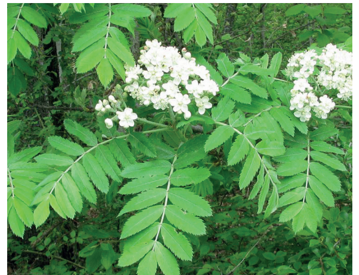
The small white flowers appear in the spring and are insect pollinated.