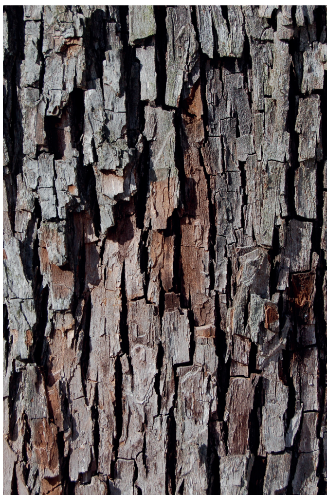
Dark brown bark with rectangular fissures.