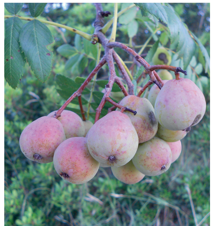
The fruits are used for a wide variety of culinary purposes.