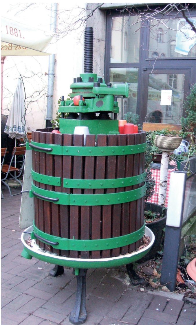
Traditional fruit press used in Germany. The juice of apples is often mixed with service tree fruits and fermented obtaining the Apfelwein, the wine of apple.