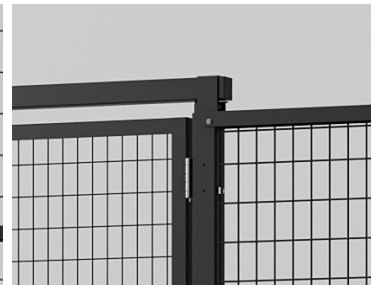
Adjustable Header Bar