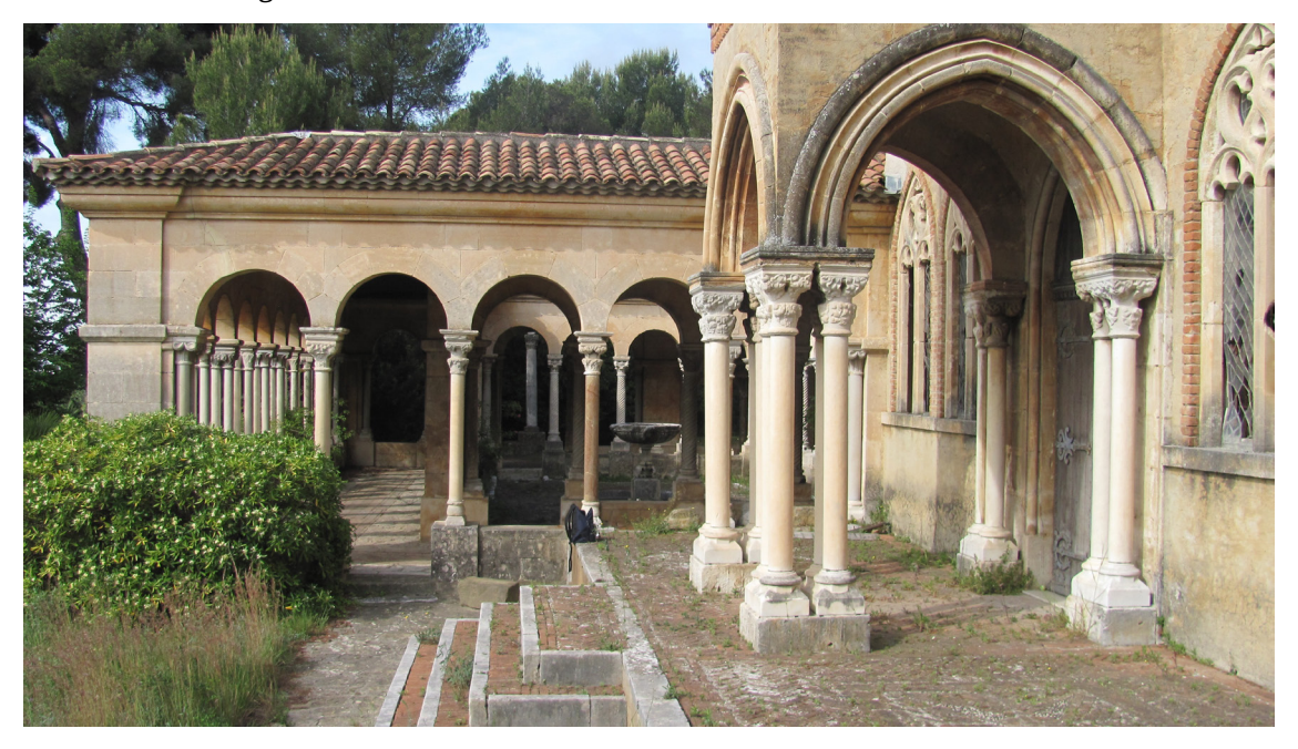
Fig. 9: Cloister in the "Abbaye de Roseland", Nice, France

In April 1923 in Nice, Larcade acquired Count Appraxine's property baptised "the Abbey of Roseland." Following in the footsteps of his predecessor, he immediately undertook a series of transformations that included not only the gardens but also various buildings. He created a complex of features: a chapel, a "fake" cemetery, and cloisters made up of "antiques" and medieval sculptures (fig.9).<sup>49</sup> Open on three sides, the cloisters are comprised of two series of columns and capitals, belonging to different periods and structures. The first line of twenty-six columns would come from the Daurade monastery in Toulouse; the exterior arcade features elements attributed to the cloister of Bonnefont-en-Comminges.<sup>50</sup>