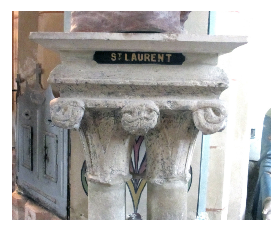
Fig. 4: Capital from the cloister of the Benedictine abbey of Saint-Laurent-sur-Save, Parish church, Saint-Laurent-sur-Save, Haute-Garonne, France

through the radical socialists who were particularly present and active in the south-west of France. Furthermore, the destruction and reuse of cloisters formed part of the nineteenth century urban renewal process. Cities of all sizes razed their ramparts, mapped out new streets and used leftover 'useless' spaces to construct buildings for the growing urban population. In this way, the convent of the Carmelites of Toulouse was replaced by a market hall.