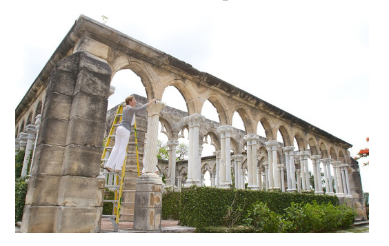
Fig.2: Cloister of "Montréjeau", Paradise Island, Bahamas

The stylistic proximity sometimes causes confusion among antique dealers, collectors, as well as art historians tasked with identifying the origin of sculptures in collections in the United States. For example, the French cloister exhibited at The Cloisters in New York