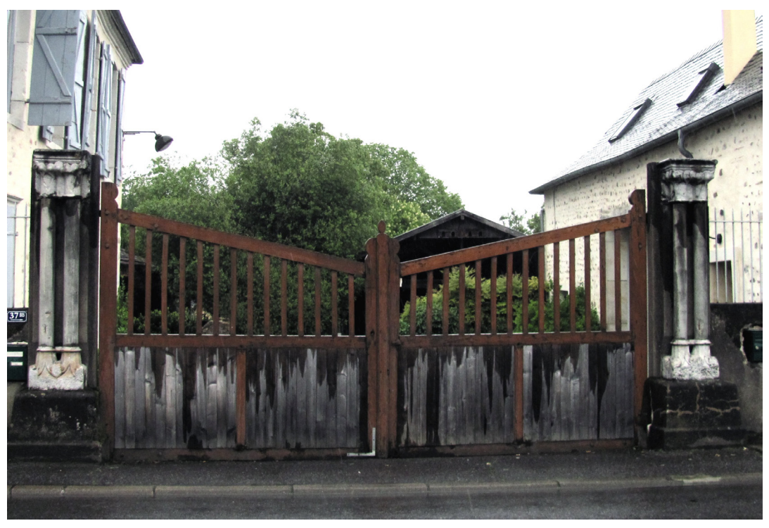
Fig. 3: Portal with colums from the couvent of the Franciscan monastery, Morlaàs, Pyrénées-Atlantiques, France

However, it was the Religious wars that proved to be most devastating in this region. Entire communities were wiped out and monasteries razed to the ground. Protestant troops found an opportunity for lucrative commerce during a time of upheaval by selling the beautiful architectural fragments. The Franciscan cloisters at Morlàas and of Montauban were duly dismantled and sold to the highest bidder. To this day, parts of the cloisters can be found arching over doorways of town houses (fig. 3).