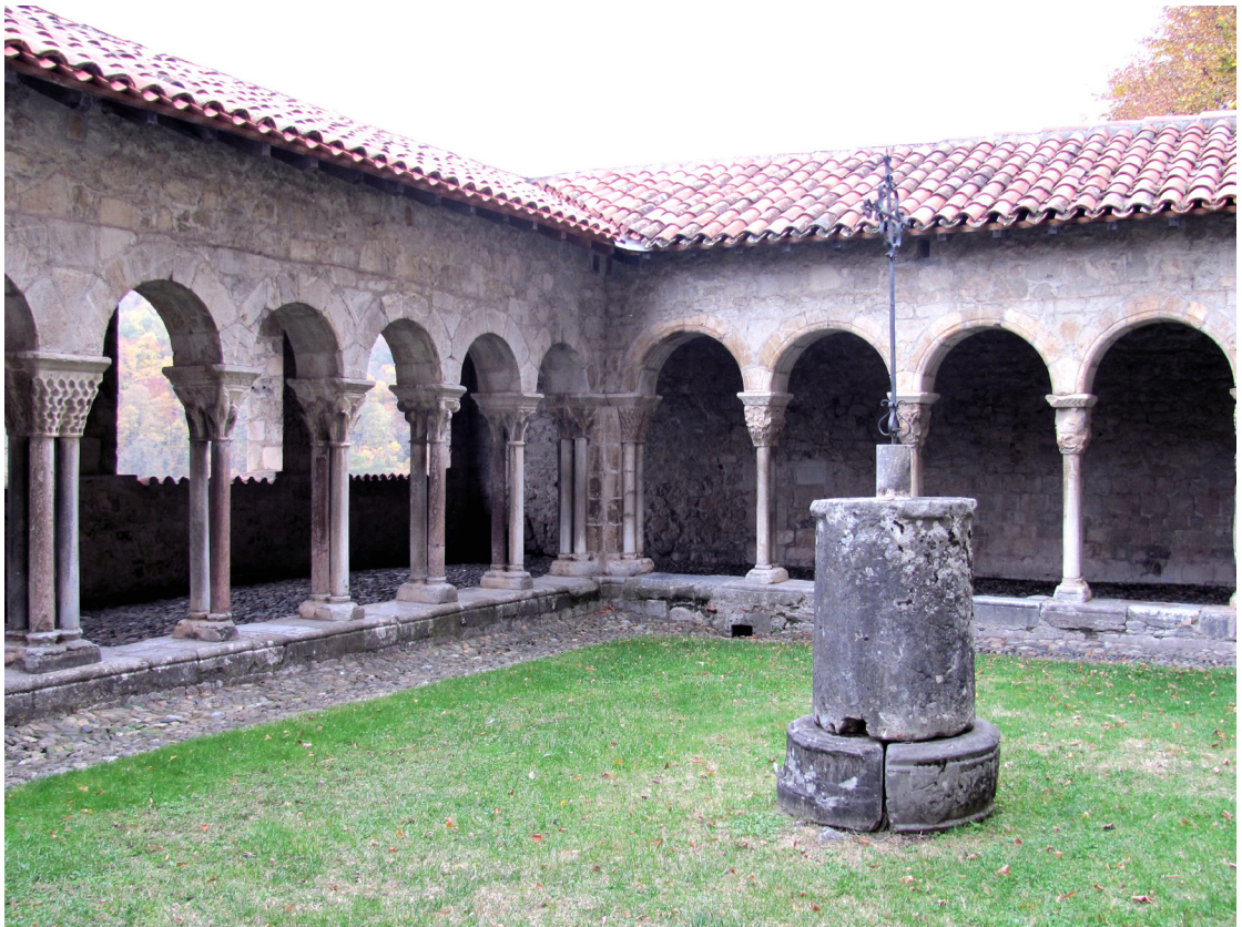
Fig. 1: Cloister of Saint-Bertrand-de-Comminges, Haute-Garonne, France

From the eleventh up to the fifteenth century, the religious world was redrawn by the growing stream of pilgrims on the Pyrenees roads towards Santiago de Compostela and by the successful establishment of monastic orders. These created a considerable body of architectural and artistic heritage in the region.