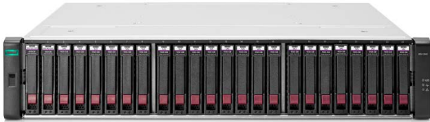
HPE MSA 2042 Storage (SFF)