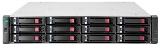
HPE MSA 2042 Storage (LFF)

The MSA 2042 further drives the MSA 2040 family into the world of flash acceleration with a new set of MSA models which includes 800GB of flash capacity in all SFF and LFF configurations. In addition to including 2x400GB Mixed Use SSDs in the base configuration, the MSA 2042 also includes a rich set of software features as standard including 512 Snapshots, Remote Replication and Performance Tiering capabilities, all at a very attractive price compared to other hybrid configurations. The 800GB of SSD capacity can be used as Read Cache or as a start to building a fully tiered configuration. With the inclusion of the Advanced Data Services SW License, customers can choose how to best utilize these SSDs to provide the optimal flash acceleration for their performance hungry applications. Both Read Cache and Performance Tiering utilize a real-time tiering algorithm which works without user intervention to place the most accessed data on the fastest medium at the right time. The MSA 2042 will dynamically move hot pages up to SSD for flash acceleration and move cooler, more stagnant data back down to spinning media as workloads change in real time hour-to-hour, day-to-day, and week-to-week. All done hands free and without any management overhead from the IT manager.