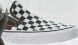
ON, WHITE BROWN