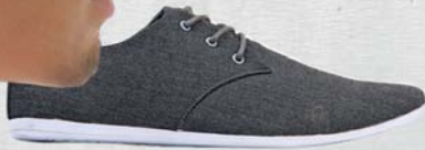
LOW TOP, CANVAS