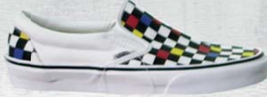
SLIP ON, PRIMARY