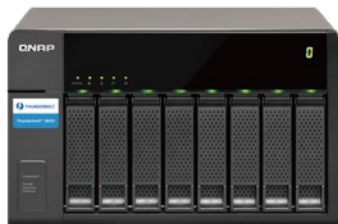
TX-500P / TX-800P