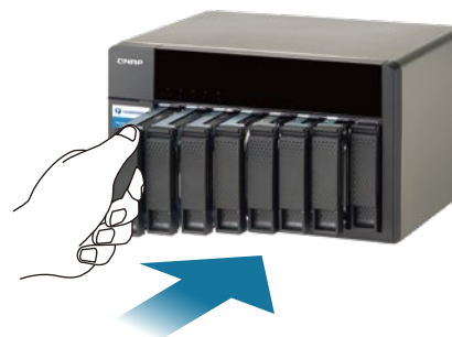
TX-500P / TX-800P