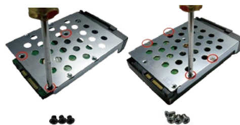
2.5" HDD / SSD