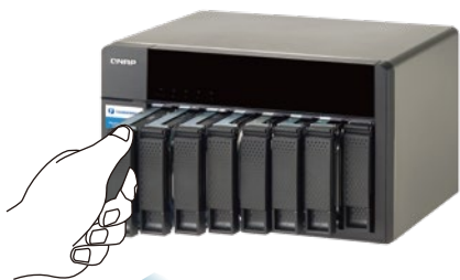
TX-500P / TX-800P