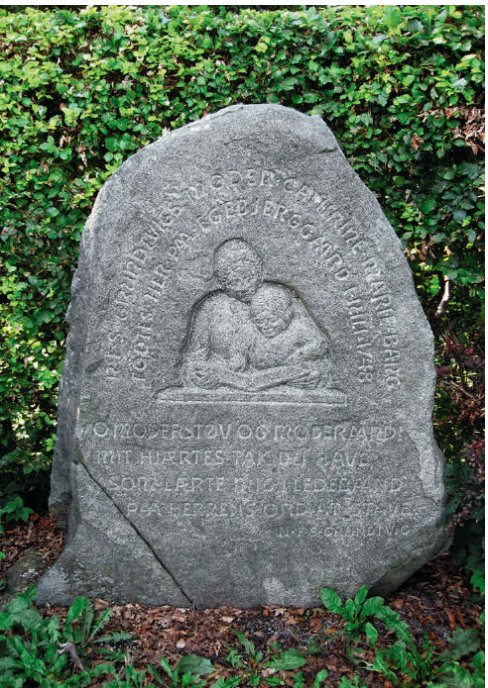
8. Memorials to Grundtvig's parents.