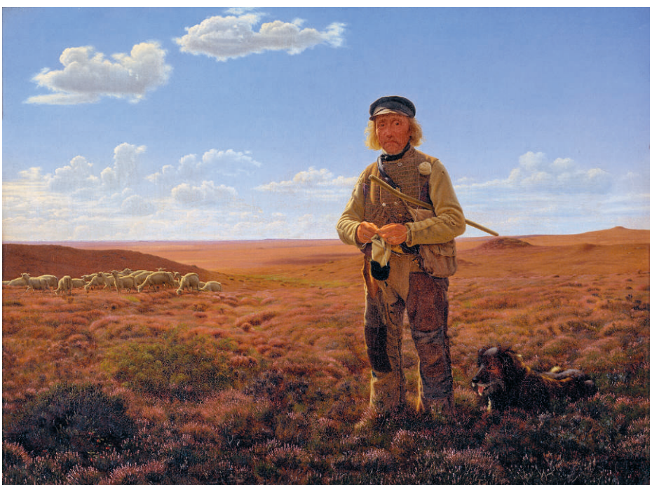
Above. The fertile fields of Zealand. Marklandskab med en bro , Vilhelm Kyhn, 1858. SMK, National Gallery of Denmark. Below. The Jutland heath. En jysk fårebonde på heden , Frederik Vermehren, 1855. SMK, National Gallery of Denmark.