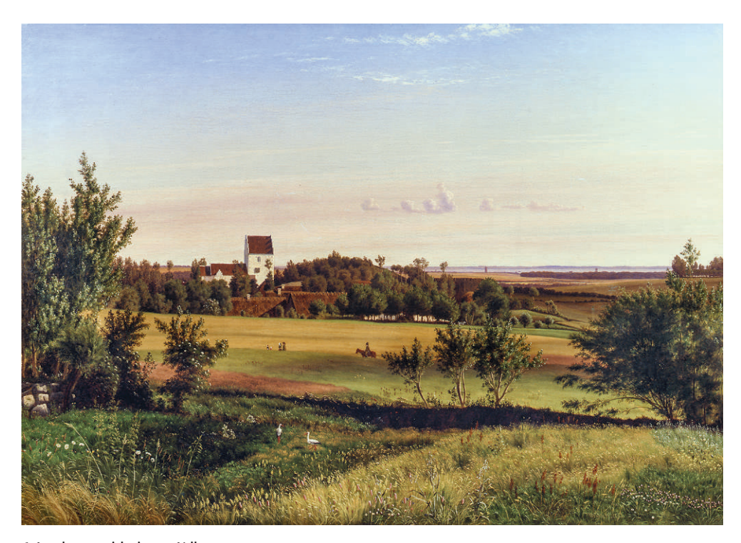
6. Landscape with view to Udby. Painting 1853, Vilhelm Kyhn. Frederiksborg Museum of National History.