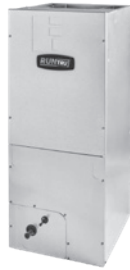
A4AH4 Multi-position Air Handlers