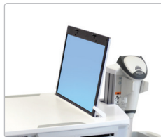
Laptop: SLA: #SV42-6101-X* LiFe: #SV42-6102-X*