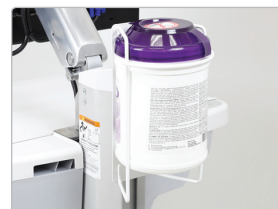
SV Sani-wipes Holder