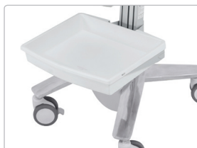
SV Front Tray