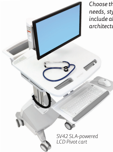
SV42 SLA-powered LCD Pivot cart

Choose the StyleView medical cart that best meets your caregiving needs, style and workflow. Our market-leading StyleView carts include all the features that caregivers ask for, with all the open architecture and quality construction that IT departments require.