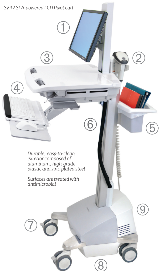
SV42 SLA-powered LCD Pivot cart

Durable, easy-to-clean exterior composed of aluminum, high-grade plastic and zinc-plated steel