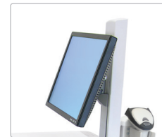
LCD Pivot: SLA: #SV42-6301-X* LiFe: #SV42-6302-X*

* Due to regional power requirements, part numbers vary by country. See ergotron.com for specific part numbers.