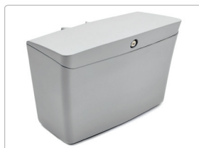
SV Storage Bin