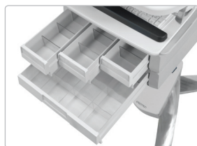
Several drawer configurations