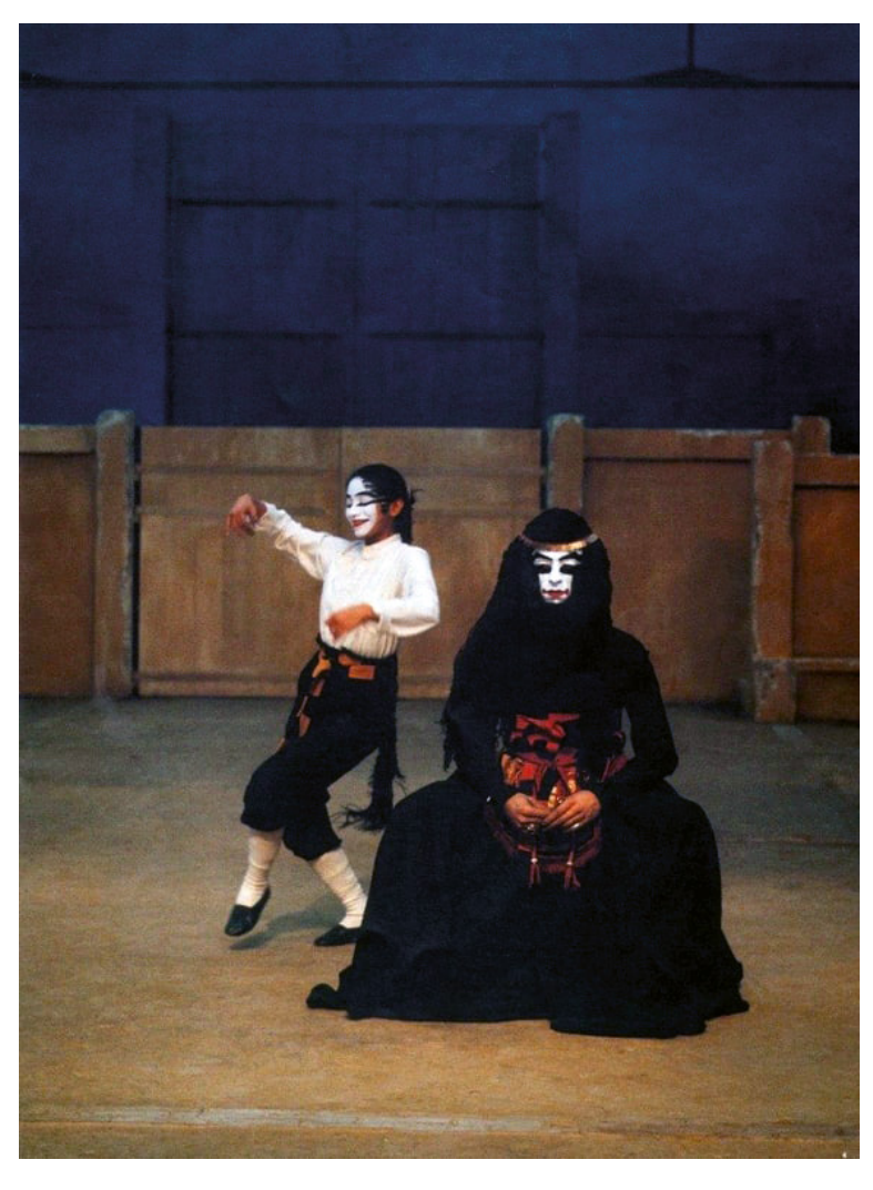
Plate 1 Iphigeneia dances innocently for her father Agamemnon in the first part of Les Atrides . With gratitude to Théâtre du Soleil for kind permission