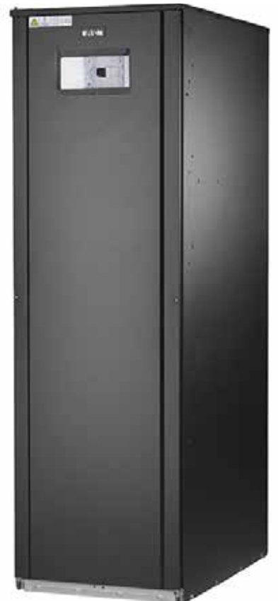
Eaton 93P/E small battery cabinet for 93PM and 93E units, 30-150kVA

Contact local Eaton sales for support with runtimes and battery cabinet selection