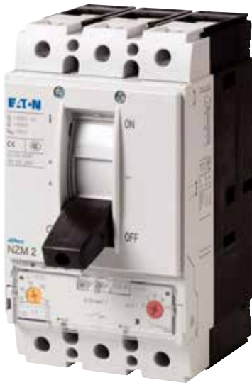
Eaton Circuit-breaker, 3p, 200A, NZMN3-A200

Kits include a breaker, and a shunt trip coil for remote tripping. 700A version also includes the extension handle. See separate datasheets for more detailed info.