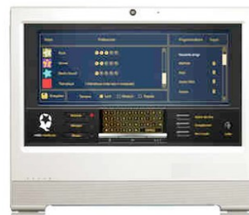
Instore Radio Playing advertising and music

© 2018 by Shuttle Computer Handels GmbH (Germany). All information subject to change without notice. Pictures for illustration purposes only.