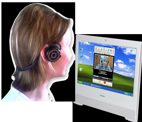
Communication Email, VoIP, Messenger, Blog, Video Conferencing