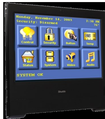
Control Surveillance, Home Automation, Control device