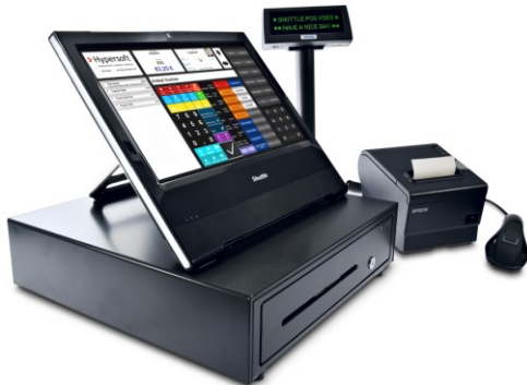
P.O.S. Point of sales