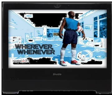
Digital Signage Visual advertising, entertainment, displaying information in public areas