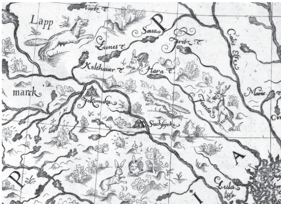
Figure 9.6: Northern Sweden. Detail from Anders Bure, Orbis arctoi nova et accurata delineatio , Stockholm, National Library of Sweden. 1626. Digital version released into public domain by National Library of Sweden.

the north to the Far North in the areas far away from ‘civilization.’ Yet none of these animals were in fact restricted to northern habitats—they were found in much of Continental Europe. In placing these animals in the North, a special case had to be made for their belongingness there.