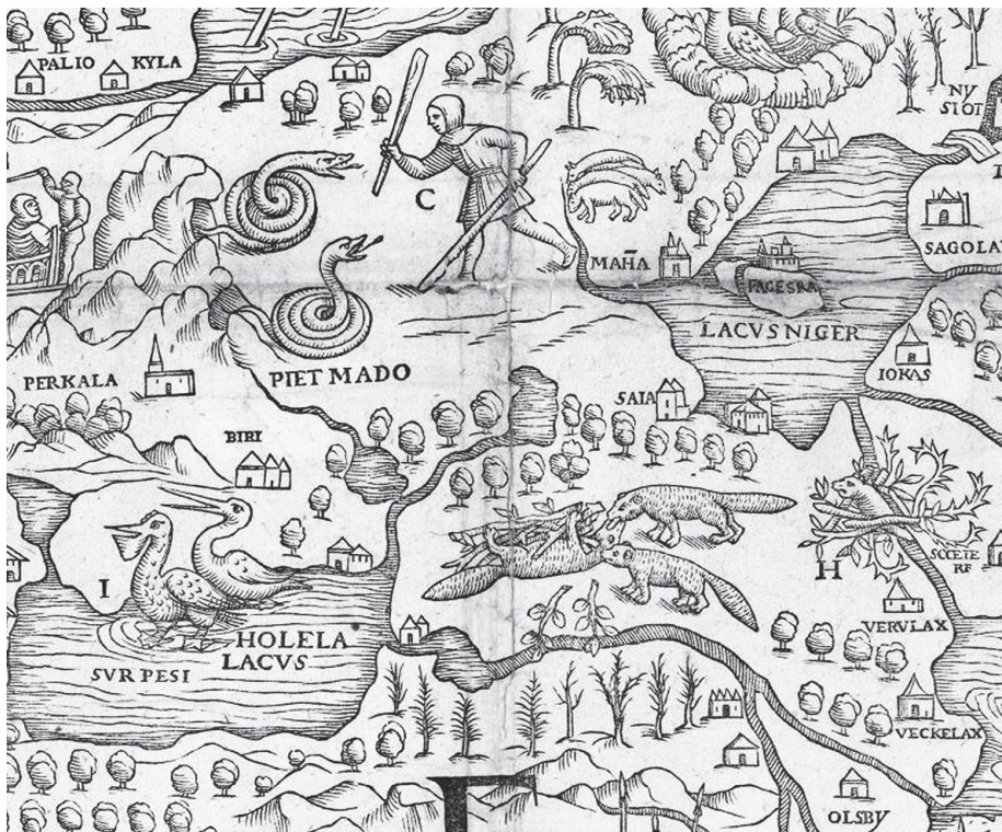
Figure 9.7: Beavers working together to move branches for their dam. Detail from Olaus Magnus, Carta marina , Uppsala University Library. 1539. Digital version released into public domain by Uppsala University Library.

on maps of northern Europe; rather, it became a staple of maps of northern North America, where beaver fur became a major trading commodity.