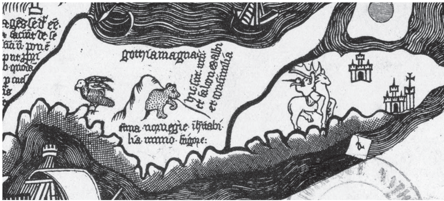
Figure 9.3: The Scandinavian Peninsula. Detail from a print of Apographon descriptionis orbis terrae [...] circa medium Saec. xv tabulae aeneae Musei Borgiani Velitris consignatae quod Camillus. Paris, Bibliothèque nationale de France, GE D-5369. 1797.

Yet the problem remains that brown bears also occur throughout Continental Europe. They are not restricted to Scandinavia. On Olaus Magnus's Carta marina a brown bear is drawn in Lithuania rather than Scandinavia. So while ten chapters of Historia de gentibus septentrionalibus are dedicated to the brown bear (one is about the polar bears in Iceland), the bear is not only Scandinavian. Olaus Magnus has a vague reference to the way that 'de nigris, ac ferocibus vrsis' (the fierce, black species of bear) is hunted 'in Aquilonaribus regnis' (in northern kingdoms) and tells an early medieval tale of a girl abducted and later impregnated by a bear in Sweden. 28 Primarily, he associates brown bears with Lithuania and Russia, which are 'reperiuntur terræ cavernosæ infinitis apibus, & savis plenæ' (dotted with caves that are full of innumerable bees and honeycombs). 29 Thus while acknowledging that the animal may exist in Scandinavia, Olaus Magnus assigned and drew the brown bear in another geography that he believed provided the most suitable habitat for the animal.