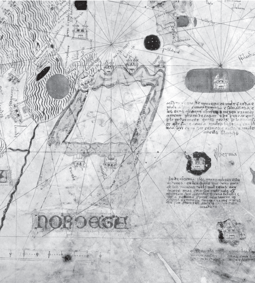
Figure 9.1: The interior of Norway is filled with animals, while a native riding a reindeer enters Sweden from the margins. Detail from Mecia de Viladestes, Carte marine de l'océan Atlantique Nord-Est , Paris, Bibliothèque nationale de France, GE AA-566. Reproduced with permission.