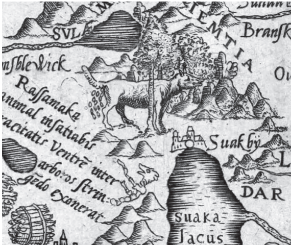
Figure 9.5: The wolverine. Detail from Liévin Algoet, Terrarum septentrionalium exacta novissimaque description per Livinum Algoet et aliis autoribus , Paris, Bibliothèque nationale de France, Département cartes et plans, GE B-2350 (RES). 1562. Reproduced with permission.

Sweden. 36 The wolverines on Carta marina are described in the accompanying Opera breve as ‘animali uoraci, liquiali per nome Fitticio la chiamano guloni, perche non intermetteno mai la loro uoracita se non quando i scaricano, ouer purgano il uentre stringendosi fra doi arbori’ (voracious animals, whose nickname is ‘gluttons’ [ gulo ], because their voracity lessens only when they empty themselves, or purge their stomachs by squeezing themselves between two tree trunks). 37 On Algoet’s map from 1562, the wolverine is labelled as ‘Rassamaka animal insatiabus’ (rassamaka the insatiable animal) and is drawn squeezing between trees to defecate (Figure 9.5). 38 Later authors like Conrad Gessner and Edward Topsell would cite Olaus Magnus’s description and image of the gulo in their catalogs of animals. 39 Topsell tied the wolverine’s location in the North to the inhabitants of the North, saying that God placed it there ‘to express the abominable gluttony of the men of that Countrey’. 40 Although the wolverine was a uniquely northern species, it failed to make frequent appearances on maps of the north, perhaps because it was too newly described.