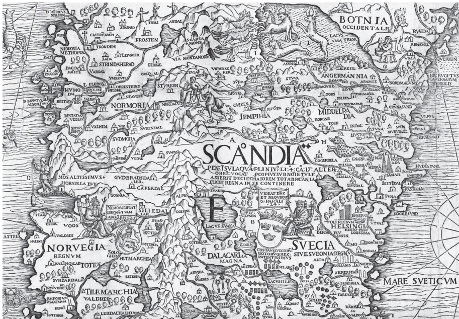
Figure 9.4: Scandia. Detail from Olaus Magnus, Carta marina , Uppsala University Library. 1539.

nature and allowed to remain in deserted places, herd together as their kind increases, and are sometimes pursued and hunted down). 35