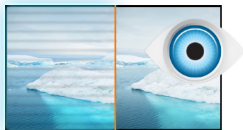
Flicker-free + Blue light

Available also with AMVA LED matrix: ProLite XB2483HSU-B3