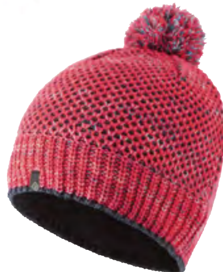
RH-00307 Hot Pink/Charcoal