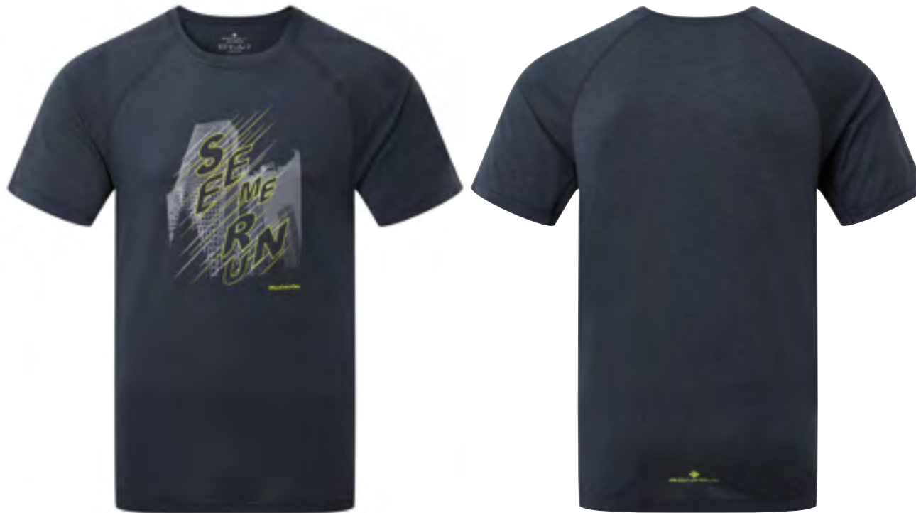
RH-00592 Charcoal/Fluo Yellow Graphic