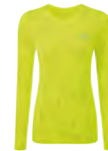
R629 Fluo yellow/Reflect