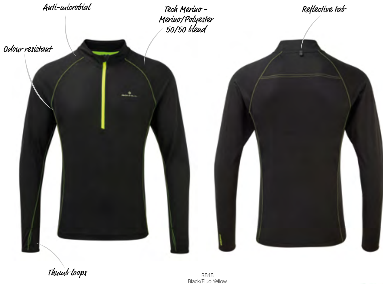
R848 Black/Fluo Yellow