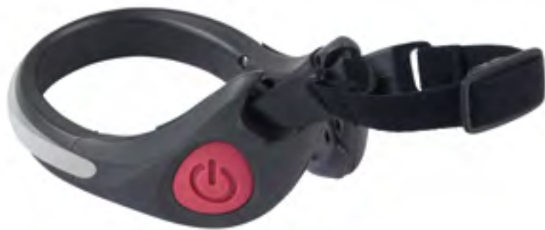
R829 Glow Red