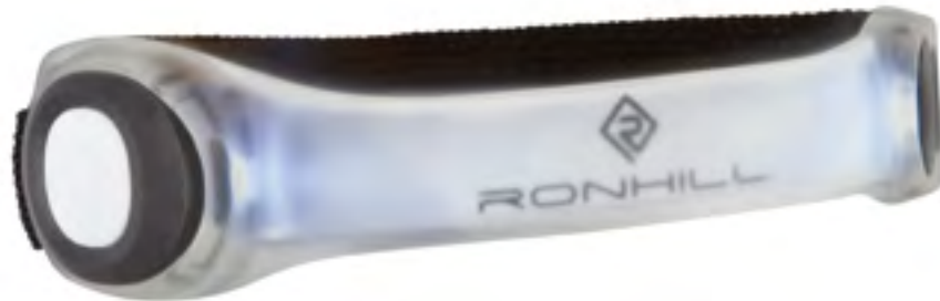
RH-00129 Glow White