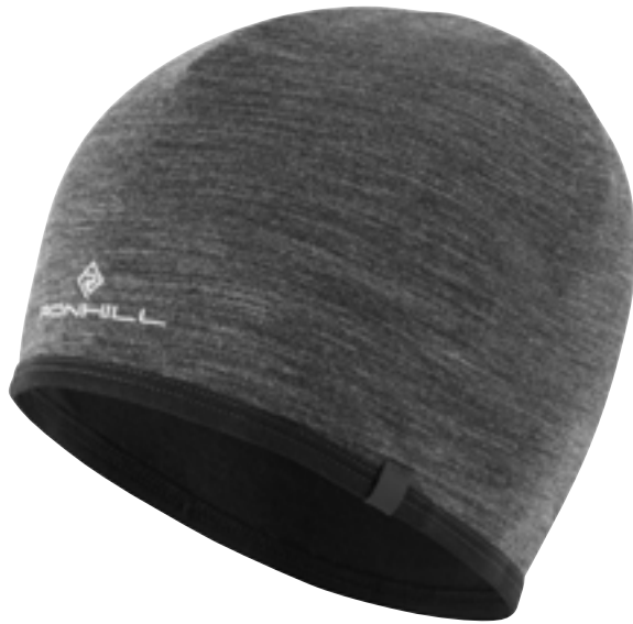
RH-00202 Grey Marl/Black

Fibre content: 50% Wool (Merino), 50% Polyester