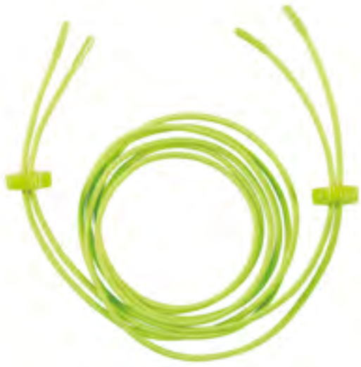
R010 Fluo Yellow