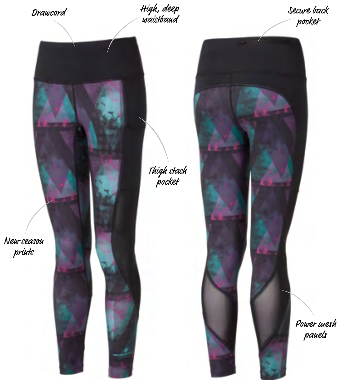
RH-00613 Multi Pyramid