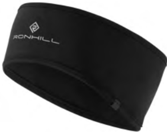
RO09 All Black