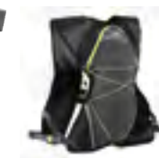
RH-00264 Charcoal/Fluo Yellow