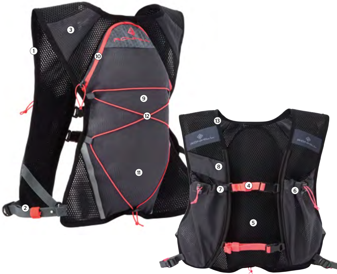
RH-00292 Charcoal/Hot Pink

Fibre content: 45% Polyamide, 55% Polyester