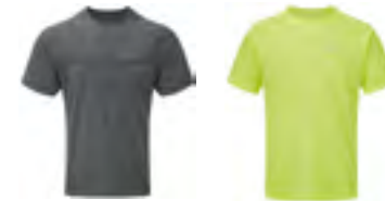
RH-00102 Grey Marl