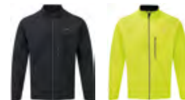
R009 All Black