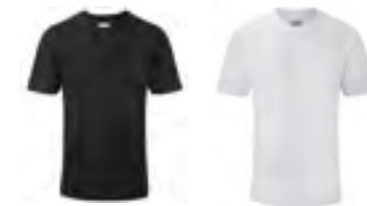
R009 All Black