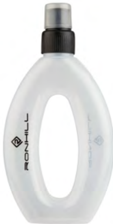
R350 Clear/Black 270ml