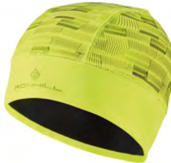
R629 Fluo Yellow/Reflect