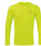
R010 Fluo Yellow