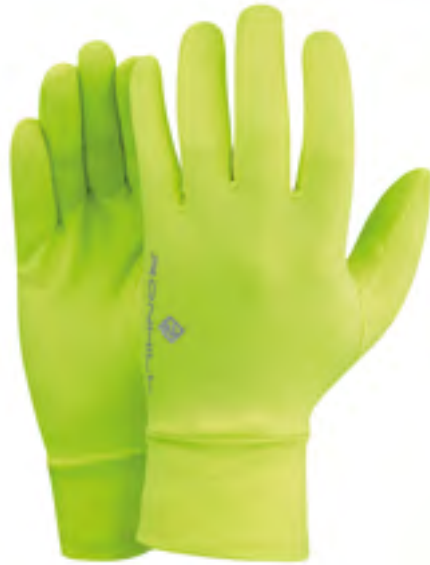
RO10 Fluo Yellow