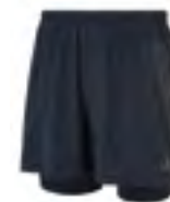
RO09 All Black