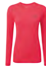
RH-00608 Hot Pink/Reflect