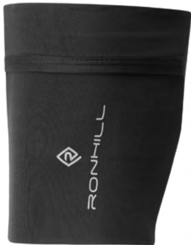
RO09 All Black