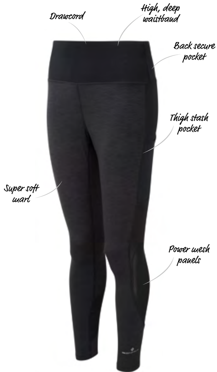
RH-00405 Charcoal Marl/Black