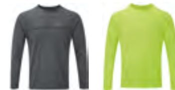
RH-00102 Grey Marl