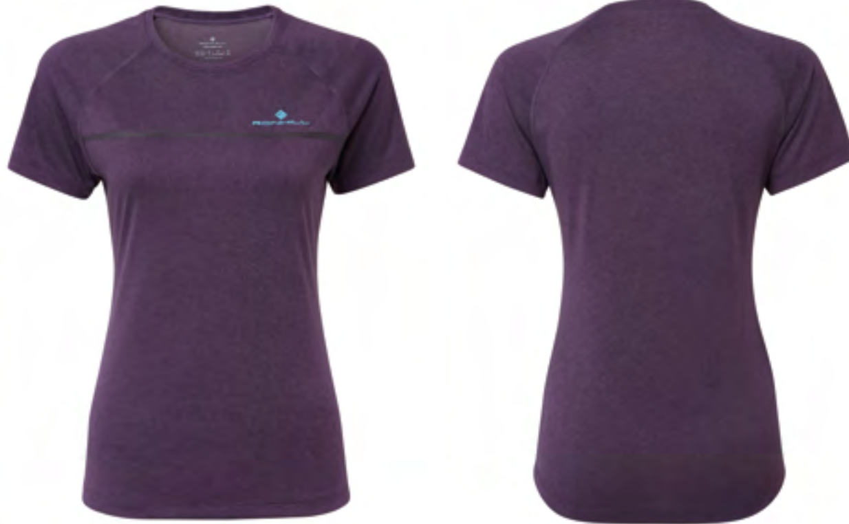
RH-00584 Blackberry Marl