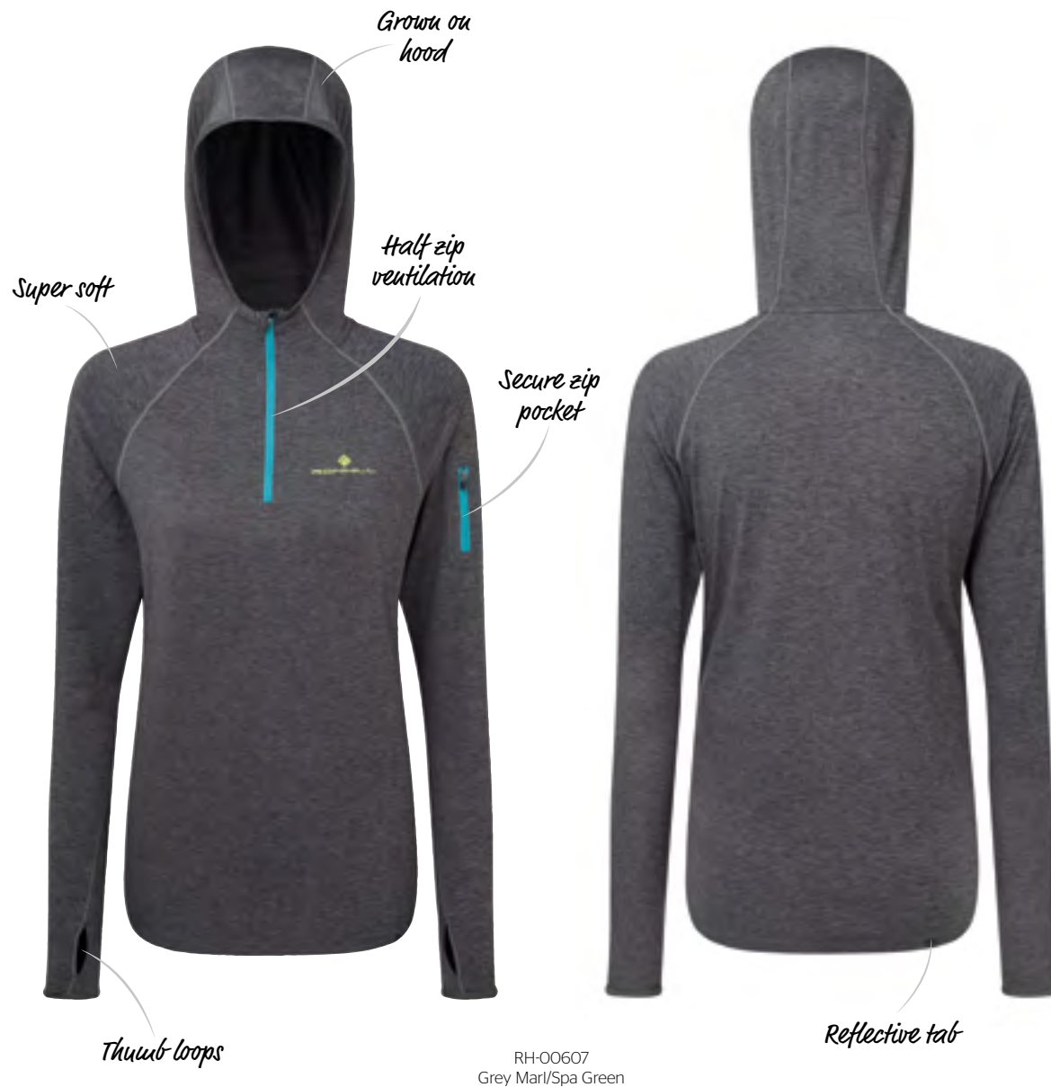
RH-00607 Grey Marl/Spa Green