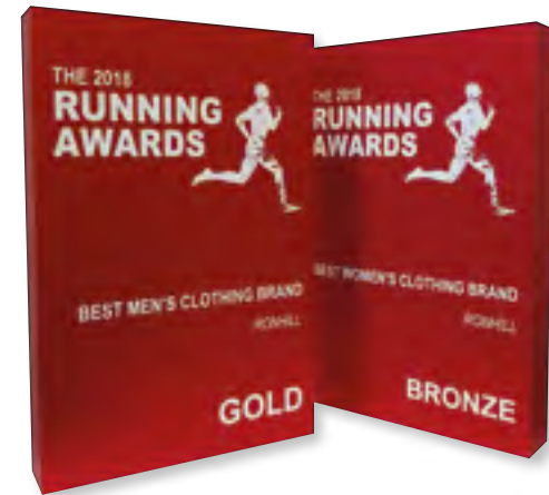
Two top awards for three consecutive years - 2016, 2017 and 2018