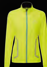
R629 Fluo Yellow/Reflect