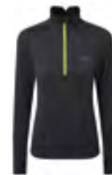
RH-00590 Charcoal Marl/Spa Green