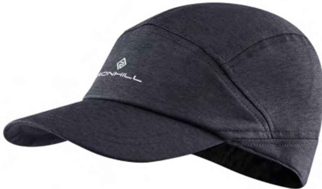
RH-00214 Charcoal Marl

Fibre content: 88% Polyester, 12% Elastane