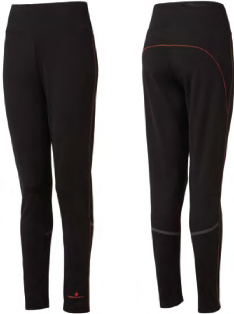
RH-00285 Black/Hot Pink