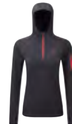
RH-00290 Charcoal Marl/Hot Pink