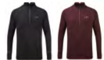
R848 Black/Fluo Yellow