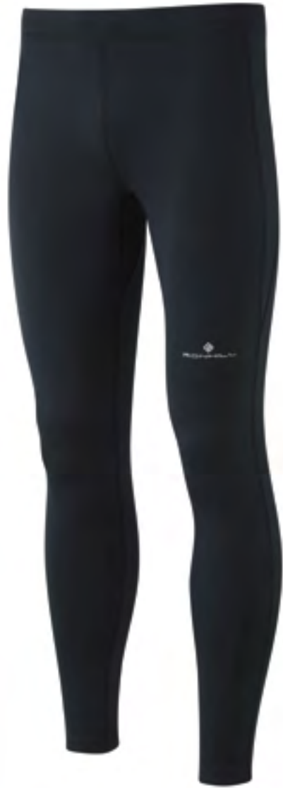
R009 All Black