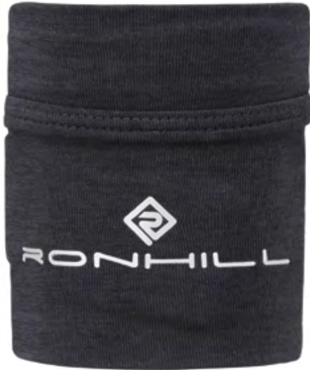
RO09 All Black