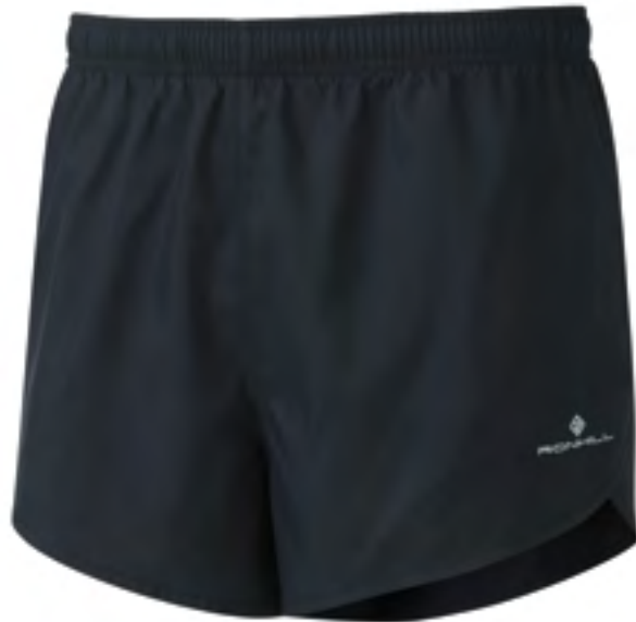
RO09 All Black