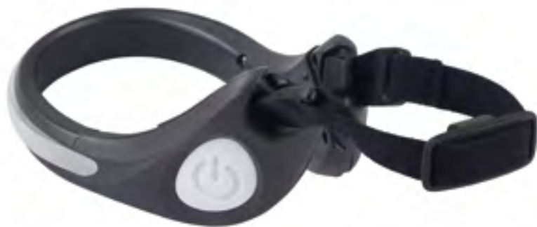
RH-00129 Glow White