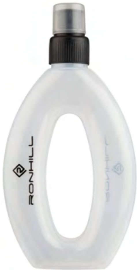
R878 Clear/Black 500ml