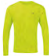
R629 Fluo Yellow/Reflect