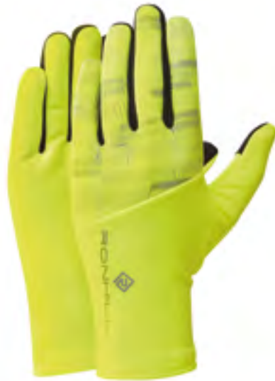
R629 Fluo Yellow/Reflect