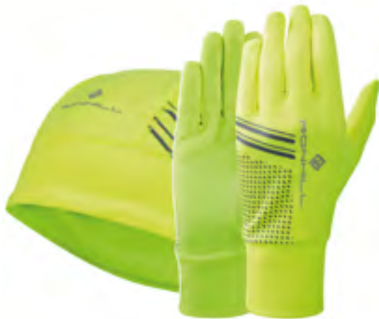
R042 Fluo Yellow/Black