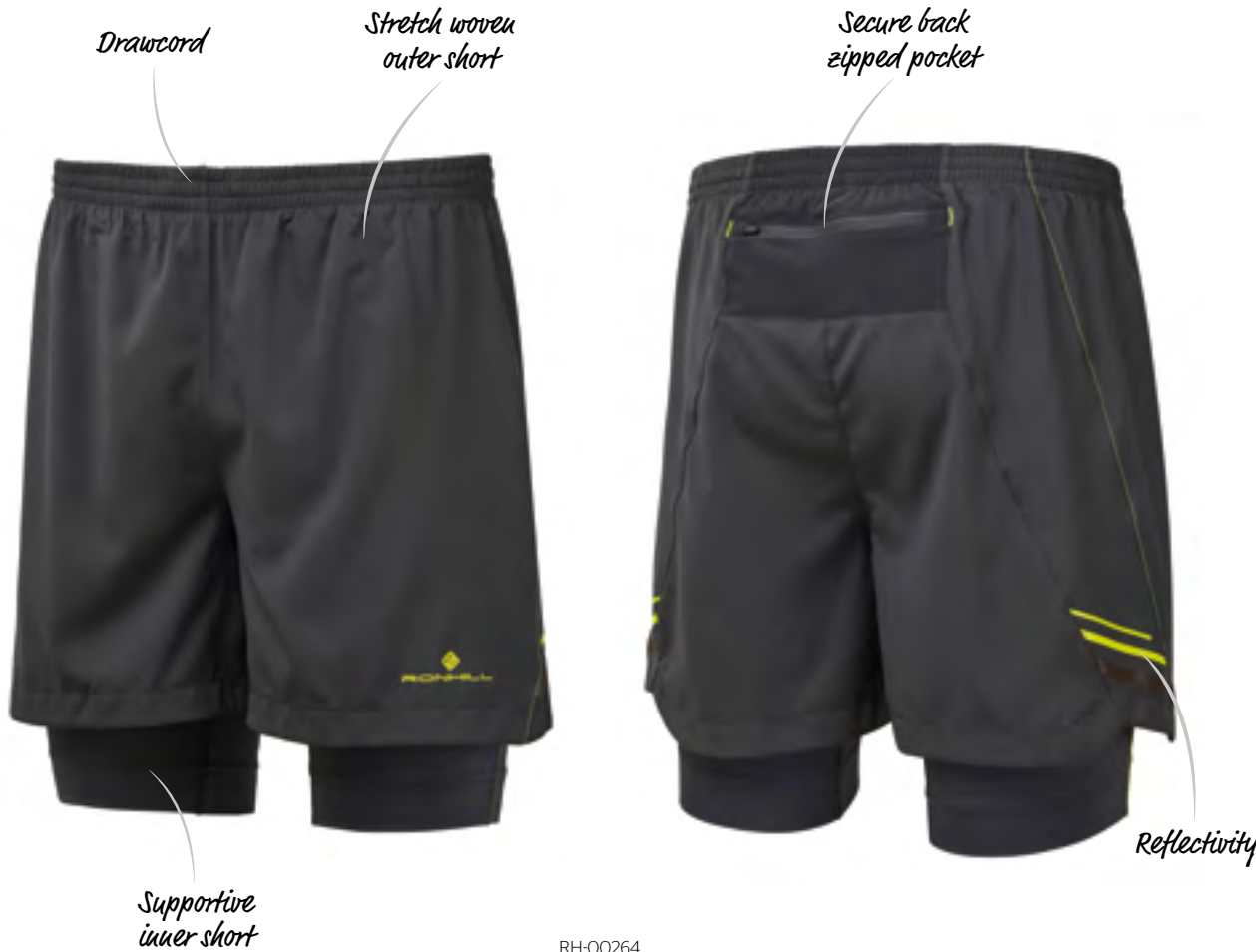
RH-00264 Charcoal/Fluo Yellow

Fibre content: Outer: 100% Polyester. Inner: 84% Polyester, 16% Elastane