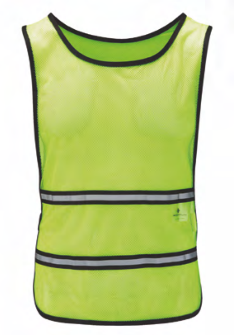
R010 Fluo Yellow