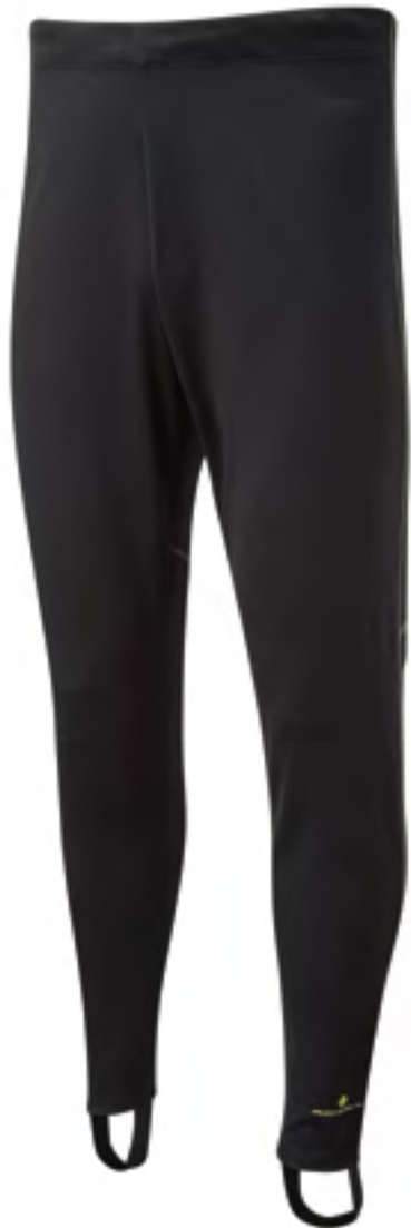
R848 Black/Fluo Yellow