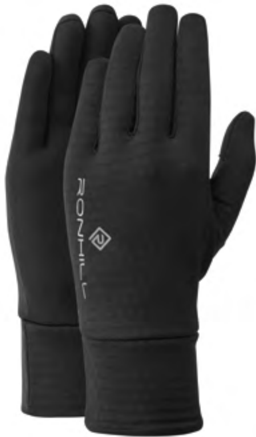
R009 All Black