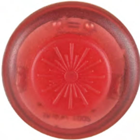
R829 Glow Red