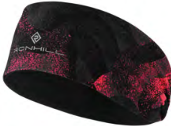
RH-00609 Hot Pink Wave