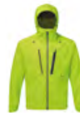
R010 Fluo Yellow