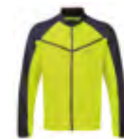
RH-00268 Fluo Yellow/Charcoal