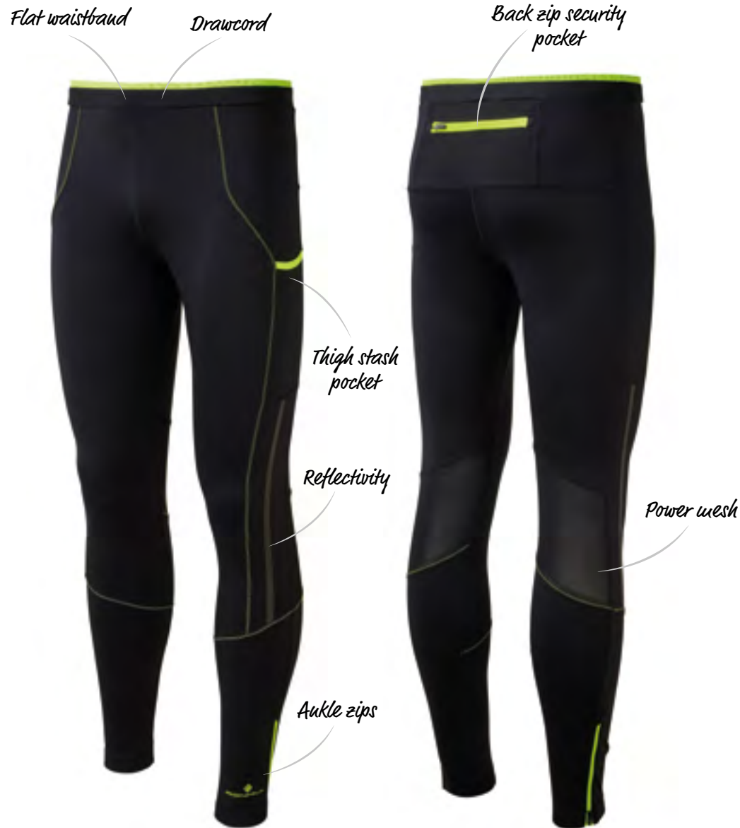
R848 Black/Fluo Yellow