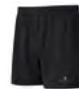
R009 All Black