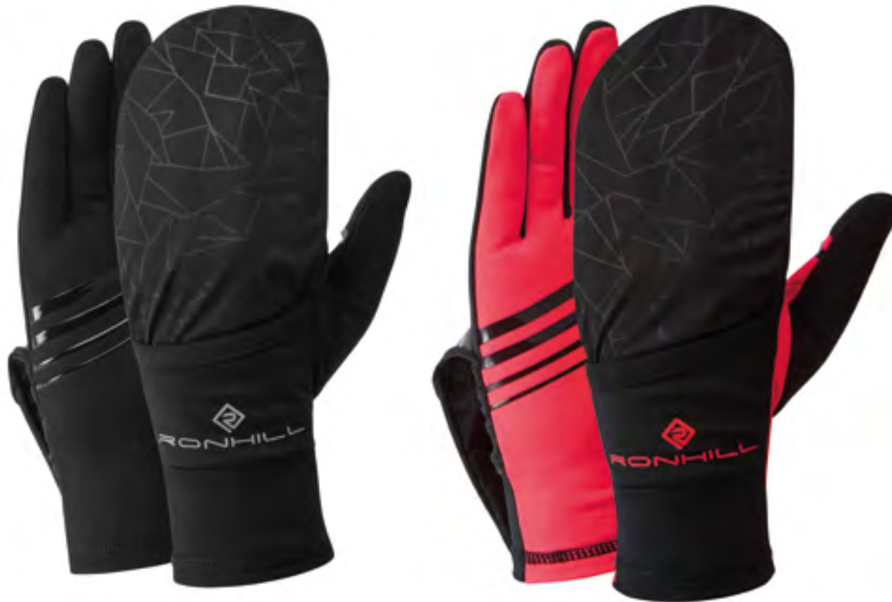
RH-009 All Black

Fibre content: 86% Polyester, 14% Elastane