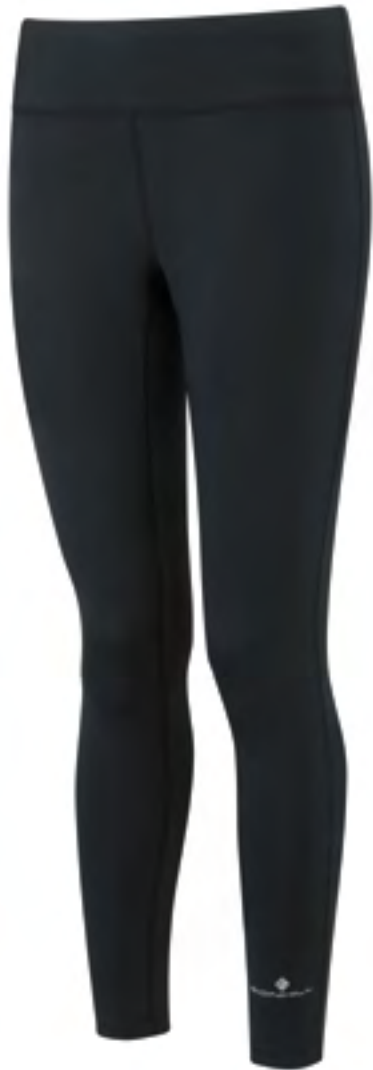
RO09 All Black