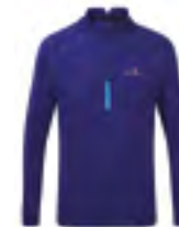
RH-00619 Deep Sea Marl/ Cardinal Orange