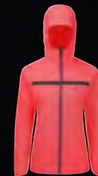
RH-00608 Hot Pink/Reflect