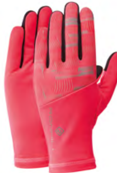
RH-00608 Hot Pink/Reflect