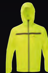
R629 Fluo Yellow/Reflect