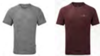
RH-00102 Grey Marl