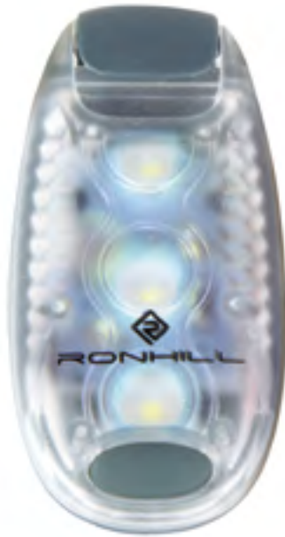
RH-00129 Glow White