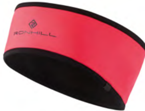
RH-00325 Hot Pink/Black