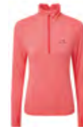
RH-00557 Hot Pink Marl/ Charcoal