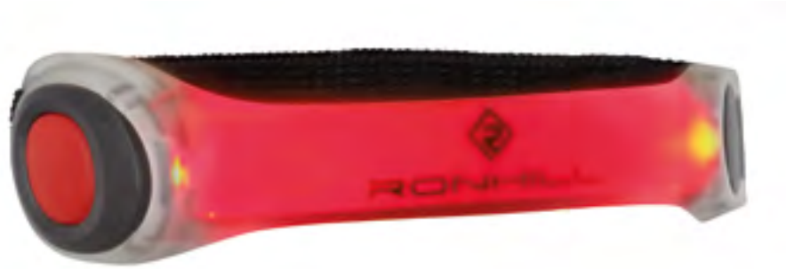
R829 Glow Red