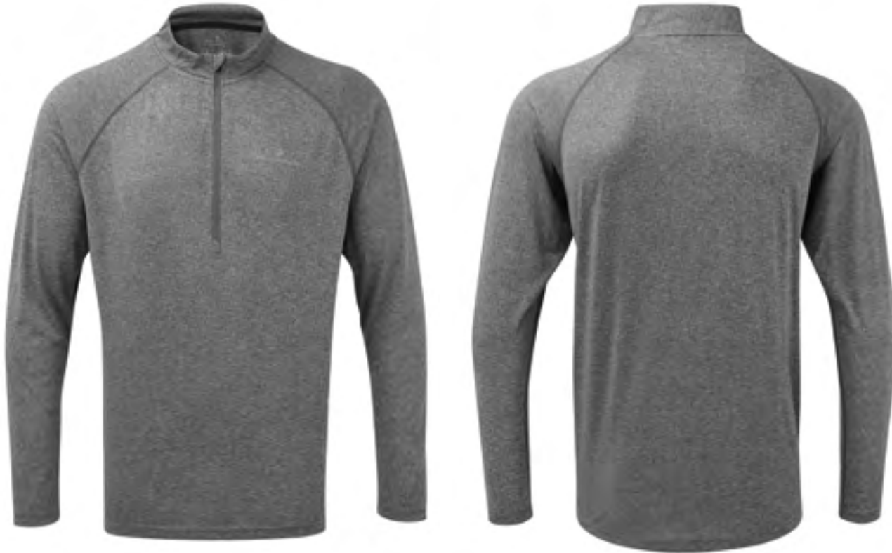
RH-00102 Grey Marl