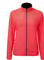
RH-00302 Hot Pink