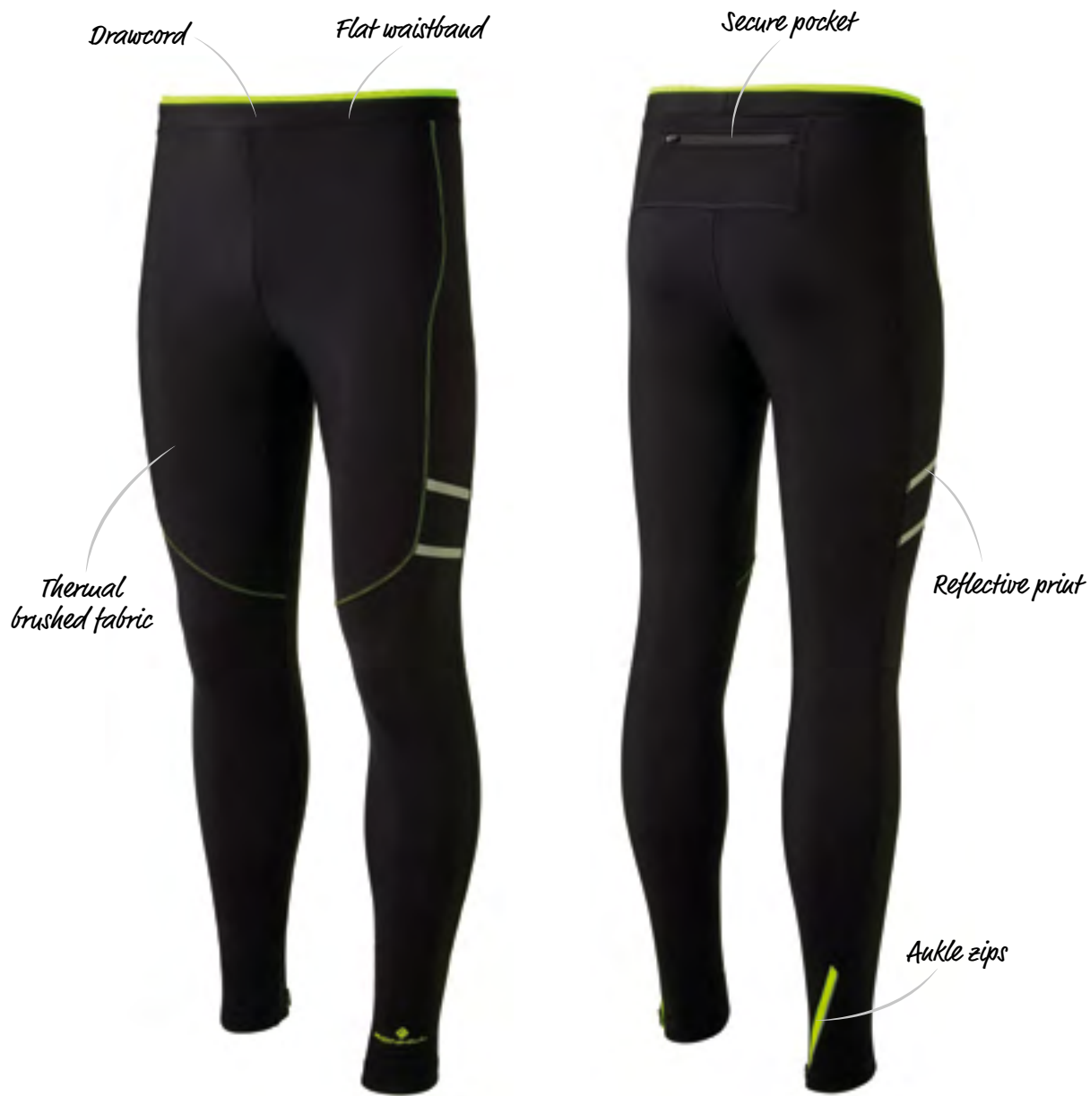
R848 Black/Fluo Yellow