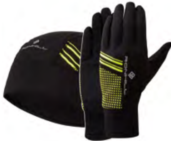
R848 Black/Fluo Yellow

Fibre content: 89% Polyester, 11% Elastane