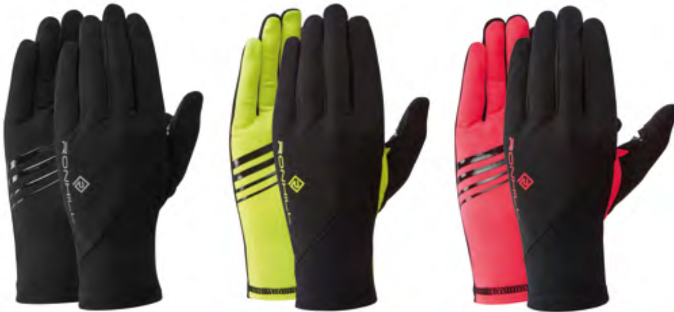
R009 All Black

This glove is an accessory in our Wind-Block series that have part or full windproof fabrics, which work better than fleece knit style fabrics on windy days.