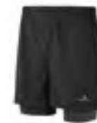
R009 All Black