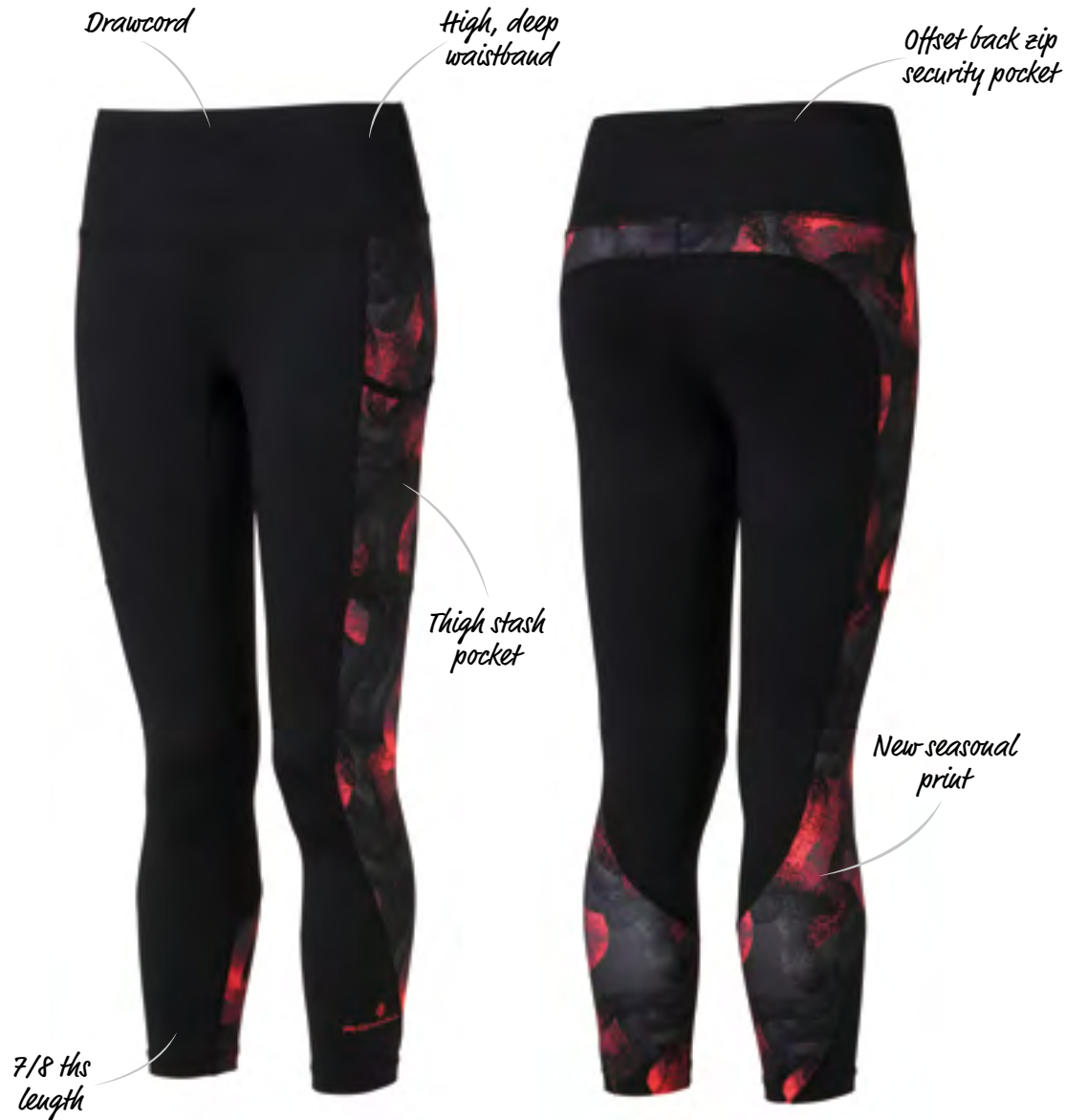
RH-00582 Black/Hot Pink Wave