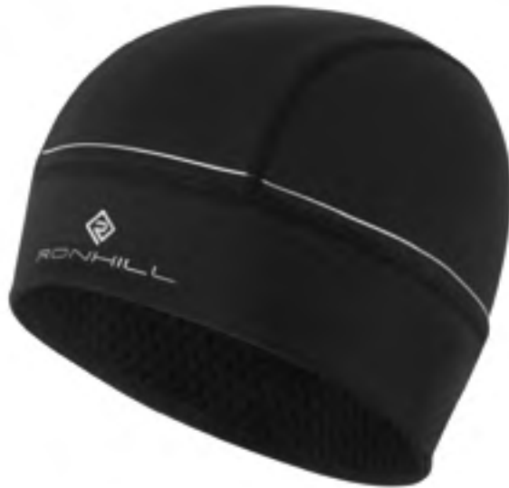
R009 All Black

Fibre content: 96% Polyester, 4% Elastane