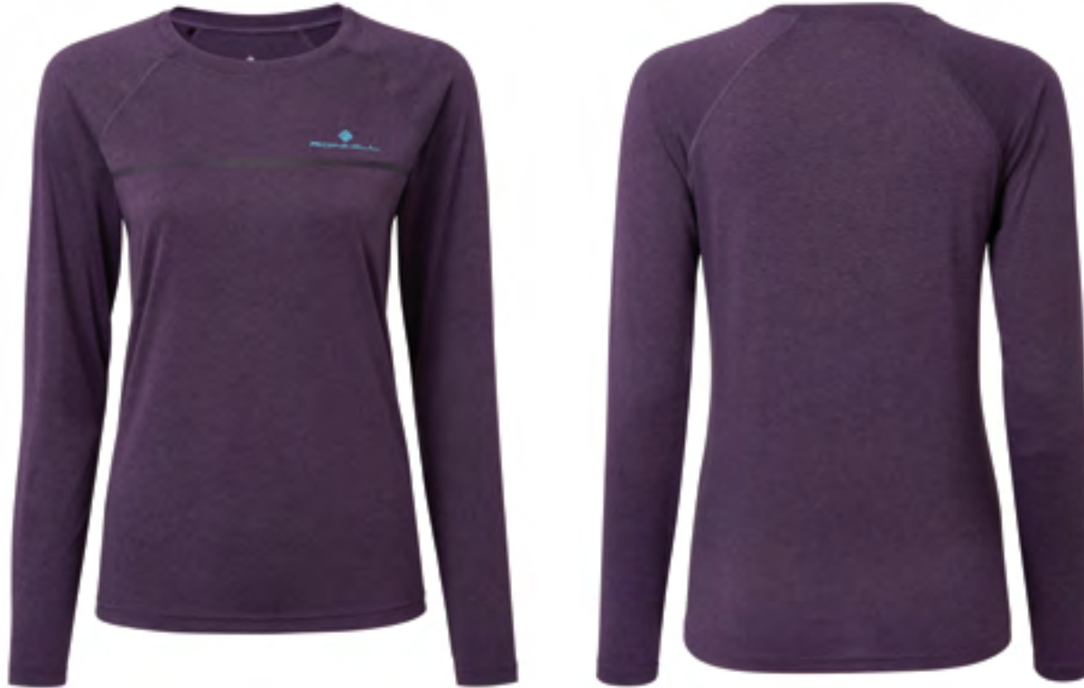
RH-00584 Blackberry Marl