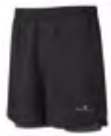
RH-00167 Black/Grey Marl