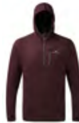
RH-00620 Fig Marl/Charcoal

Fibre content: 88% Polyester, 12% Elastane