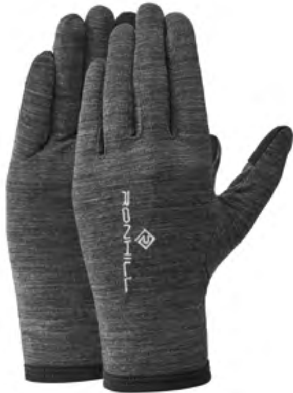
RH-00202 Grey Marl/Black