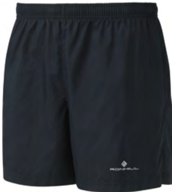
RO09 All Black