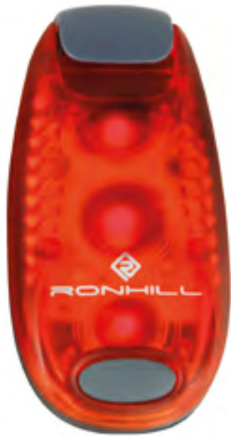
R829 Glow Red