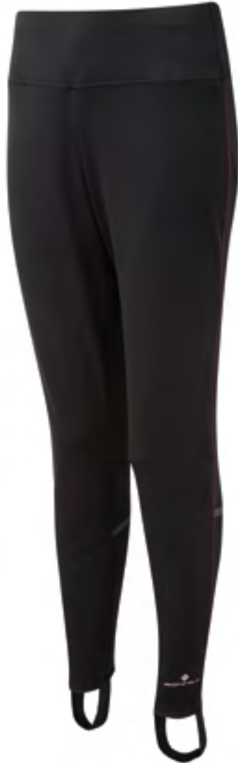
RO09 All Black