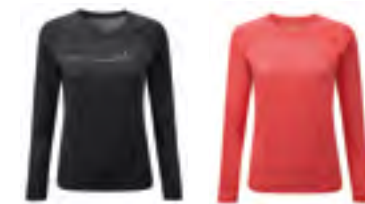
RH-00214 Charcoal Marl