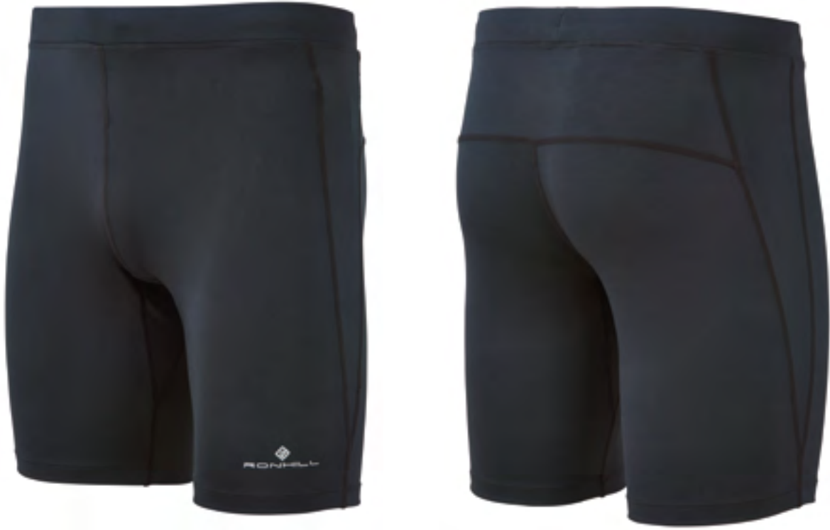
R009 All Black

Fibre content: 90% Polyester, 10% Elastane