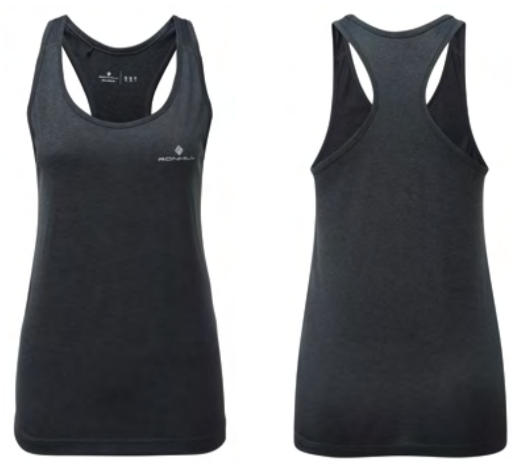
RH-00214 Charcoal Marl