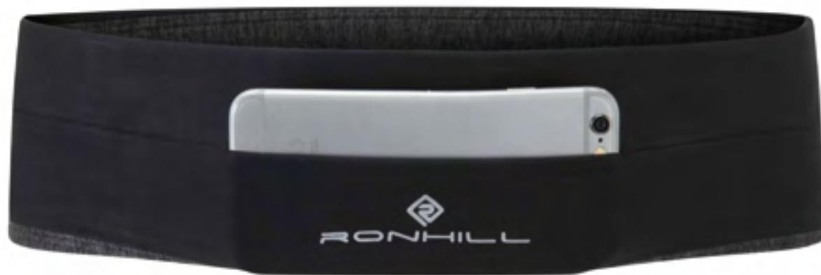
RH-00217 Black/Charcoal Marl