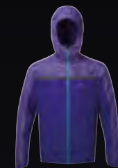
RH-00598 Deep Sea/Reflect