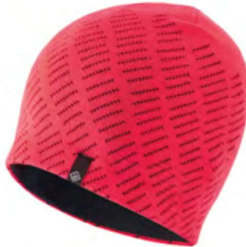
RH-00307 Hot Pink/Charcoal