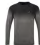
RH-00167 Black/Grey Marl