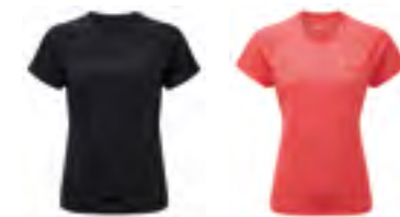
RH-00214 Charcoal Marl