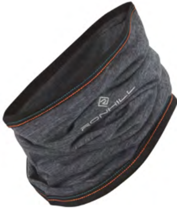
RH-00202 Grey Marl/Black

Fibre content: 50% Wool (Merino), 50% Polyester