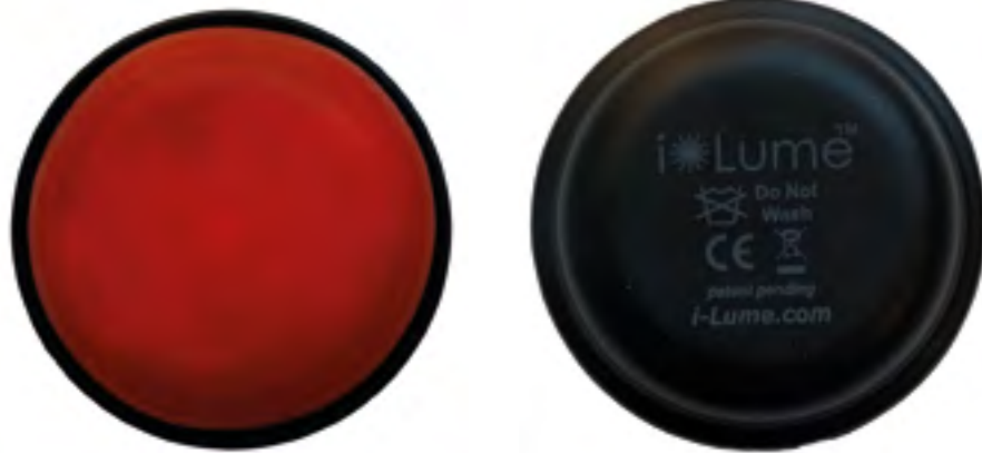
R829 Glow Red