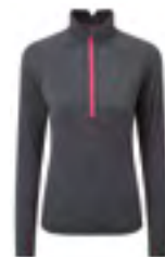
RH-00323 Grey Marl/Hot Pink