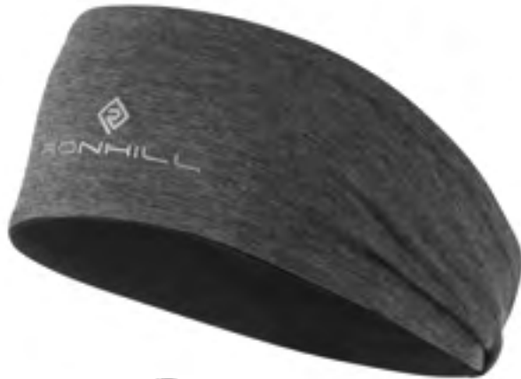
RH-00202 Grey Marl/Black

Fibre content: 88% Polyester, 12% Elastane