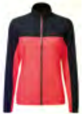
RH-00307 Hot Pink/Charcoal