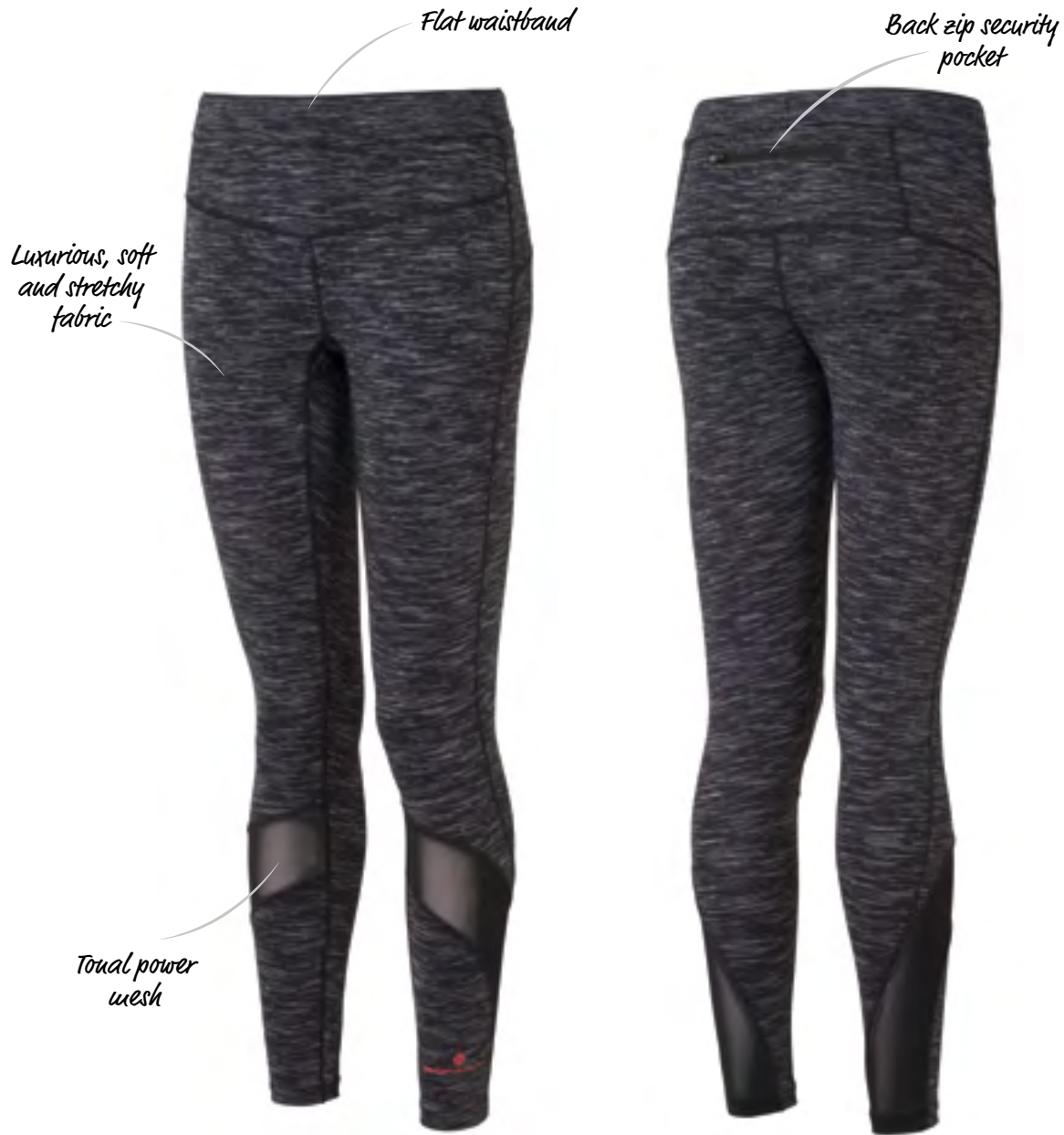
RH-00285 Black/Hot Pink