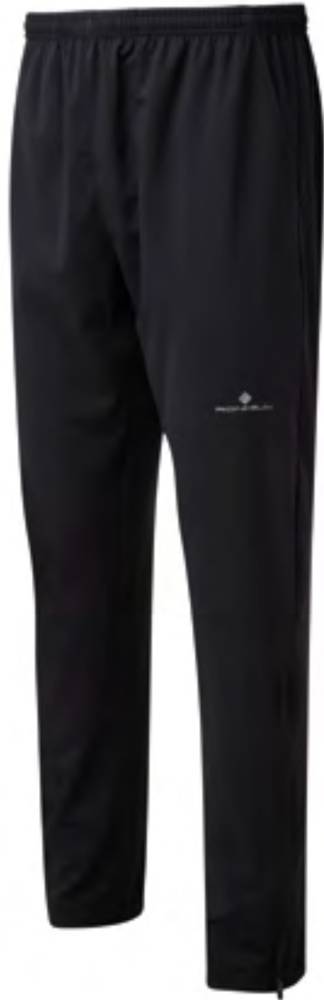
R009 All Black