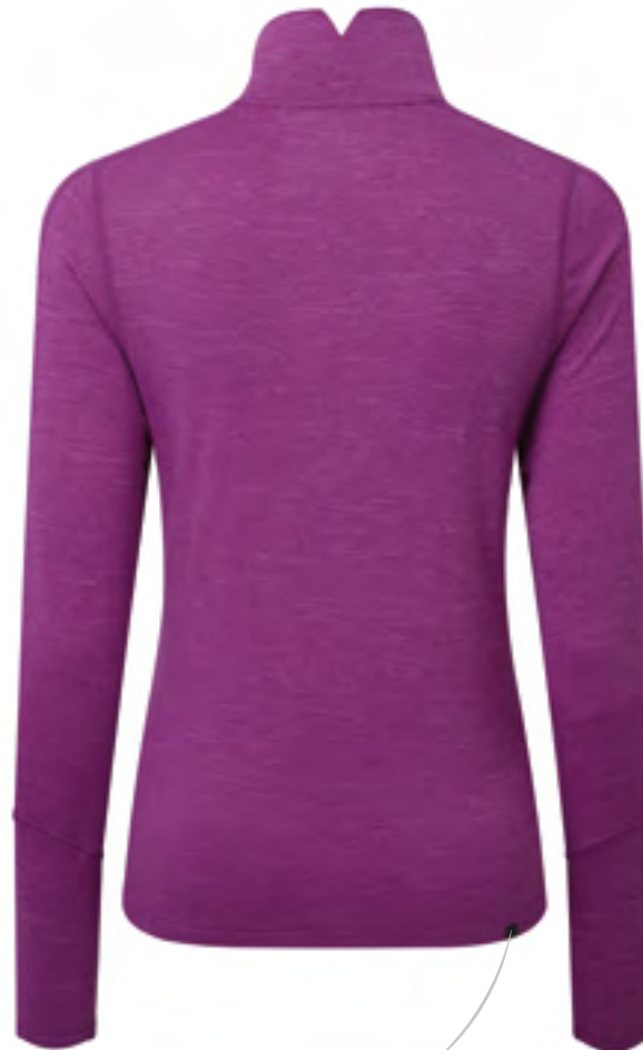
RH-00623 Thistle Marl/Aquamint