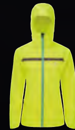
R629 Fluo Yellow/Reflect