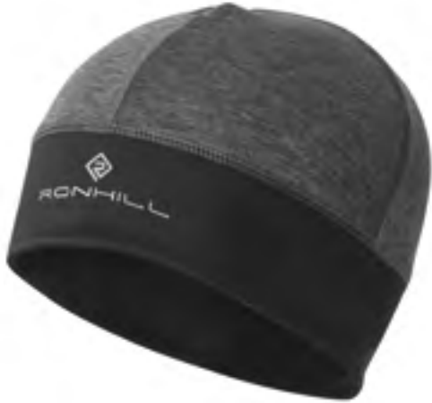
RH-00202 Grey Marl/Black