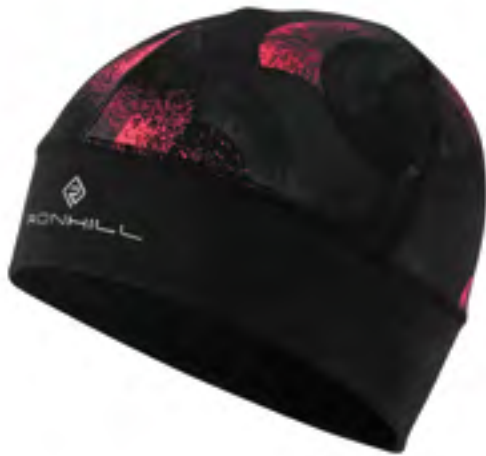
RH-00609 Hot Pink Wave