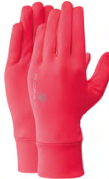
RH-00302 Hot Pink