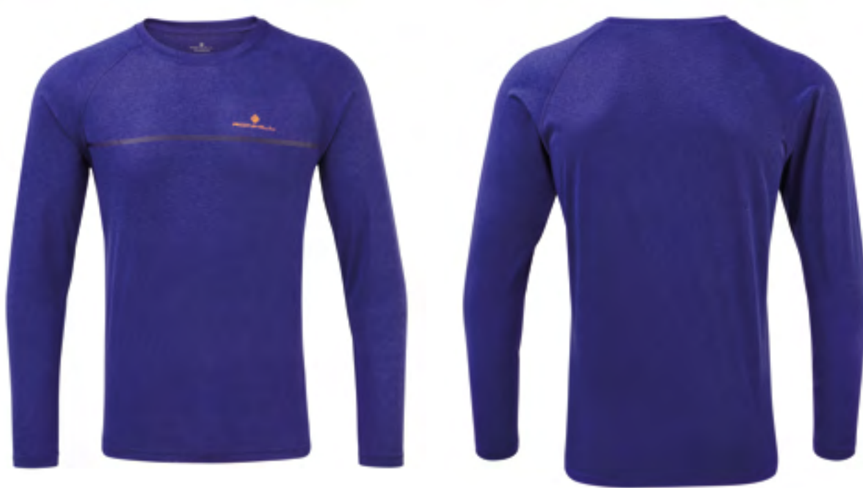
RH-00595 Deep Sea Marl