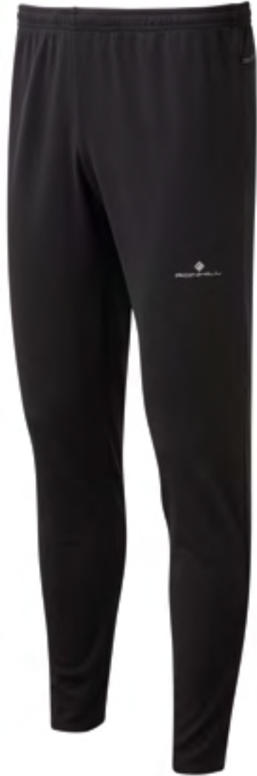
RO09 All Black