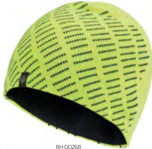
RH-00268 Fluo Yellow/Charcoal

Fibre content: 96% Acrylic, 3% Nylon, 1% Elastane