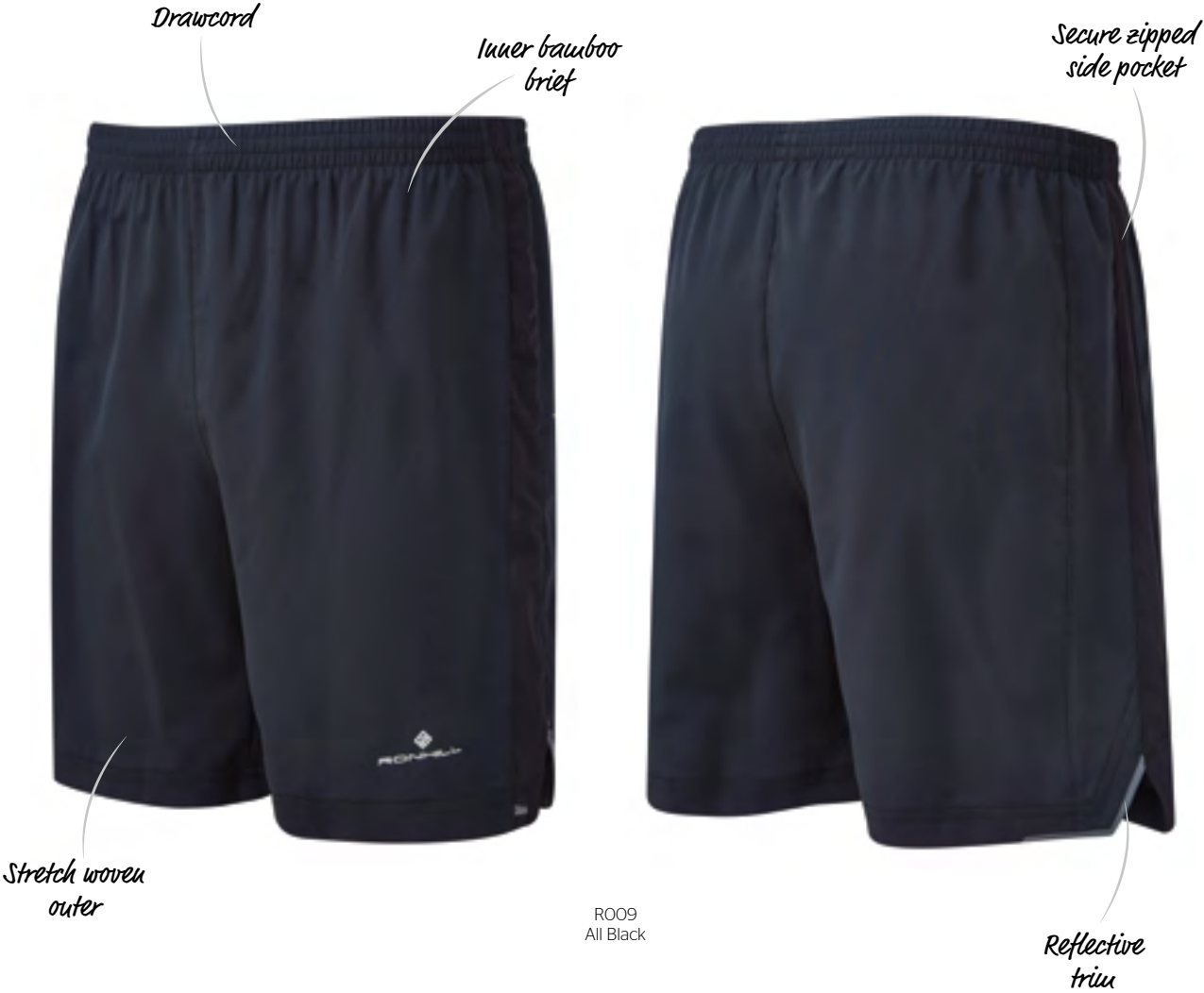
R009 All Black