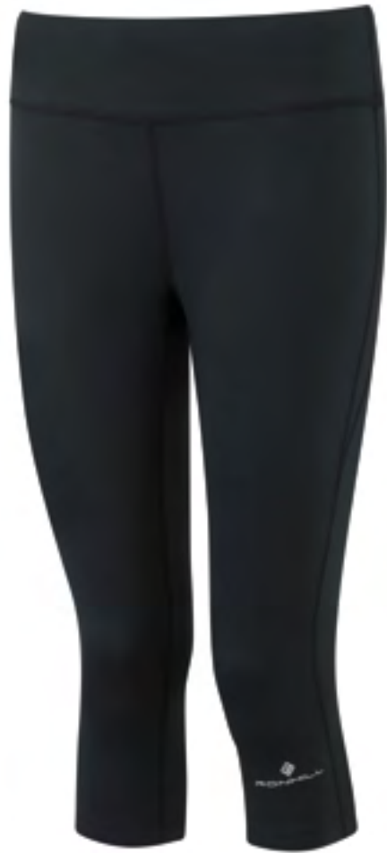
RO09 All Black