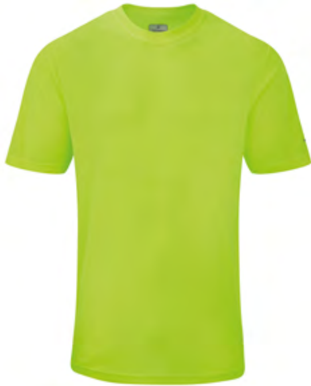
R010 Fluo Yellow