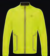
R629 Fluo Yellow/Reflect