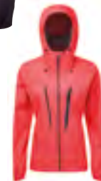
RH-00307 Hot Pink/Charcoal