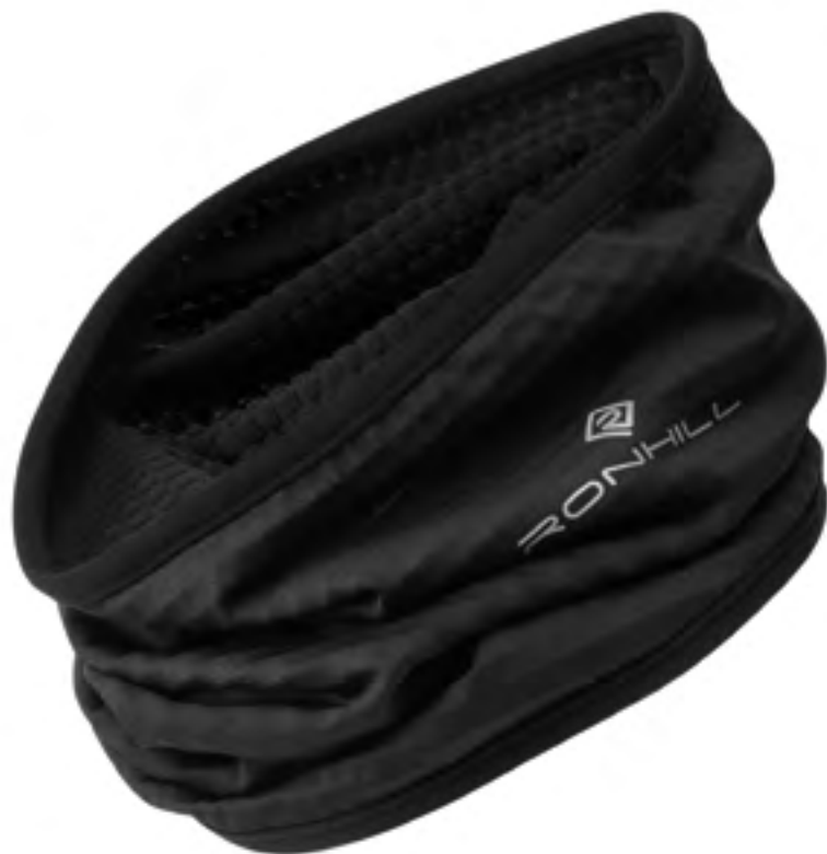
RO09 All Black