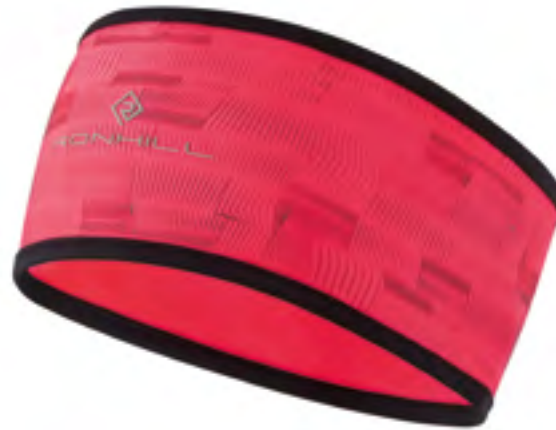
RH-00608 Hot Pink/Reflect