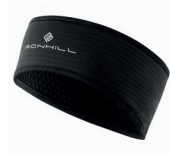
RO09 All Black