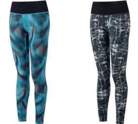
RH-00658 Sky Blue Soleus RH-00656 Mono Rock