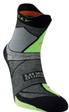
HI-00040 Black/Grey/Lime Green