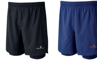
RH-00217 Black/Charcoal Marl