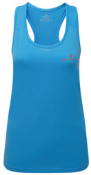
RH-00647 Sky Blue Marl/Cherry