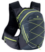
RH-00264 Charcoal/Fluo Yellow