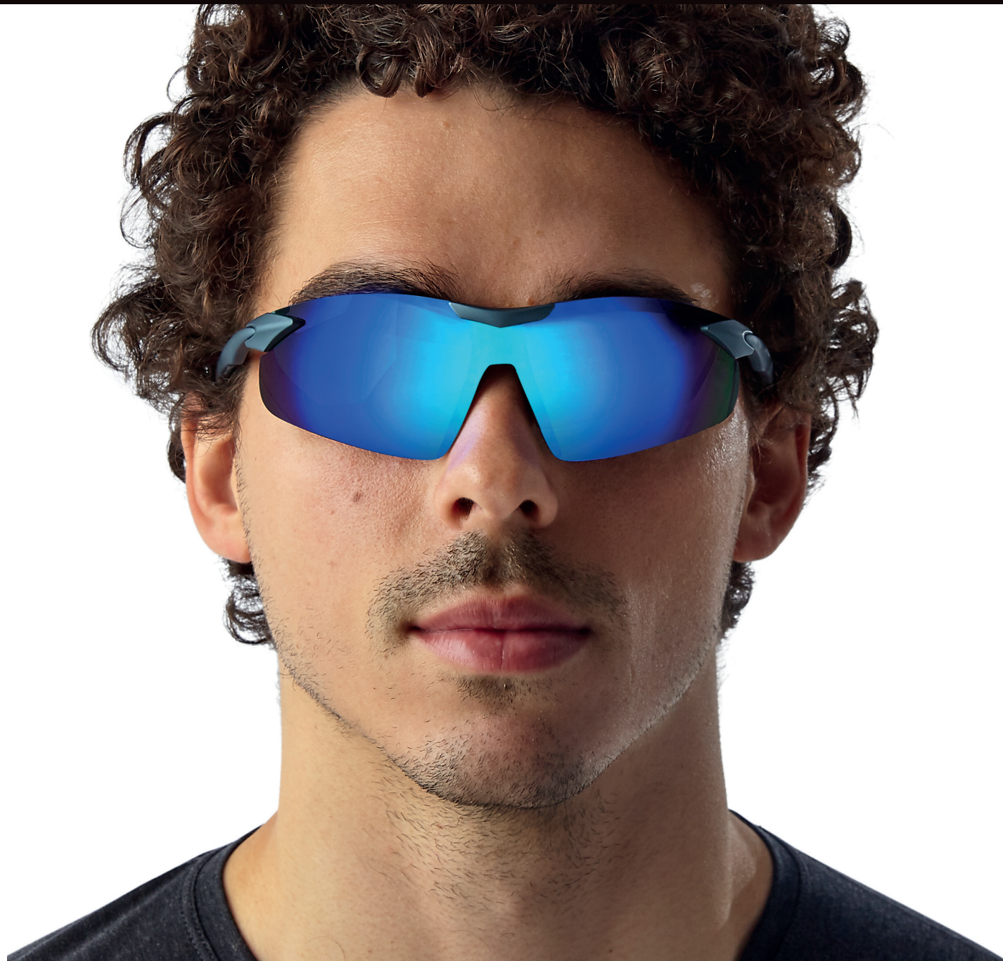
RH-00668 All Grey