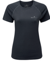
RH-00214 Charcoal Marl