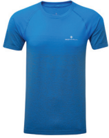
RH-00637 Electric Blue/Grey Marl