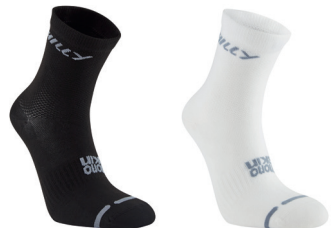
H021 Black/Grey H010 White/Grey