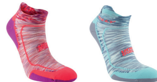
HI-00088 Hot Coral/Grapejuice HI-00077 Peacock/Nickel