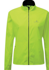
R010 Fluo Yellow