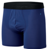
RH-00642 Midnight Blue/ Electric Blue