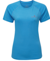
RH-00647 Sky Blue Marl/Cherry