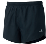
RO09 All Black