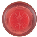
R829 Glow Red