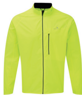
RO10 Fluo Yellow