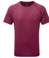
RH-00644 Mulberry Marl