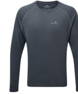
RH-00214 Charcoal Marl