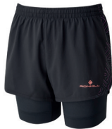
RH-00081 Black/Hot Coral