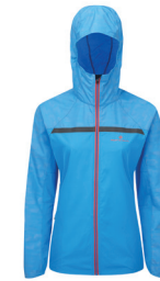
RH-00648 Sky Blue/Cherryade