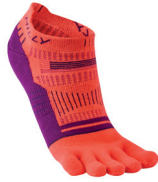
HI-00085 Hot Coral/Grapejuice/ Charcoal