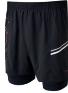
RH-00630 Black/Mulberry/ Bright White