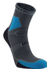
HI-00074 Charcoal/Electric Blue