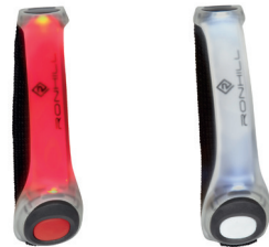
R829 Glow Red