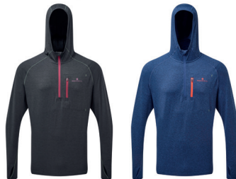
RH-00632 Charcoal Marl/ Mulberry