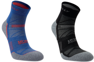
HI-00068 Denim/Grey Marl