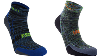
HI-00064 Cobalt/Charcoal HI-00087 Chameleon/Black