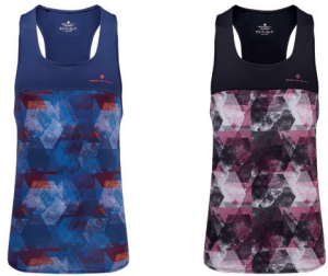
RH-00643 Midnight Blue/Flame RH-00629 Black/Mulberry