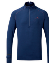
RH-00643 Midnight Blue/Flame

RH-003369 NEW COLOURS Men's Stride Matrix 1/2 Zip Tee