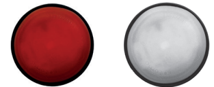
R829 Glow Red