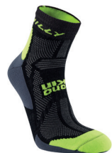
H022 Black/Fluo Yellow