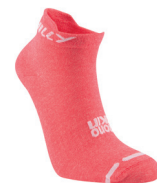
HI-00078 Hot Pink Marl