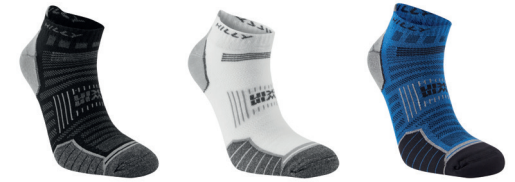
HI-00067 Black/Grey Marl HI-00070 White/Grey Marl HI-00094 Azurite/Grey Marl