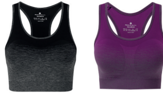
RH-00167 Black/Grey Marl RH-00627 Grape Juice/Grey Marl