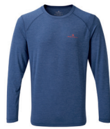
RH-00385 Midnight Blue Marl