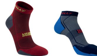
HI-00082 Burgundy/Fluo Yellow HI-00089 Midnight/Electric Blue