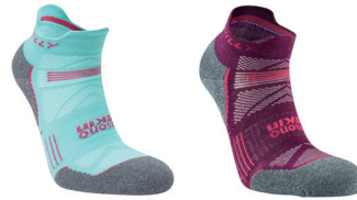
HI-00066 Aquamarine/Grey Marl