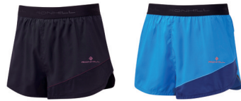
RH-00629 Black/Mulberry RH-00650 Electric Blue/ Midnight Blue