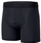
RO09 All Black