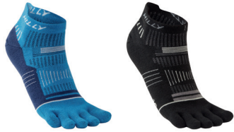
HI-00084 Electric Blue/ Midnight Blue/White HI-00086 Black/Grey/Light Grey