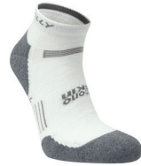
HI-00070 White/Grey Marl