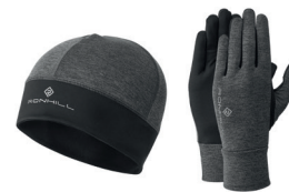
RH-00202 Grey Marl/Black