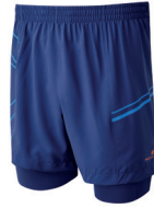
RH-00642 Midnight Blue/ Electric Blue