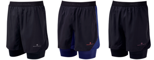
R009 All Black RH-00162 Black/Midnight Blue RH-00629 Black/Mulberry

RH-003823 Men's Stride Cargo Racer Short