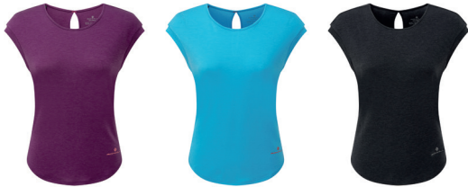
RH-00298 Grape Juice Marl RH-00628 Sky Blue Marl RH-00308 Black Marl