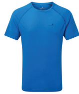
RH-00382 Electric Blue Marl