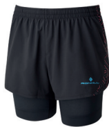
RH-00142 Black/Sky Blue