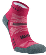
HI-00069 Magenta/Grey Marl