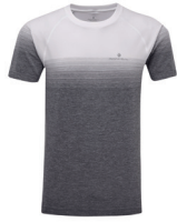
RH-00646 Bright White/Grey Marl