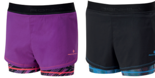
RH-00639 Grape Juice/Hot Coral RH-00142 Black/Sky Blue