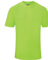
RO10 Fluo Yellow