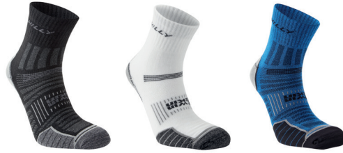
HI-00067 Black/Grey Marl HI-00070 White/Grey Marl HI-00094 Azurite/Grey Marl