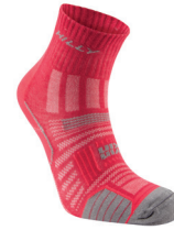
HI-00069 Magenta/Grey Marl