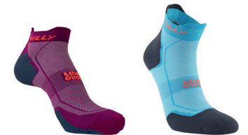
HI-00090 Grapejuice/Charcoal HI-00081 Peacock/Hot Pink