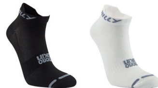
H021 Black/Grey H010 White/Grey