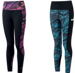
RH-00654 Black/Grape Juice Blast RH-00657 Sky Blue Blast