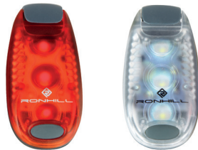
R829 Glow Red