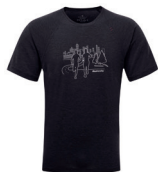
RH-00638 Black Marl/Bright White