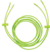
R010 Fluo Yellow