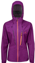
RH-00639 Grape Juice/ Hot Coral