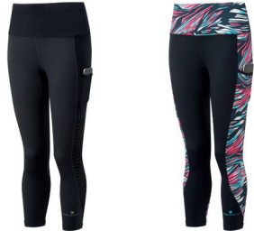
RH-00405 Charcoal Marl/Black RH-00655 Black/Cherryade Blast