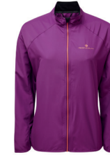
RH-00639 Grape Juice/Hot Coral