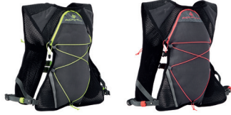
RH-00264 Charcoal/Fluo Yellow