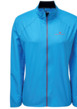
RH-00648 Sky Blue/Cherryade