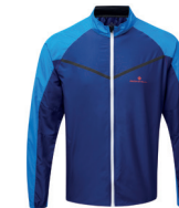
RH-00642 Midnight Blue/ Electric Blue

RH-004275 NEW COLOURS Men's Stride Windspeed Jacket