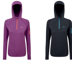
RH-00639 Grape Juice/Hot Coral RH-00634 Charcoal Marl/Sky Blue