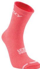
HI-00078 Hot Pink Marl