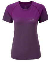
RH-00627 Grape Juice/ Grey Marl