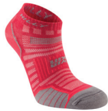
HI-00069 Magenta/Grey Marl