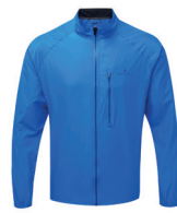
RH-00071 Electric Blue