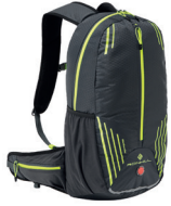
RH-00264 Charcoal/Fluo Yellow