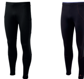
R009 All Black RH-00219 Black/Flame

RH-004278 NEW COLOURS Men's Stride Stretch Tight