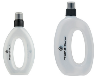
R350 Clear/Black - 270ml