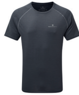
RH-00214 Charcoal Marl