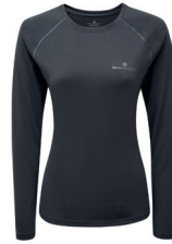
RH-00214 Charcoal Marl