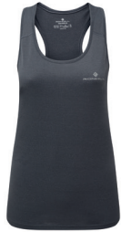
RH-00214 Charcoal Marl