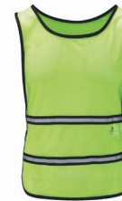
RO10 Fluo Yellow