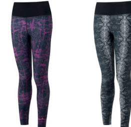
RH-00652 Grape Juice Rock RH-00653 Mono Tribal