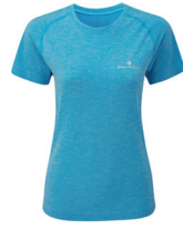
RH-00628 Sky Blue Marl