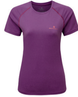
RH-00651 Grape Juice Marl/ Hot Coral