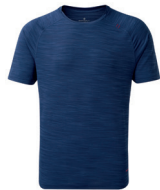
RH-00643 Midnight Blue/Flame