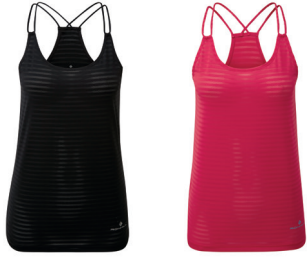
RH-009 All Black RH-00635 Cherryade/Sky Blue