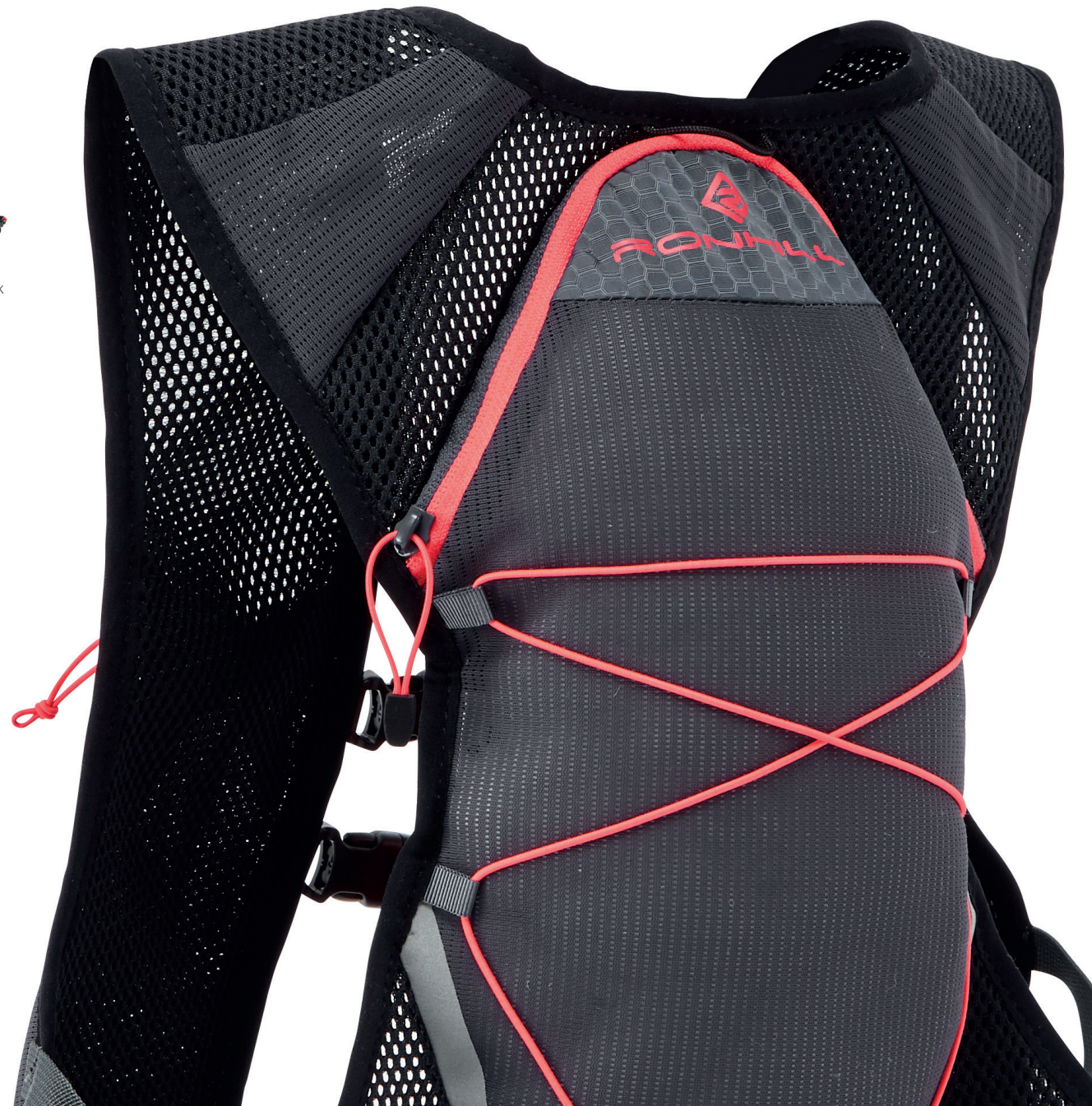
RH-00292 Charcoal/Hot Pink