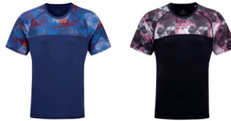
RH-00643 Midnight Blue/Flame RH-00629 Black/Mulberry