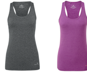
RH-00102 Grey Marl RH-00298 Grape Juice Marl