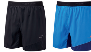
R009 All Black RH-00650 Electric Blue/ Midnight Blue