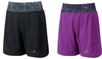
RH-00659 Black/Mono Tribal RH-00639 Grape Juice/Hot Coral