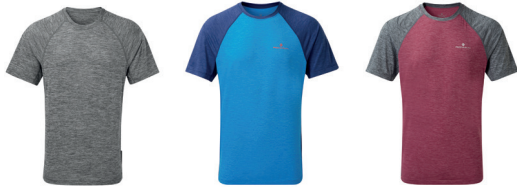
RH-00102 Grey Marl