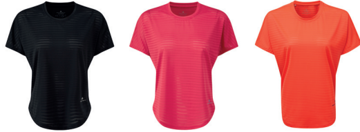
RH-009 All Black RH-00635 Cherryade/Sky Blue RH-00641 Hot Coral/Grape Juice