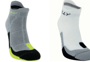
HI-00055 Grey/Fluo Yellow/ Black