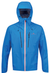
RH-00636 Electric Blue/Flame