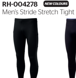
R009 All Black