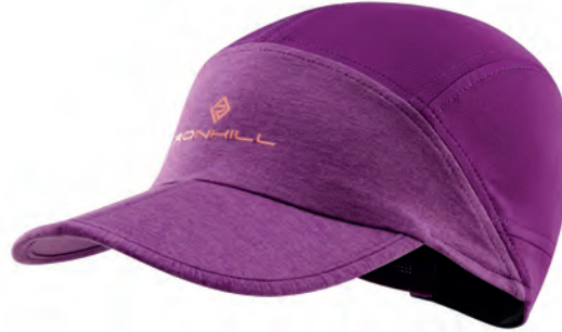
RH-00639 Grape Juice/Hot Coral