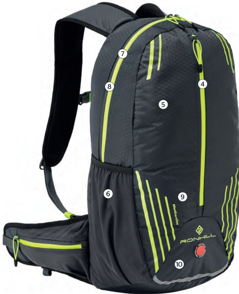
RH-00264 Charcoal/Fluo Yellow