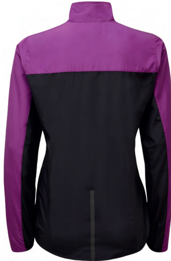
RH-00304 Black/Grape Juice