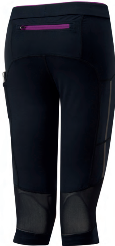
RH-00304 Black/Grape Juice