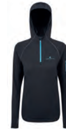
RH-00634 Charcoal Marl/Sky Blue

Fibre content: 88% Polyester, 12% Elastane