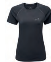
RH-00214 Charcoal Marl