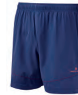
RH-00153 Midnight Blue