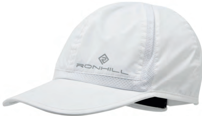
RH-00649 Bright White