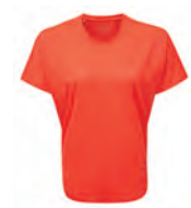
RH-00641 Hot Coral/ Grape Juice