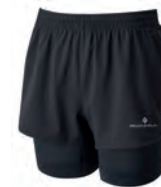
RH-0009 All Black

Fibre content: Main Body: 100% Polyester. Lining: 88% Recycled Polyester, 12% Elastane