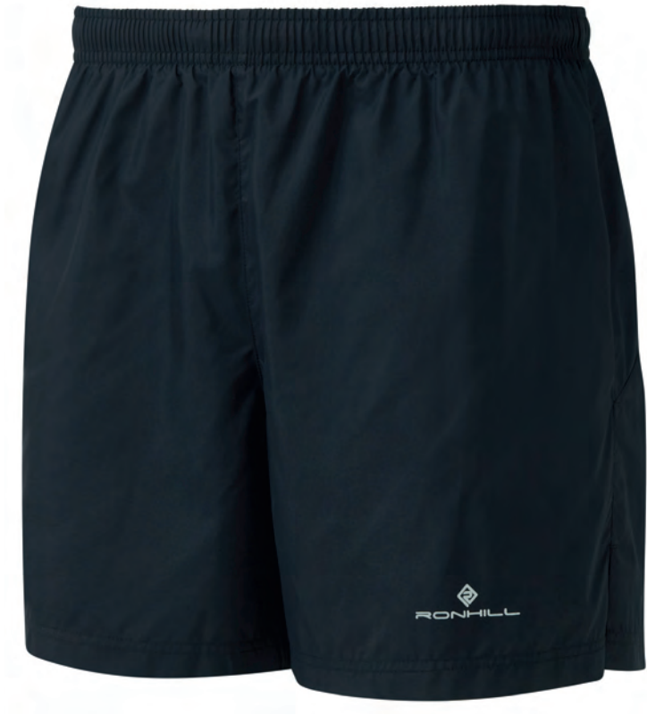
RO09 All Black