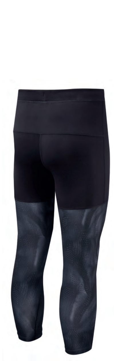
RH-00660 Black/Mono Soleus