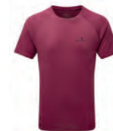
RH-00644 Mulberry Marl