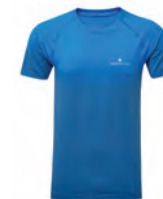
RH-00637 Electric Blue/Grey Marl