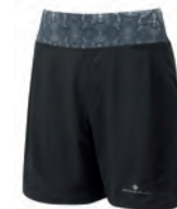
RH-00659 Black/Mono Tribal

Fibre content: Main Body: 100% Polyester. Contrast: 80% Polyamide, 20% Elastane