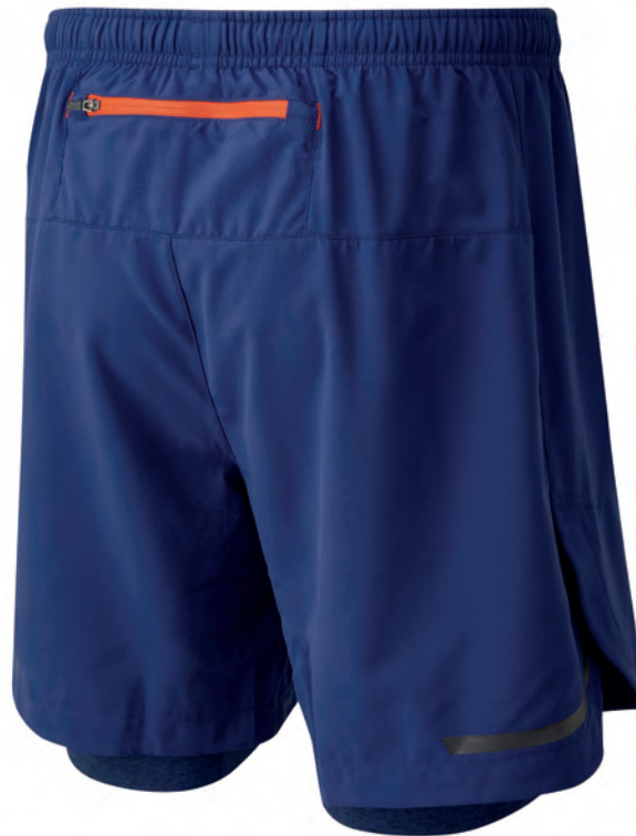
RH-00153 Midnight Blue