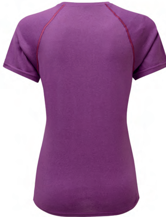
RH-00651 Grape Juice Marl/ Hot Coral