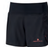
RH-00081 Black/Hot Coral