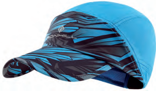
RH-00657 Sky Blue Blast