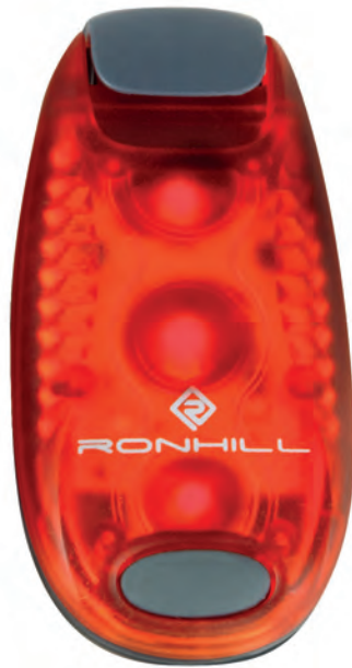
R829 Glow Red