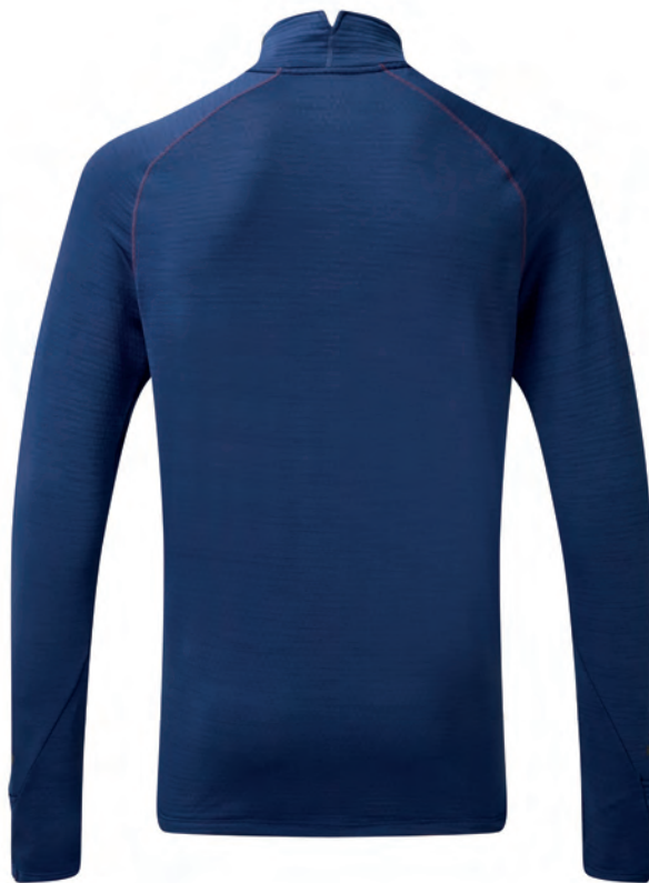
RH-00643 Midnight Blue/Flame