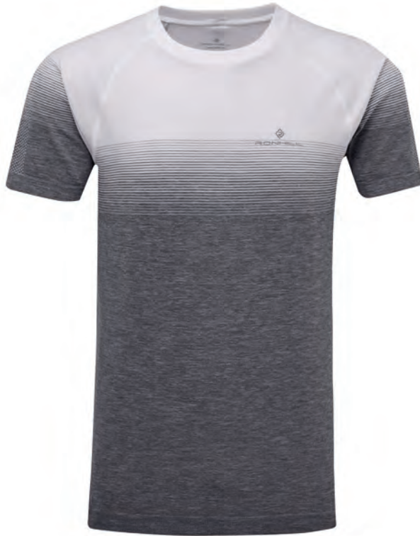
RH-00646 Bright White/Grey Marl

Fibre content: 70% Polyamide, 30% Polyester