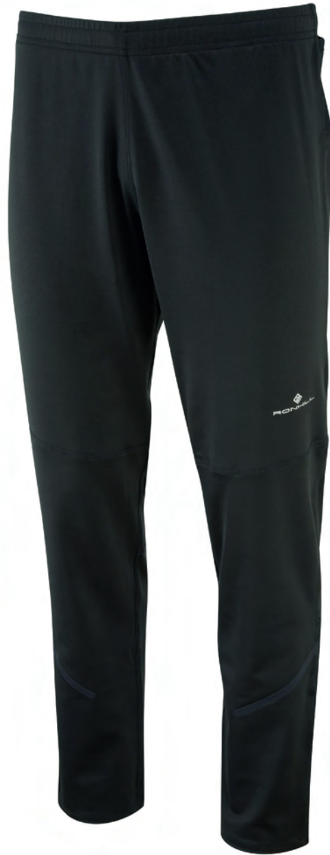
R009 All Black