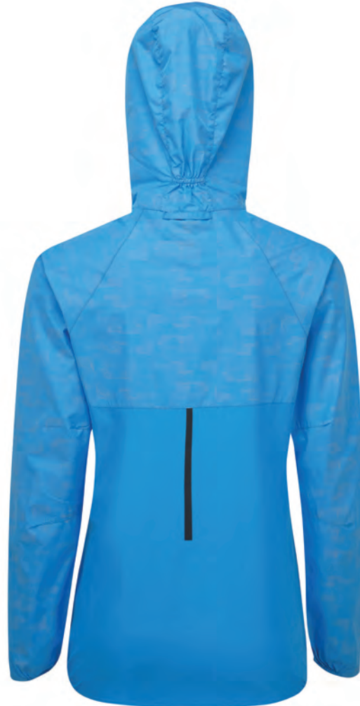
RH-00648 Sky Blue/Cherryade