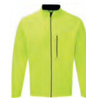
R010 Fluo Yellow