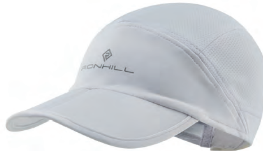
RH-00649 Bright White