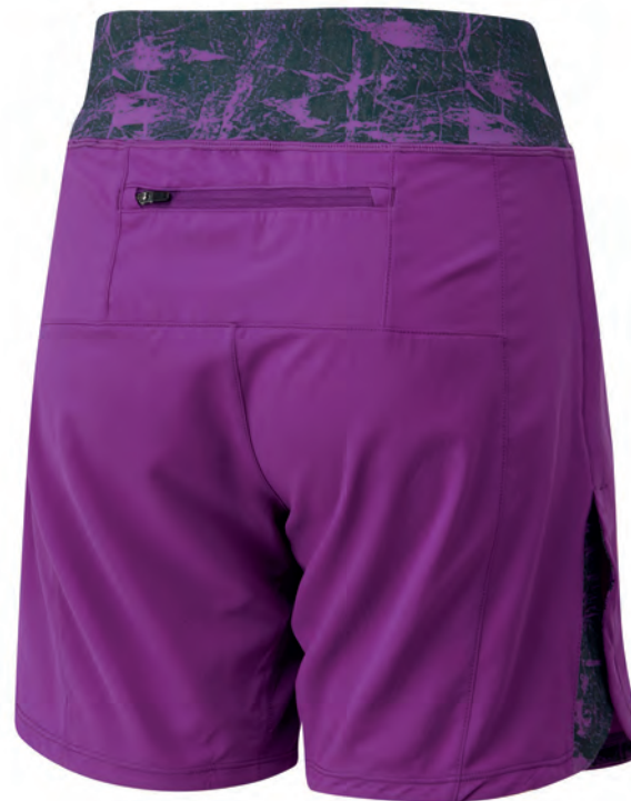
RH-00639 Grape Juice/ Hot Coral