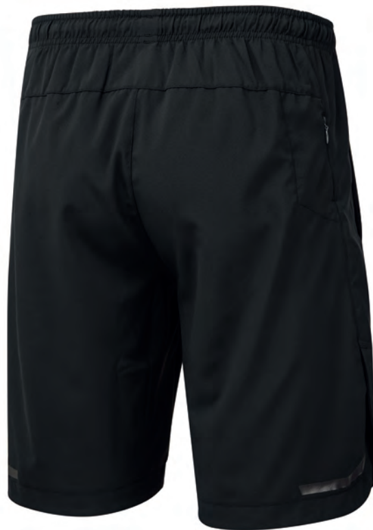
R009 All Black