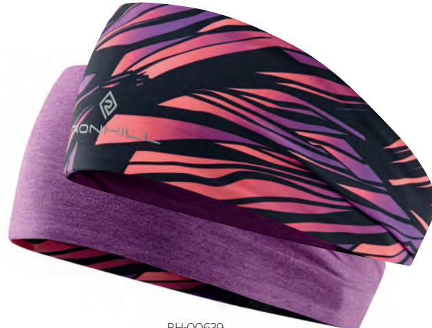
RH-00639 Grape Juice/Hot Coral