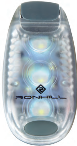
RH-00129 Glow White