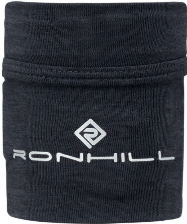
R009 All Black