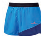
RH-00650 Electric Blue/ Midnight Blue

Fibre content: Main Body: 100% Recycled Polyester. Lining: 88% Recycled Polyester, 12% Elastane