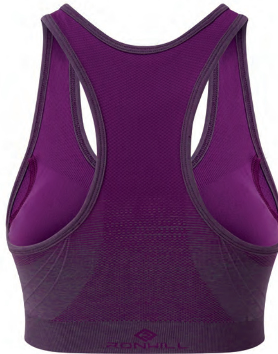
RH-00627 Grape Juice/Grey Marl