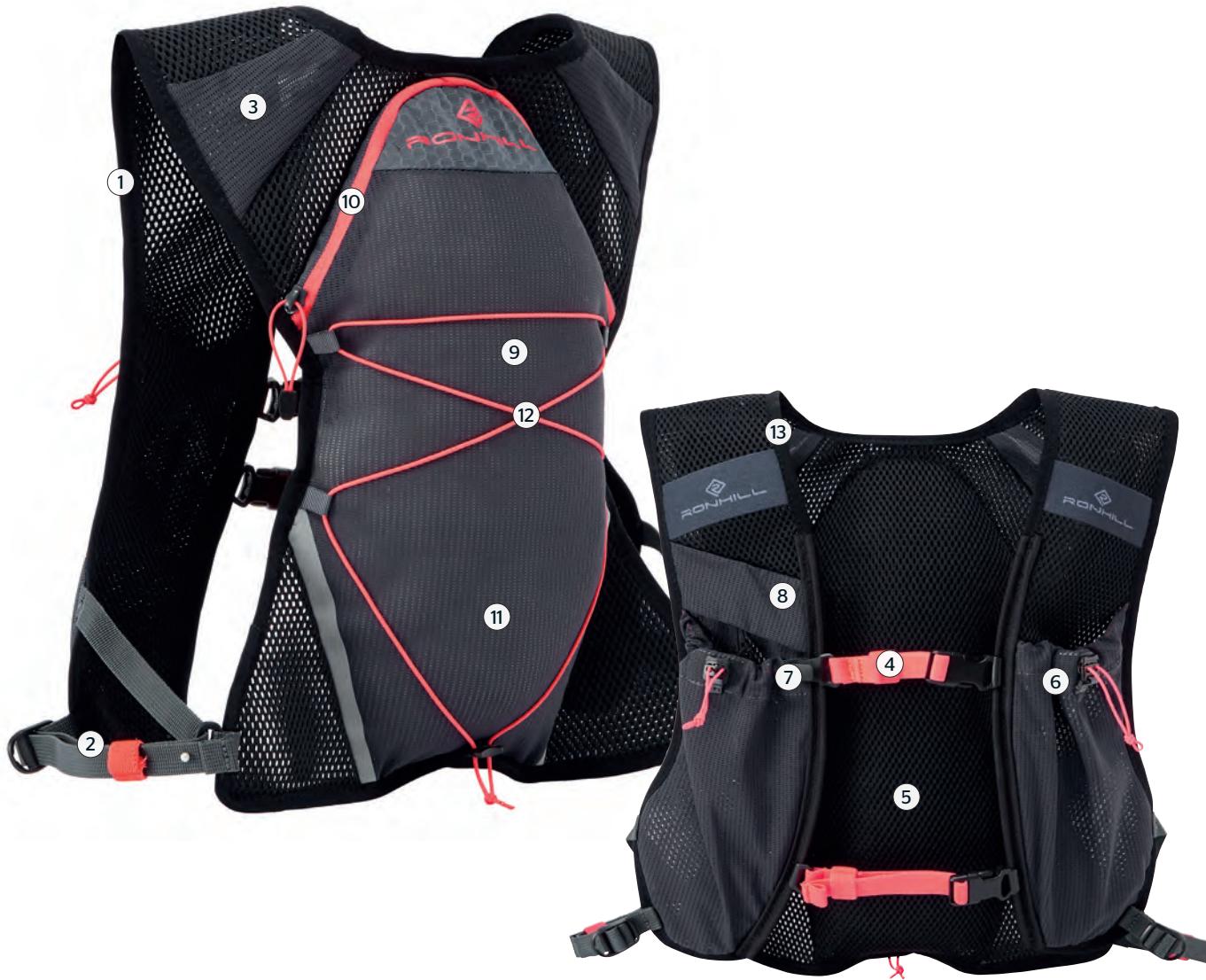
RH-00292 Charcoal/Hot Pink

Fibre content: 45% Polyamide, 55% Polyester