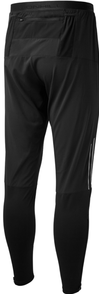
R009 All Black