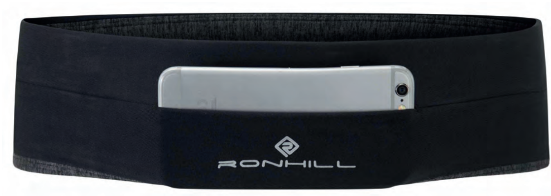
RH-00217 Black/Charcoal Marl

Fibre content: 88% Polyester, 12% Elastane