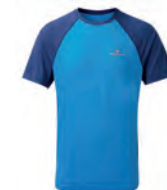
RH-00661 Electric Blue/ Midnight Blue Marl