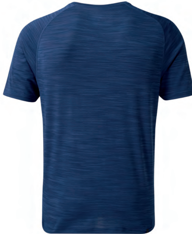
RH-00643 Midnight Blue/Flame