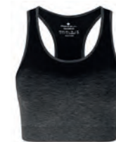
RH-00167 Black/Grey Marl