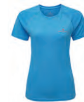
RH-00647 Sky Blue Marl/Cherry