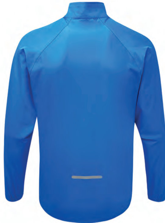
RH-00071 Electric Blue