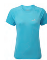
RH-00628 Sky Blue Marl