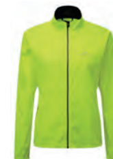
R010 Fluo Yellow