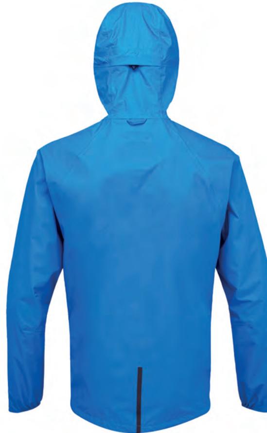
RH-00636 Electric Blue/Flame