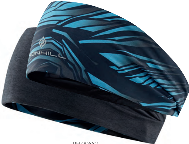
RH-00662 Sky Blue/Charcoal