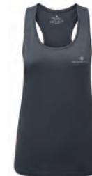
RH-00214 Charcoal Marl