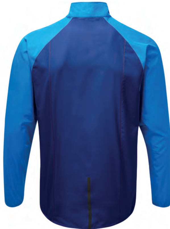
RH-00642 Midnight Blue/ Electric Blue