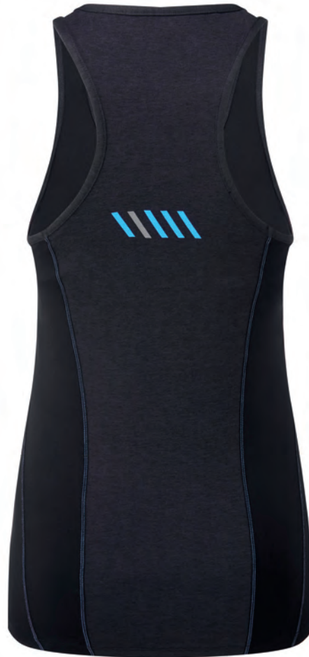
RH-00142 Black/Sky Blue