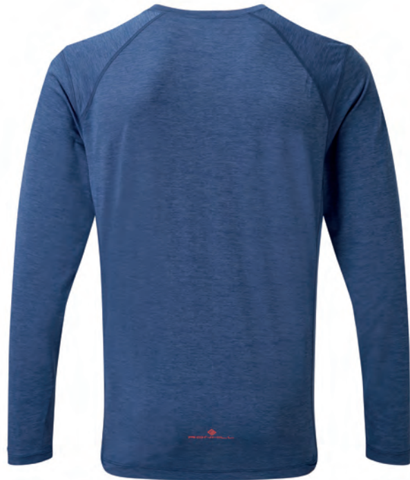
RH-00385 Midnight Blue Marl