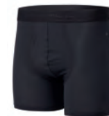
RO09 All Black