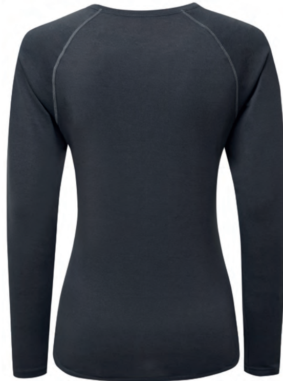
RH-00214 Charcoal Marl