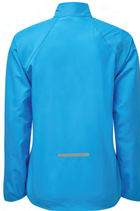
RH-00648 Sky Blue/Cherryade