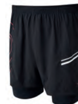
RH-00630 Black/Mulberry/ Bright White

Main Body: 100% Polyester. Lining: 88% Recycled Polyester, 12% Elastane