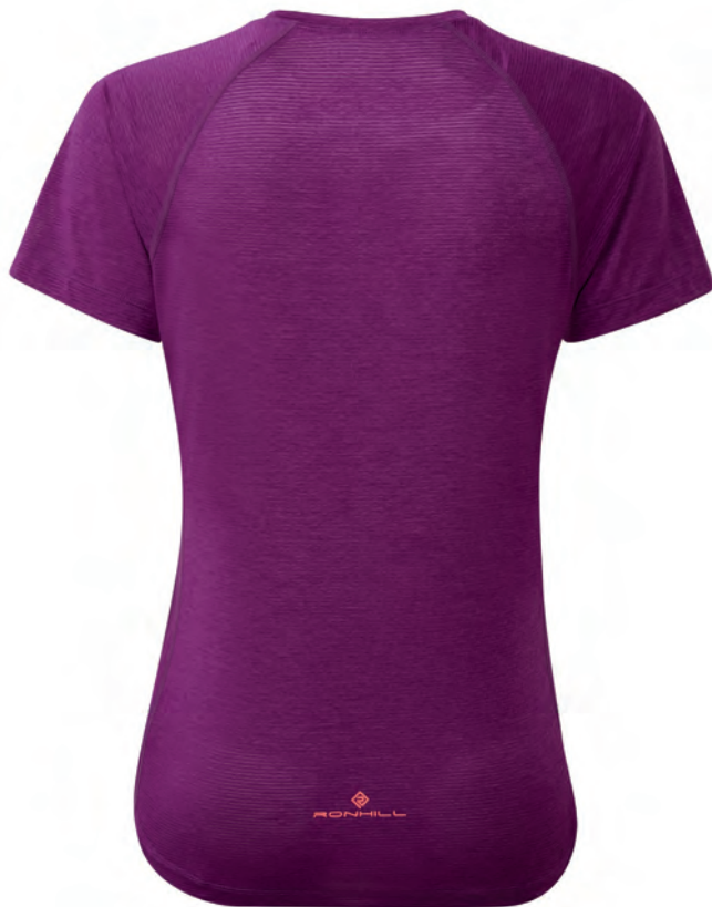
RH00298 Grape Juice Marl