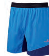
RH-00650 Electric Blue/ Midnight Blue

Fibre content: Main Body: 100% Recycled Polyester. Lining: 88% Recycled Polyester, 12% Elastane