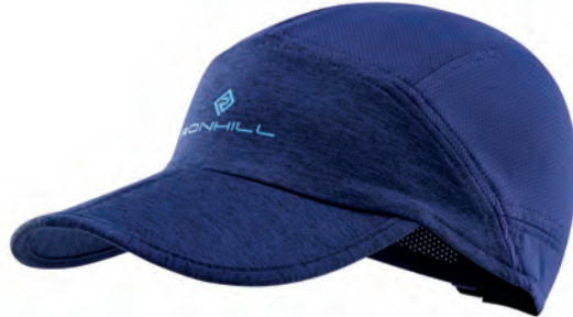
RH-00642 Midnight Blue/ Electric Blue