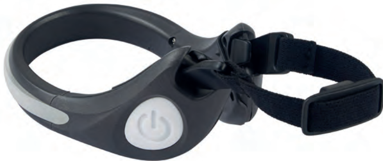
RH-00129 Glow White