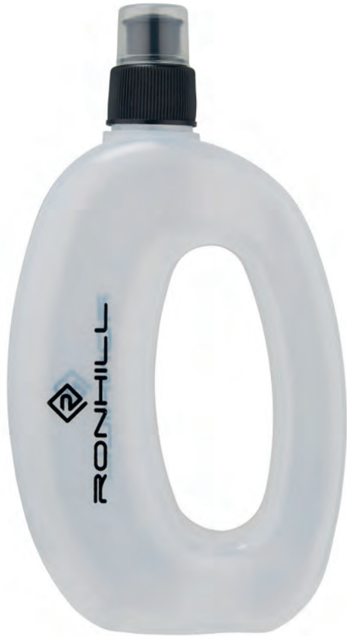
R878 Clear/Black - 500ml