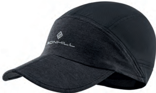
RH-00405 Charcoal Marl/Black