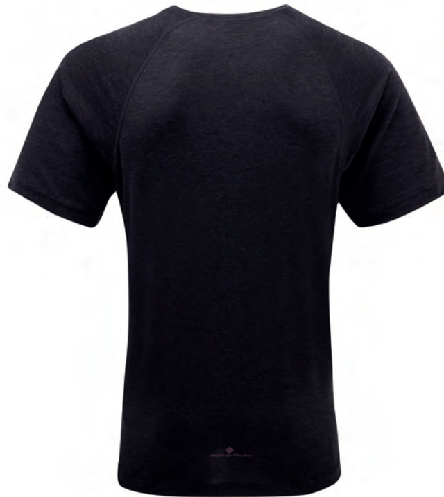
RH-00638 Black Marl/Bright White