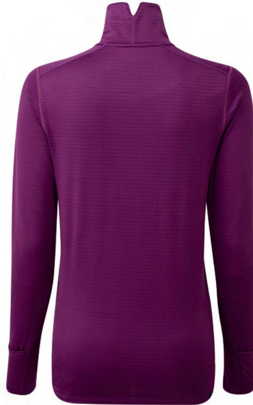
RH-00639 Grape Juice/ Hot Coral