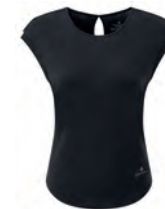
RH-00308 Black Marl

Fibre content: 86% Recycled Polyester, 9% Tencel, 5% Elastane