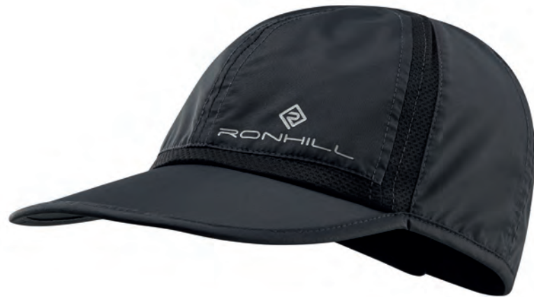
R009 All Black