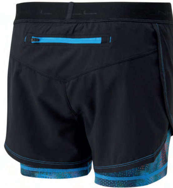
RH-00142 Black/Sky Blue