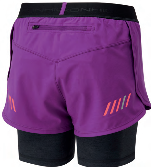
RH-00640 Grape/Charcoal Marl