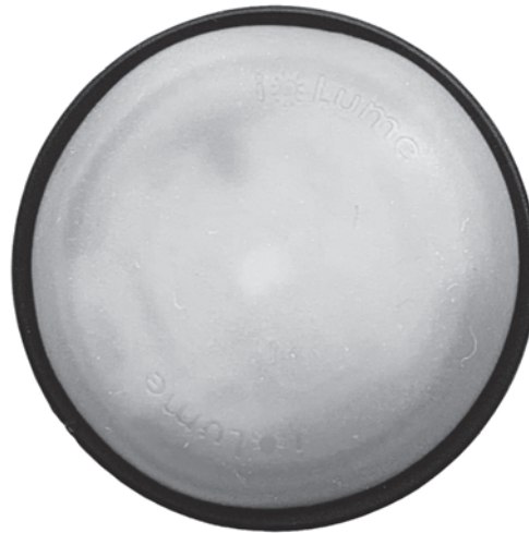
RH-00129 Glow White