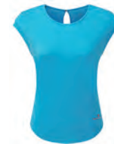
RH-00628 Sky Blue Marl