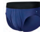
RH-00642 Midnight Blue/ Electric Blue