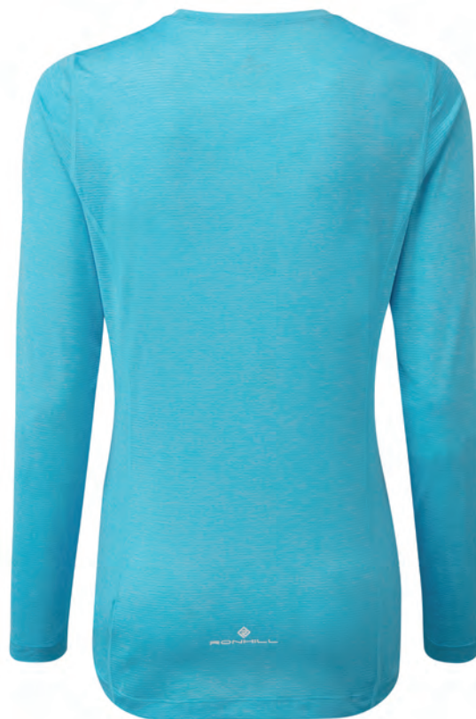
RH-00628 Sky Blue Marl