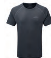
RH-00214 Charcoal Marl