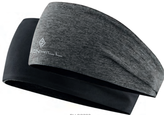
RH-00202 Grey Marl/Black