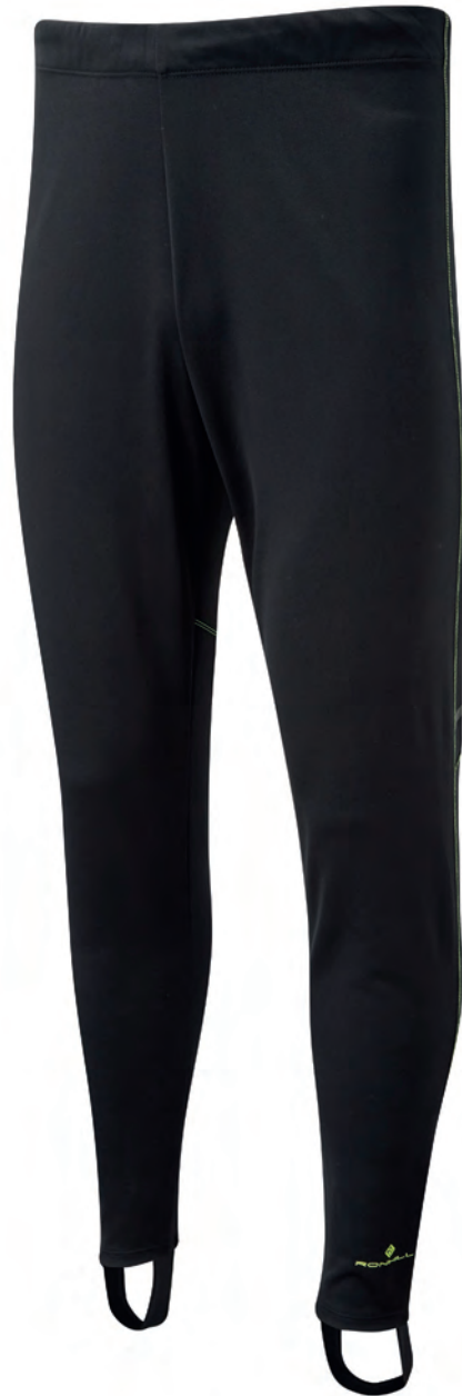
R848 Black/Fluo Yellow