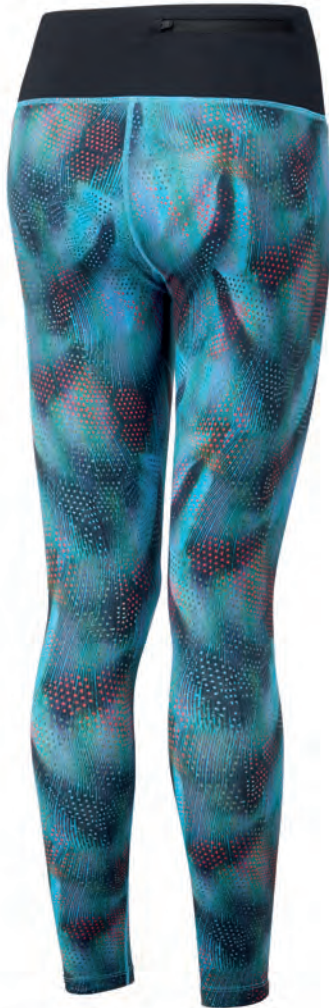
RH-00658 Sky Blue Soleus