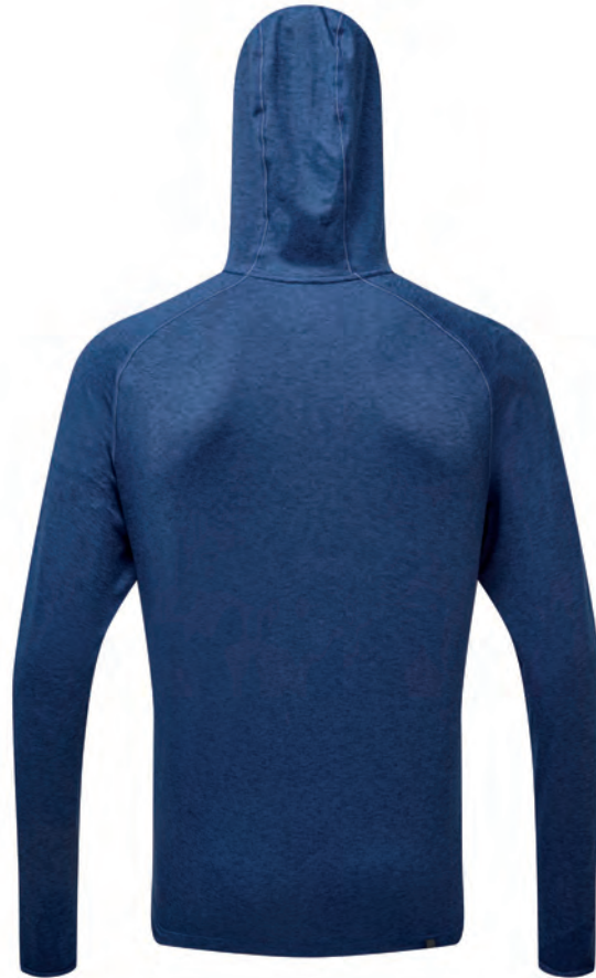
RH-00643 Midnight Blue/Flame