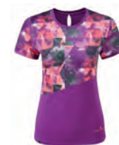
RH-00639 Grape Juice/ Hot Coral