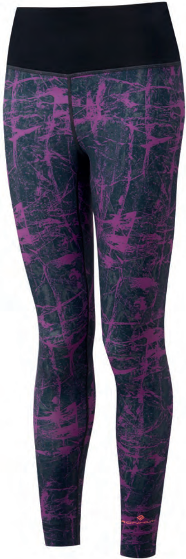
RH-00652 Grape Juice Rock