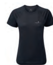
RH-00214 Charcoal Marl

Fibre content: 95% Polyester, 5% Elastane