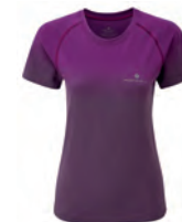
RH-00627 Grape Juice/ Grey Marl