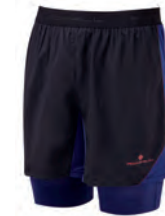
RH-00162 Black/Midnight Blue

Fibre content: Main Body: 100% Recycled Polyester. Lining: 88% Recycled Polyester, 12% Elastane