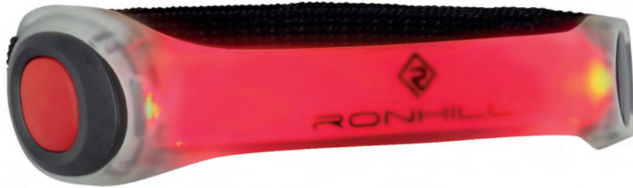
R829 Glow Red