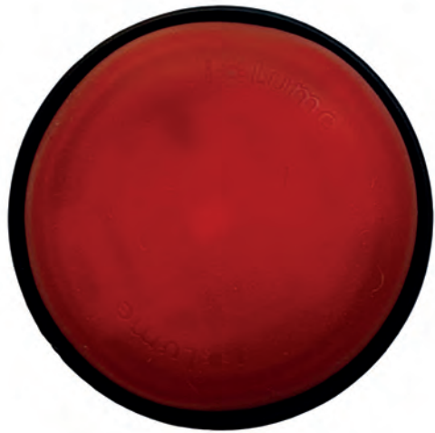
R829 Glow Red