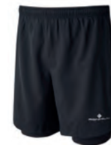
RH-00217 Black/Charcoal Marl

Fibre content: Main: 100% Polyester. Inner: 88% Polyester, 12% Elastane