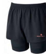
RH-00081 Black/Hot Coral