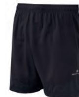
R009 All Black