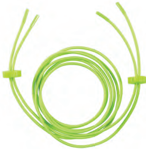
R010 Fluo Yellow