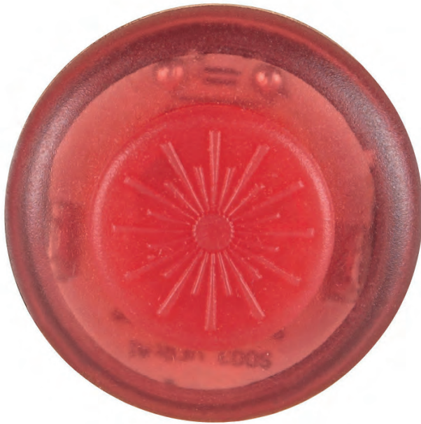
R829 Glow Red