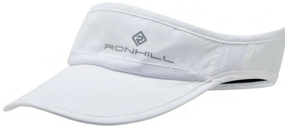
RH-00649 Bright White