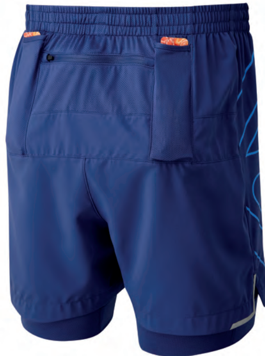
RH-00642 Midnight Blue/ Electric Blue