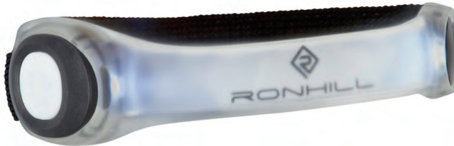
RH-00129 Glow White