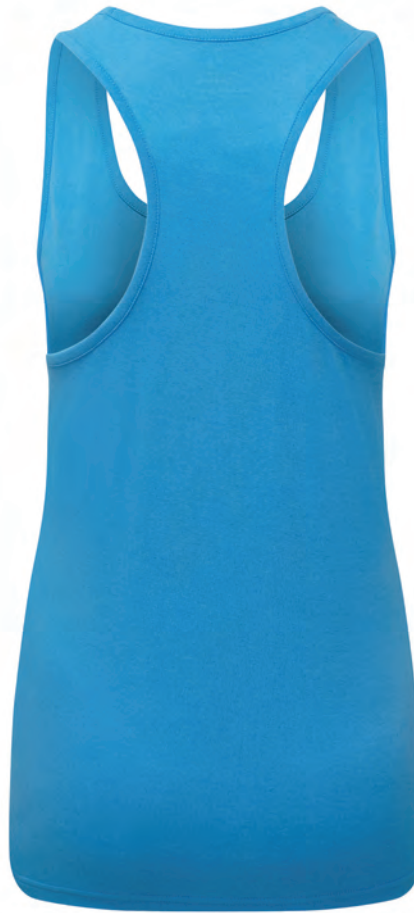
RH-00647 Sky Blue Marl/Cherry