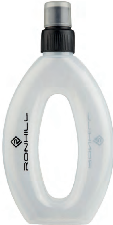
R350 Clear/Black - 270ml