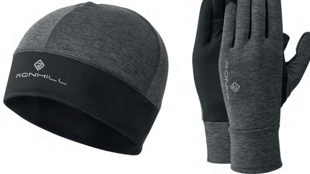
RH-00202 Grey Marl/Black

Fibre content: 88% Polyester, 12% Elastanex