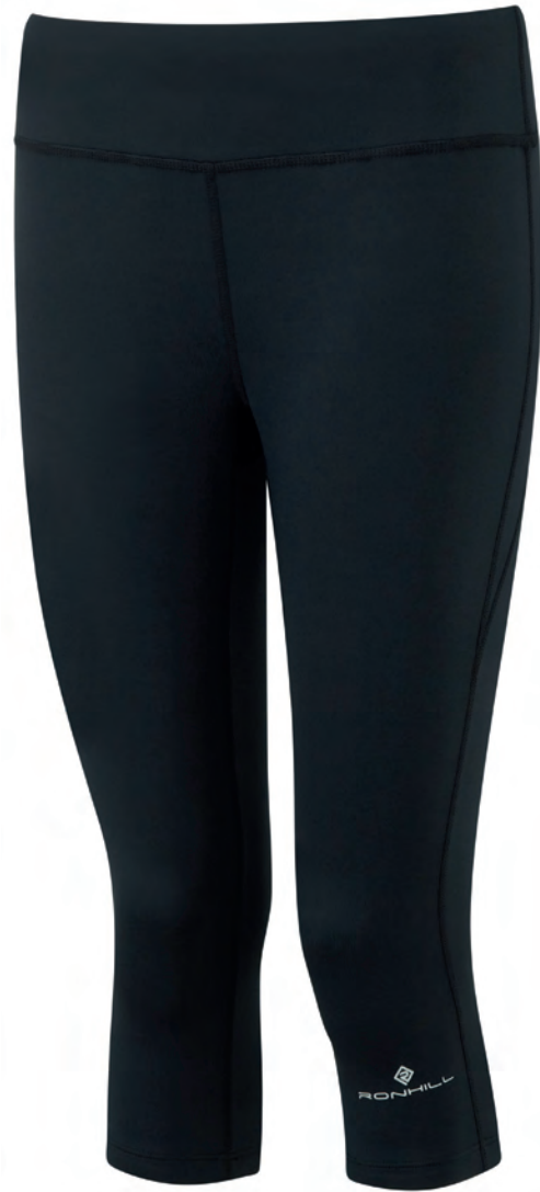
RO09 All Black