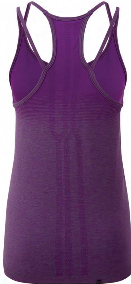
RH-00627 Grape Juice/ Grey Marl