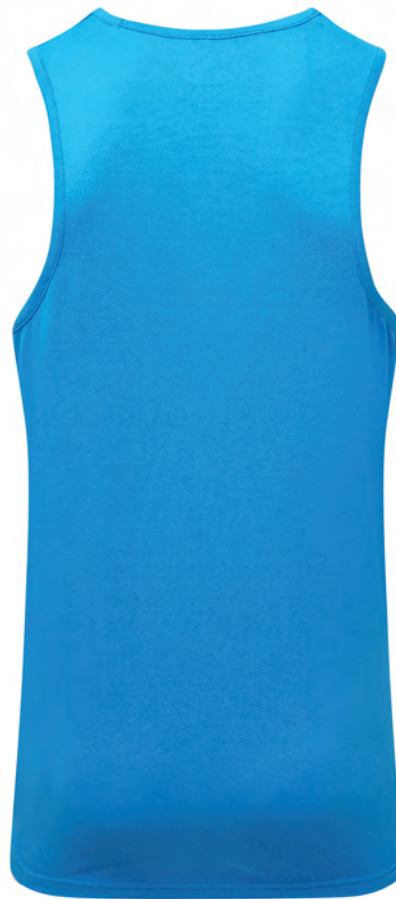
RH-00382 Electric Blue Marl