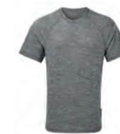
RH-00102 Grey Marl