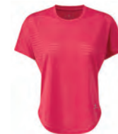
RH-00635 Cherryade/Sky Blue