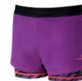
RH-00639 Grape Juice/ Hot Coral