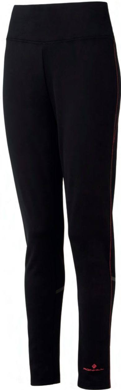
R009 All Black