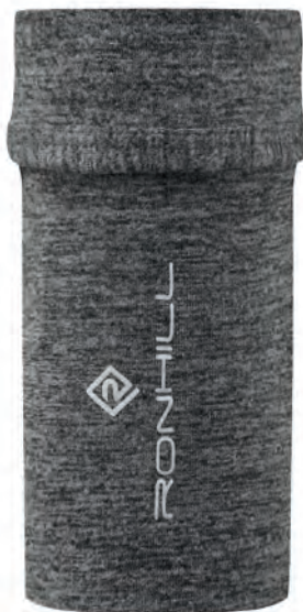
RH-00102 Grey Marl