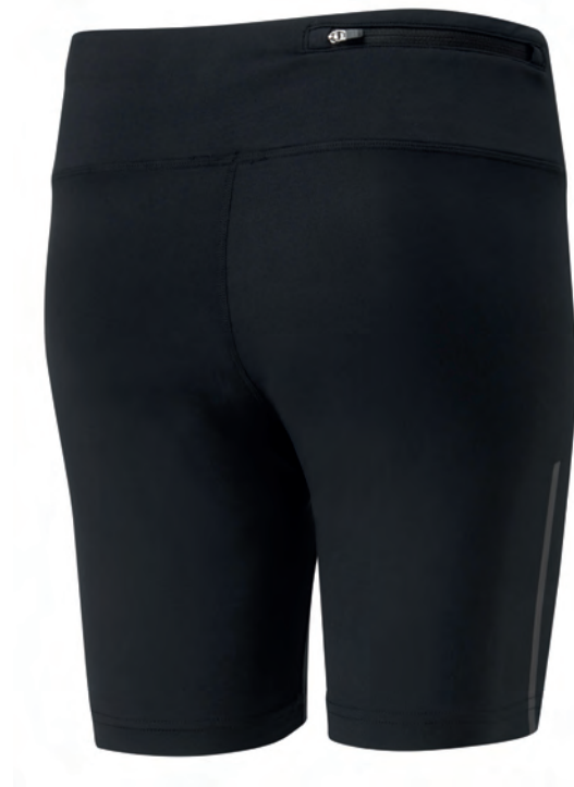
RO09 All Black