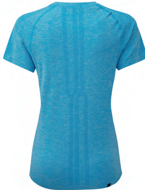
RH-00628 Sky Blue Marl