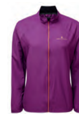
RH-00639 Grape Juice/Hot Coral