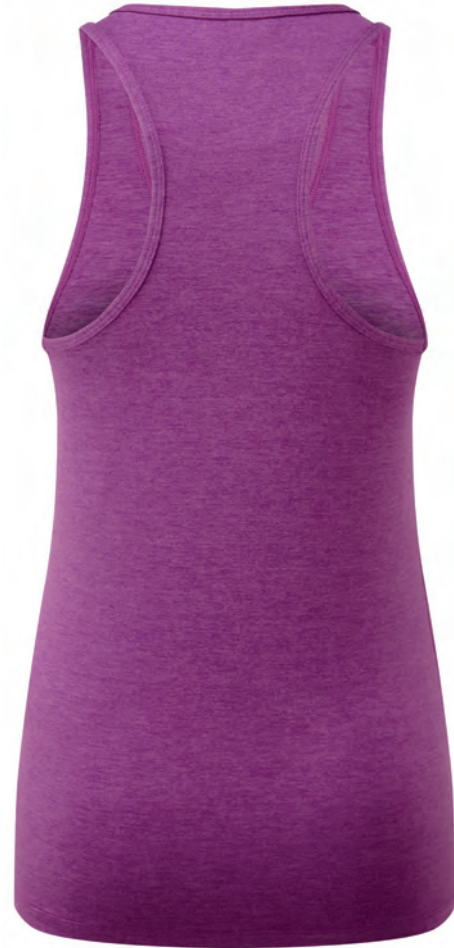
RH-00298 Grape Juice Marl