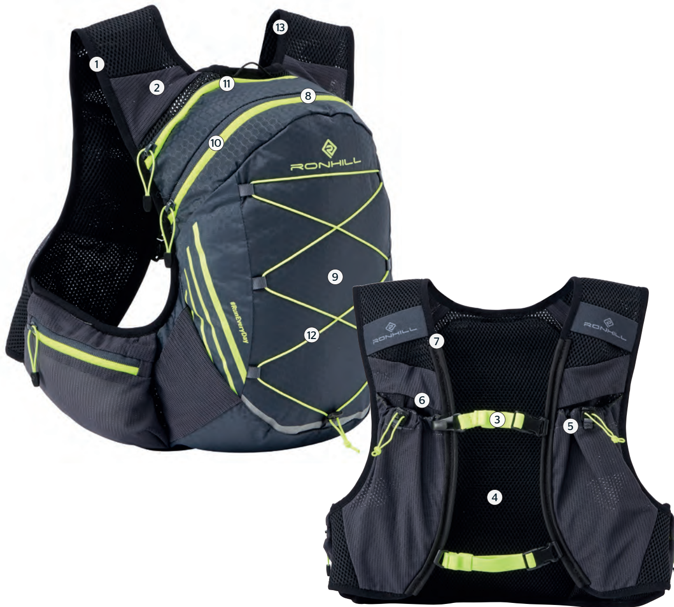
RH-00264 Charcoal/Fluo Yellow