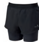
RH-00217 Black/Charcoal Marl

Fibre content: Main Body: 100% Polyester. Lining: 88% Polyester, 12% Elastane