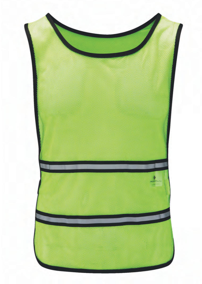
R010 Fluo Yellow