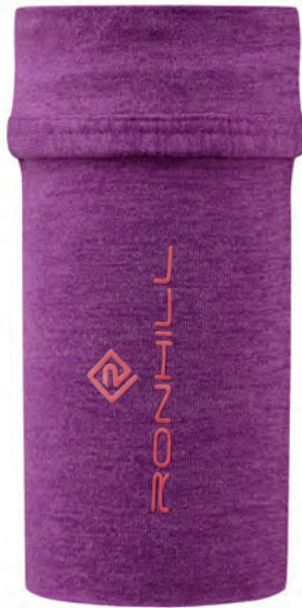
RH-00639 Grape Juice/Hot Coral