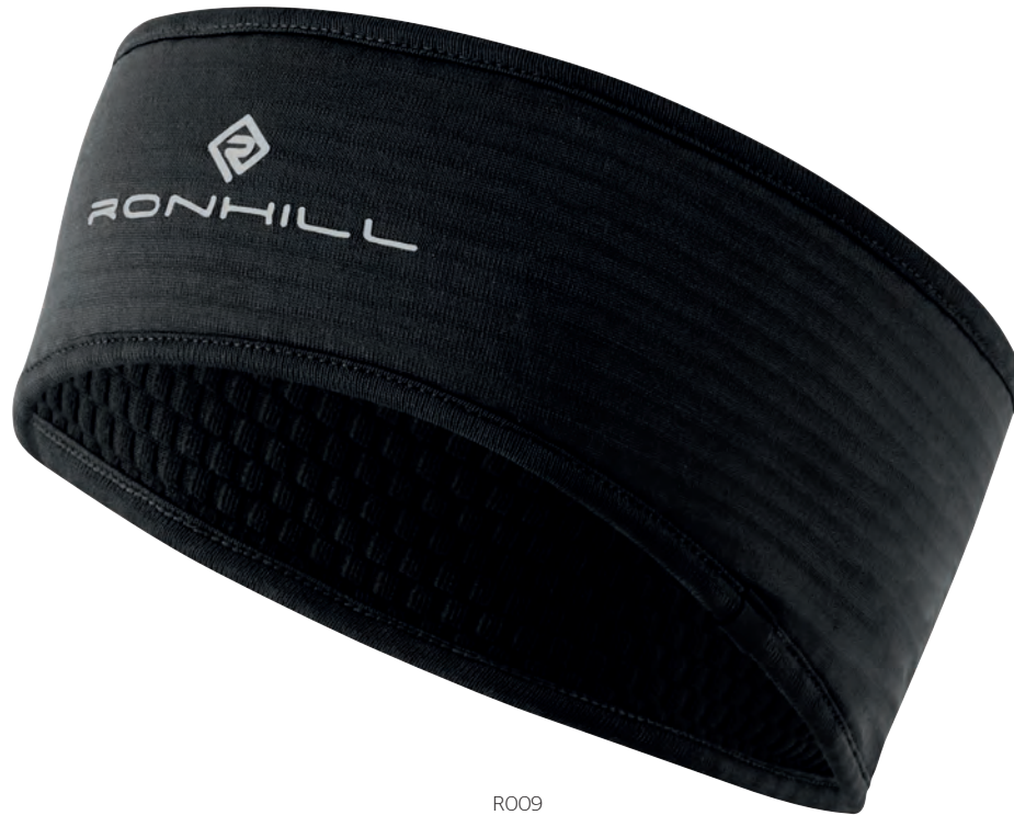
RO09 All Black