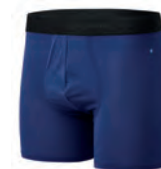
RH-00642 Midnight Blue/ Electric Blue

Fibre content: 88% Recycled Polyester, 12% Elastane