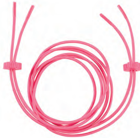
R027 Fluo Pink