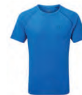
RH-00382 Electric Blue Marl