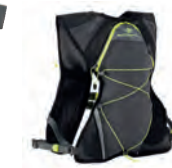
RH-00264 Charcoal/Fluo Yellow