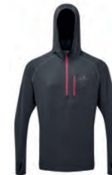
RH-00632 Charcoal Marl/ Mulberry

Fibre content: 88% Polyester, 12% Elastane