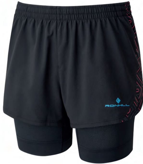
RH-00142 Black/Sky Blue