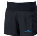
RH-00142 Black/Sky Blue

Fibre content: Main Body: 100% Recycled Polyester. Lining: 88% Recycled Polyester, 12% Elastane