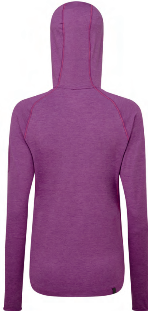
RH-00639 Grape Juice/Hot Coral