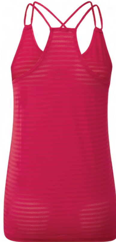
RH-00635 Cherryade/Sky Blue