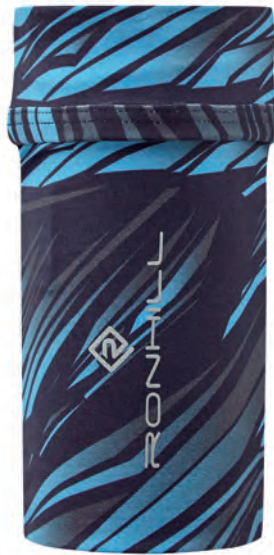
RH-00657 Sky Blue Blast