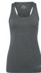
RH-00102 Grey Marl

Fibre content: 88% Polyester, 12% Elastane