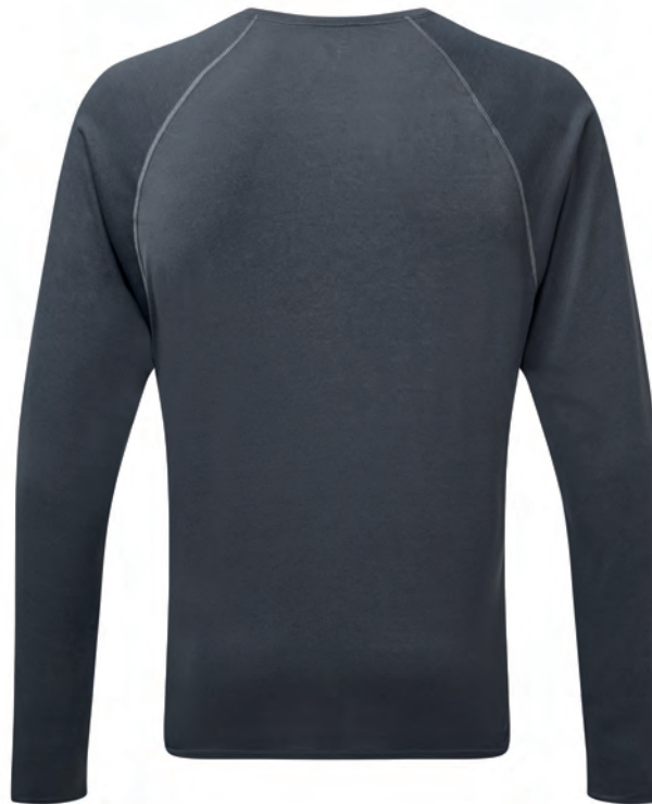
RH-00214 Charcoal Marl