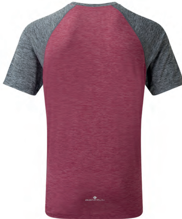
RH-00645 Mulberry/Grey Marl