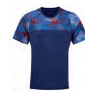
RH-00643 Midnight Blue/Flame

Fibre content: 88% Polyester (Recycled), 12% Elastane