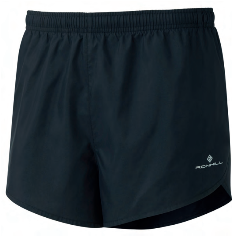
RO09 All Black