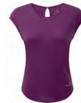
RH-00298 Grape Juice Marl