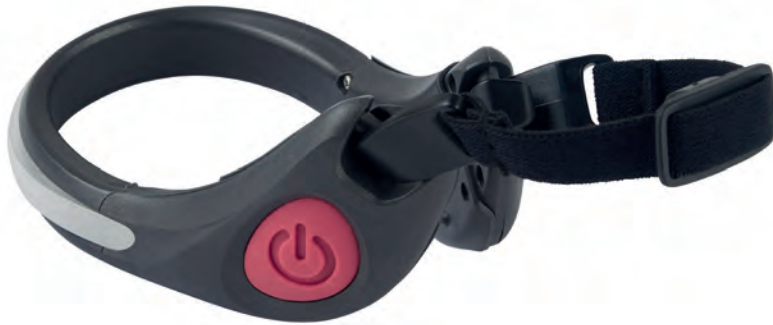
R829 Glow Red