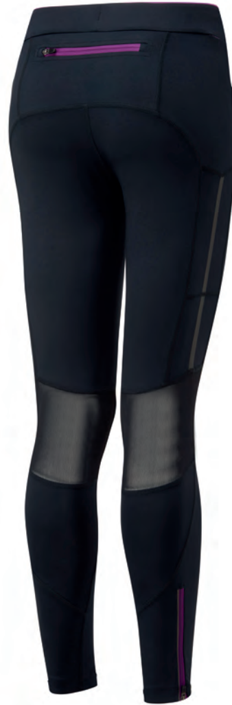
RH-00304 Black/Grape Juice