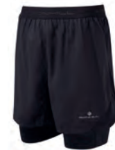
R009 All Black