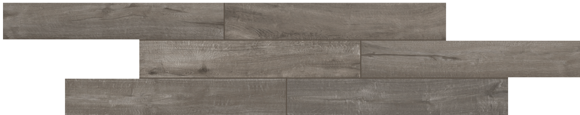
GRAY BROWN VC05