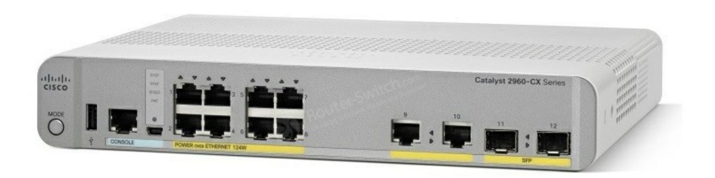
Table 1 shows the Quick Specs.

Figure 1 shows the appearance of WS-C2960CX-8PC-L.