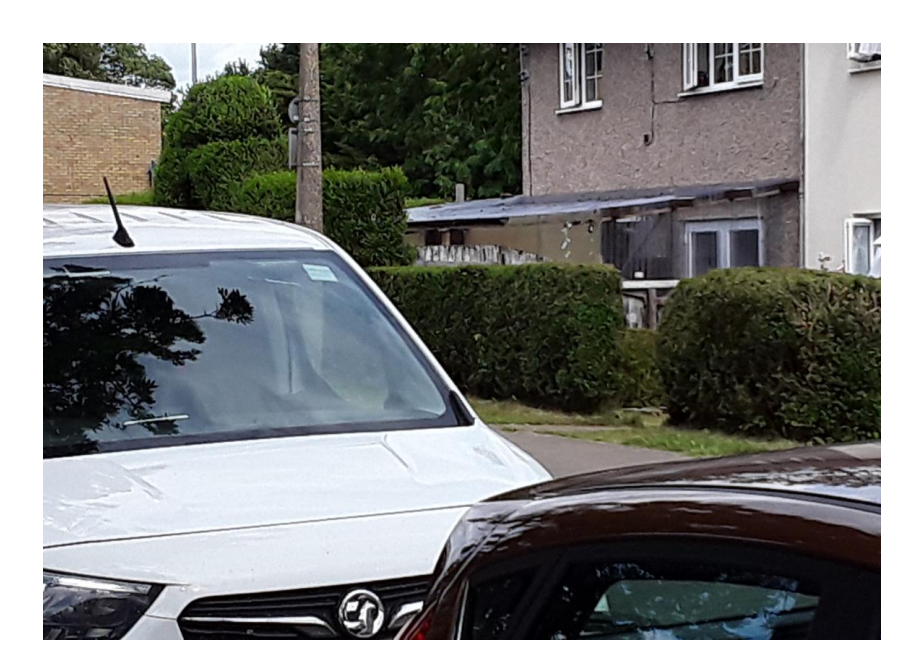
Figure 4: Existing front extension / porch which has been constructed at 134 Marymead Drive.