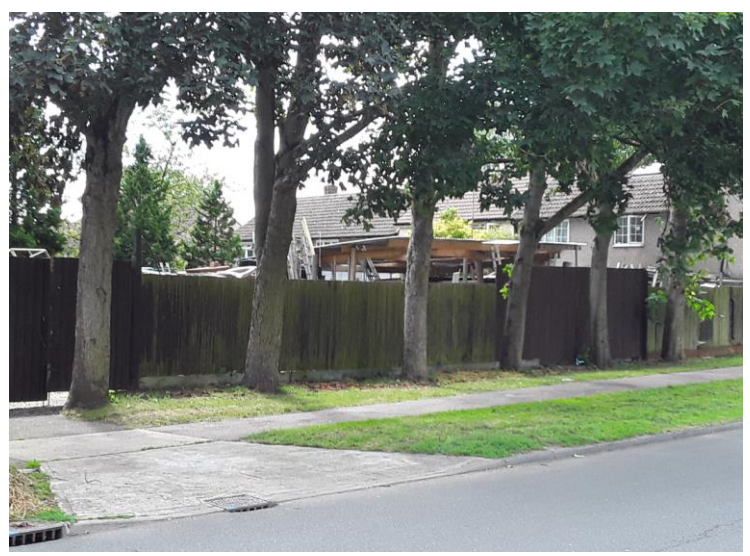
Figure 3: Photograph of recent constructed structure within rear garden

4.2.11 However, upon visiting the site, officers had noted that a further structure had been erected within the rear garden area of 134 Marymead Road (see Figure 3 below for reference) as per the enforcement report which was raised.