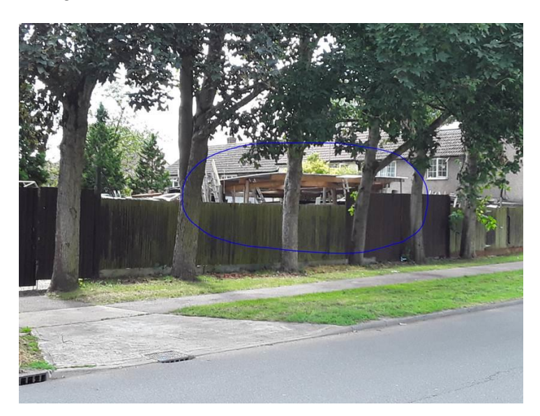
Figure 1: Photograph referred to in Conservation and Heritage Advisor Comments.

The whole rear garden appears to be filled with timber / covered areas / large sheds etc. As part of this, the structure you highlight in the photo below does stand out due to its height and although it has open sides it is a visible element in the street scene and one that does nothing to preserve the character and appearance of the CA (Conservation Area – Officer Comment) – particularly when seen with other development that has occurred within the rear garden.