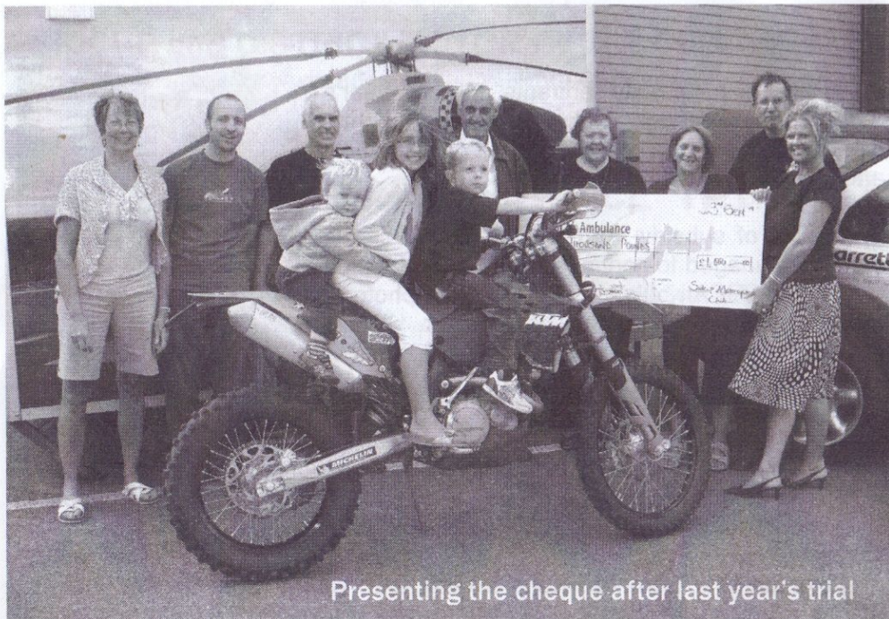
Presenting the cheque after last year's trial