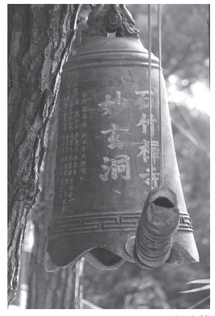
Miaoxuandong, Shizhu chansi 石竹禪寺妙玄洞