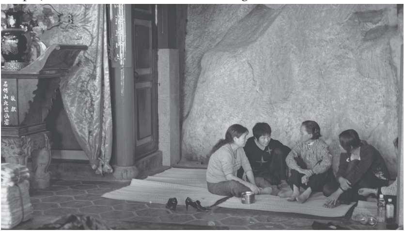
Women waiting for a dream

The ground on both sides of the shrine is strewn with straw mats so that pilgrims can lie down and sleep as they await the requested dream, to the extent that the hall often resembles a disorderly dormitory. The area to the left of the shrine, west of the temple, is reserved for women and the right for men.