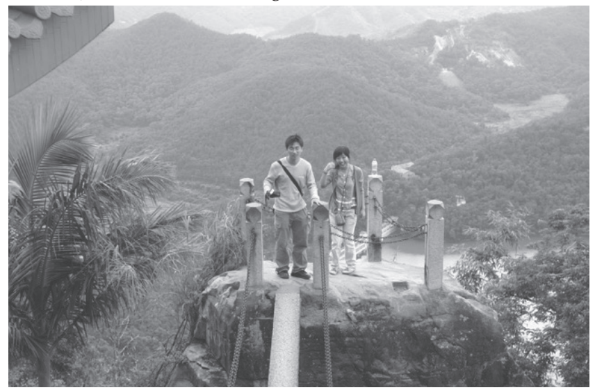
The Jiuxian's field of cinnabar

As is always the case in China, in places of pilgrimage, each grotto and each rock are "alive" and bear an inscription telling of the site's past. A map gives specifications about the landscape. The mountain is populated with spirits and divinities. Of course, it is principally the territory of the Jiuxian, and the climb is a kind of encounter, a progressive communion with their souls, hun 魂, that reside there. In front of the belvedere lies an important site for their memory and cult. It is a sort of rocky peak, a natural feature, in front of the temple's terrace and connected to it by a narrow bridge that stretches across the vertiginous drop between the two areas. It is said that the outcropping is the mortar in which the Nine Immortals prepared the elixir of immortality from the alchemic substance cinnabar. The faithful who wish to conceive a child cross the daunting bridge and pray, on the metaphorical "field of cinnabar," to the immortals to grant them one.