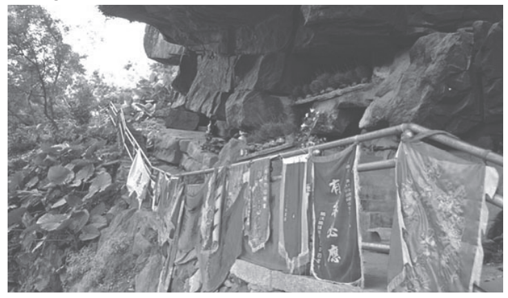
A shrine of Guanyin

The divinatory practice of dreams is usually associated with other mantics and this is also the case on Shizhu shan. Climbing the mountain is both a quest supported by the various techniques offered along the way, and a pilgrimage along a trail studded with places of worship. Shizhu shan rises five hundred and thirty-four metres above sea level. Stone steps take the pilgrim gradually up to the great gateway to the mountain, i.e., to the temple. Between these two points, one passes through several stages that all require their offering of incense, to the extent that the slopes take on the air of a huge incense-burner dotted with bushes of red sticks giving off pale smoke that mingles with the low-hanging clouds. "Four sacred springs, twelve rocks engraved with memorial inscriptions, seven peaks, six grottos, three cliffs each with their tale or legend and pavilion" where gods such as Guanyin are worshipped make up the stages of this climb.