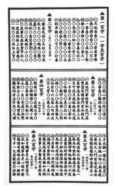
A page in the almanac Zhuge shenshu (characters 100 to 600, diyibaizi 第一百字 to diliubaizi 第六百字)

Enigmatic as it is, we shall have to make do with this proposition typical of legendary origins and texts created over the centuries, and eventually attributed to famous figures such as Zhuge Liang (181–234)—who probably had little to do with the text to which he nevertheless lends his name and his aura of an outstanding strategist, also known by his Daoist name Crouched Dragon, Wolong 臥龍. It is thus associated with the context in which Zhuge Liang lived, the era of the Three Kingdoms (220–280), illustrated by the heroic epic of the same name, Sanguo zhi yanyi 三 國志演義in which he figures alongside the historic heroes Liu Bei 劉