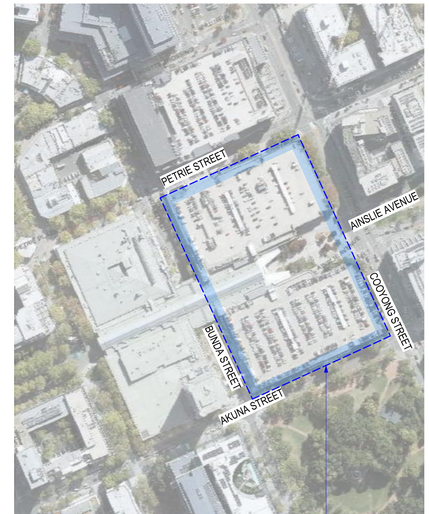
2 AERIAL PHOTO / LOCATION PLAN NTS