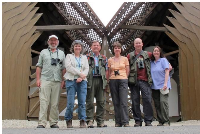
2013 Naturetrek Group at National Park HQ, Fertod