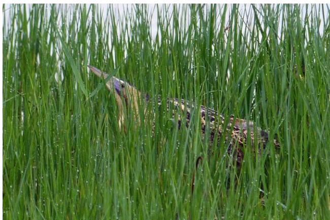
Bittern (Dave Smallshire)