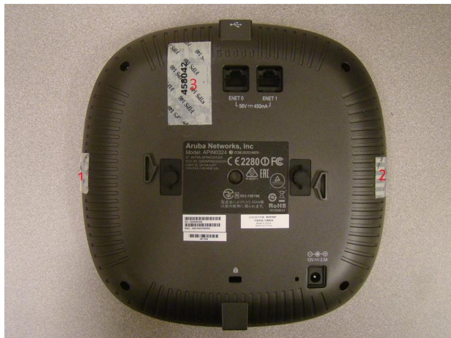
Figure 7 – Bottom View of AP-324 with TELs