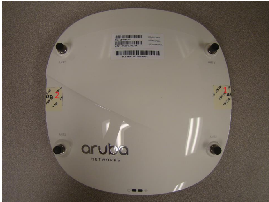
Figure 6 - Top View of AP-324 with TELs