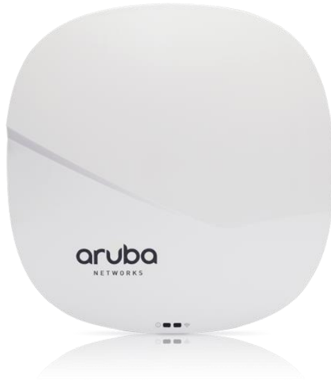
Figure 2 - Aruba AP-325

This section introduces the Aruba AP-325 Wireless Access Point (AP) with FIPS 140-2 Level 2 validation. It describes the purpose of the AP, its physical attributes, and its interfaces.