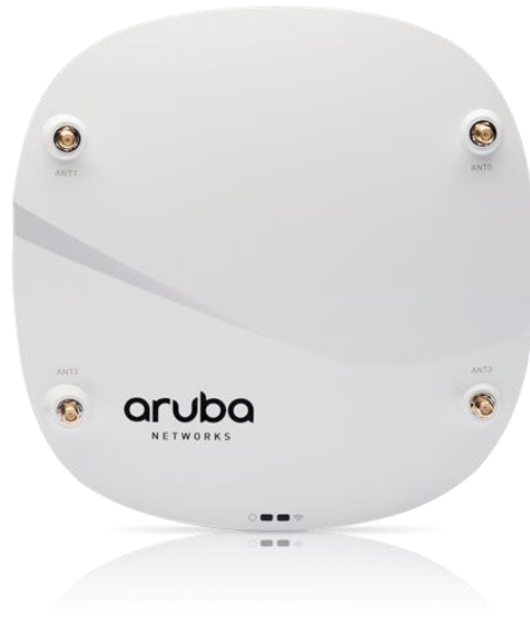
Figure 1 - Aruba AP-324

This section introduces the Aruba AP-324 Wireless Access Point (AP) with FIPS 140-2 Level 2 validation. It describes the purpose of the AP, its physical attributes, and its interfaces.