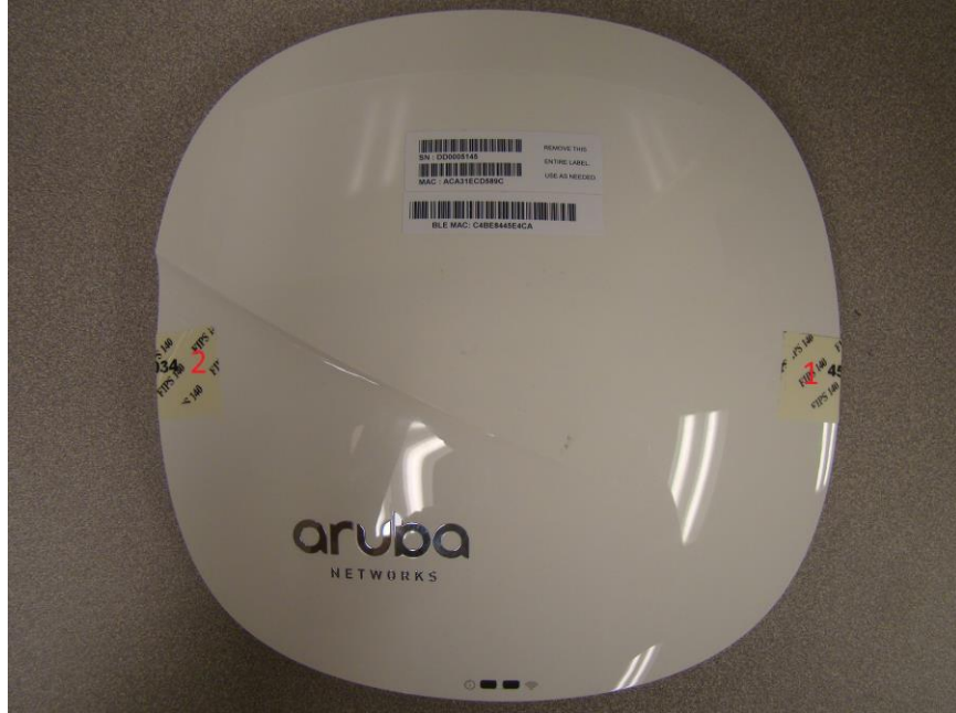
Figure 8 – Top View of AP-325 with TELs