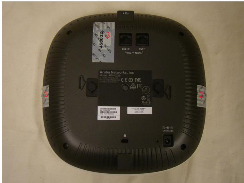
Figure 9 – Bottom View of AP-325 with TELs