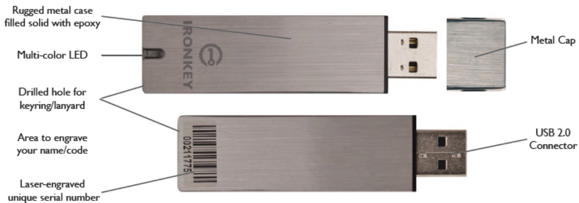
Figure 1 – Image of the Cryptographic Module (S250)

The cryptographic boundary is defined as being the outer perimeter of the metallic enclosure and is depicted below.