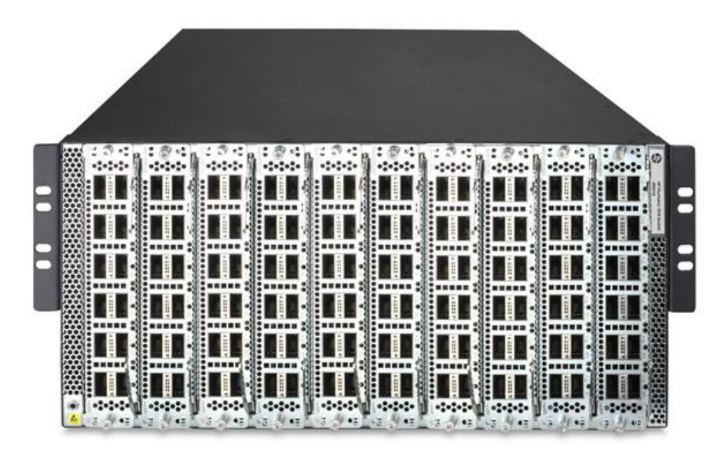
Figure 7 HPE FlexFabric 7910 Switch Chassis (JG841A)

The Table 8 through Table 10 lists the test configurations for the HPE FlexFabric 7900 Switch Series switch series.