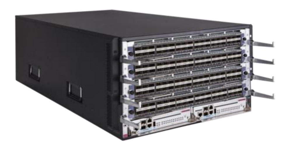
Figure 8 HPE FlexFabric 12904E Switch AC Chassis (JH262A)

HPE FlexFabric 12904E Switch AC Chassis (JH262A)