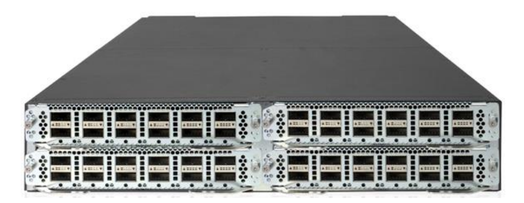
Figure 6 HPE FlexFabric 7904 Switch Chassis (JG682A)