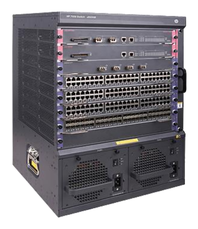
Figure 4 HPE FlexNetwork 7506 Switch Chassis (JD239C)