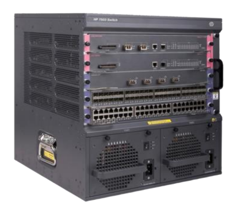
Figure 3 HPE FlexNetwork 7503 Switch Chassis (JD240C)