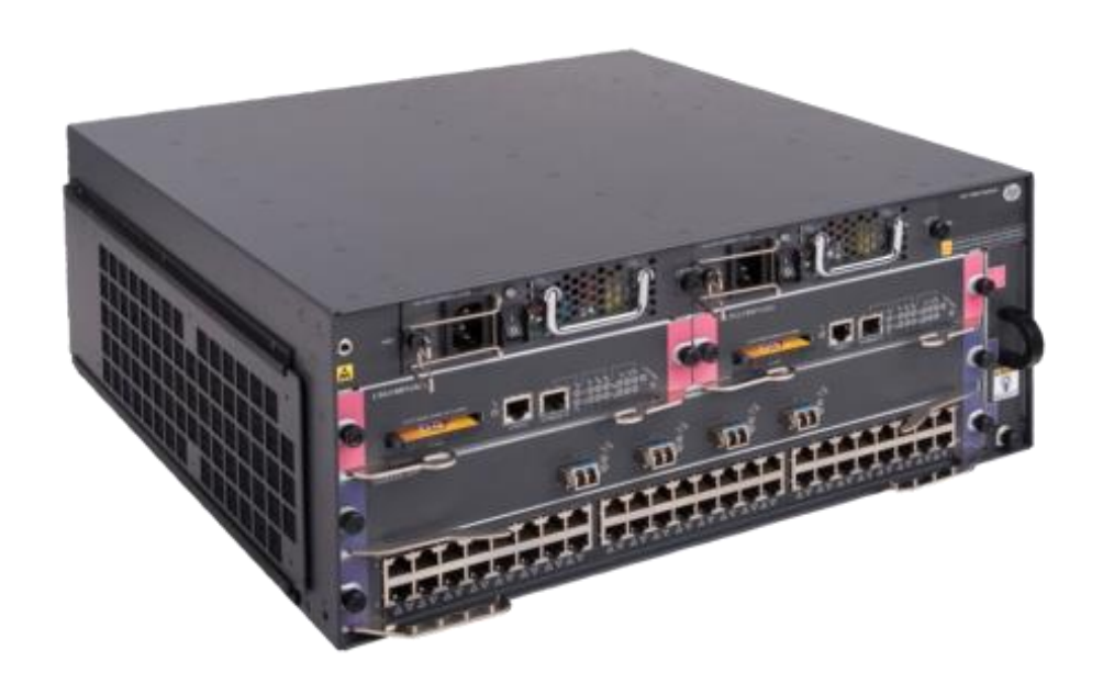
Figure 2 HPE FlexNetwork 7502 Switch Chassis (JD242C)