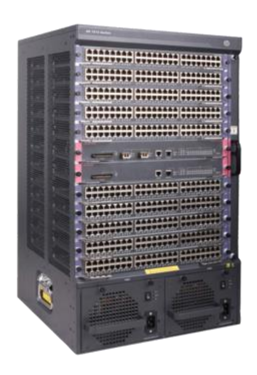
Figure 5 HPE FlexNetwork 7510 Switch Chassis (JD238C)