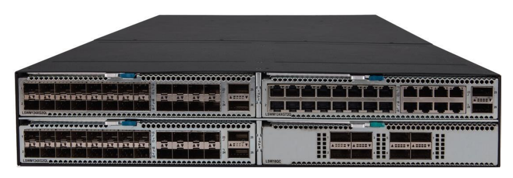
Figure 19 HPE FlexFabric 5930 4-slot Switch (JH179A) / HPE FlexFabric 5930 4-slot Switch TAA version (JH188A)