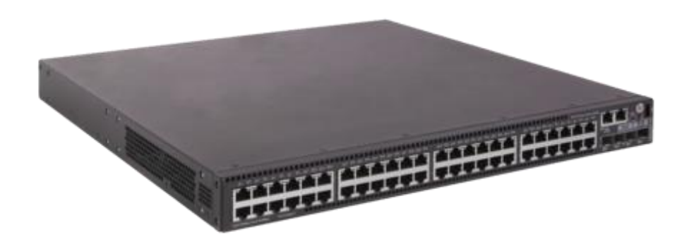
Figure 12 HPE 5130 48G 4SFP+ 1-slot HI Switch (JH324A) / HPE 5130 48G PoE+ 4SFP+ 1-slot HI Switch (JH326A)