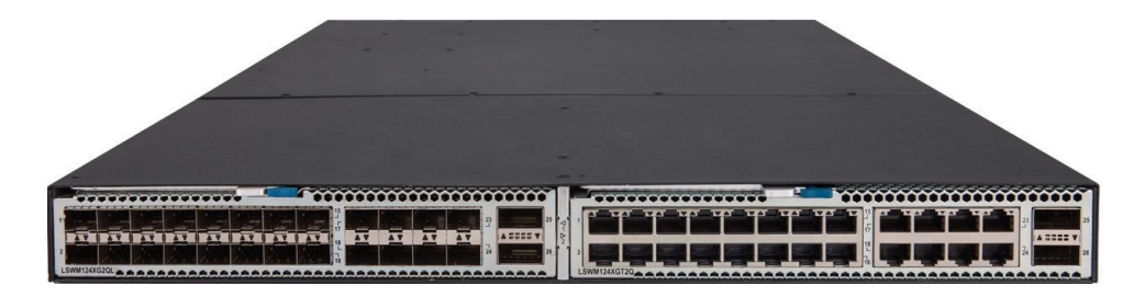
Figure 20 HPE FlexFabric 5930 2QSFP+ 2-slot Switch (JH178A) / HPE FlexFabric 5930 2QSFP+ 2-slot Switch TAA version (JH187A)