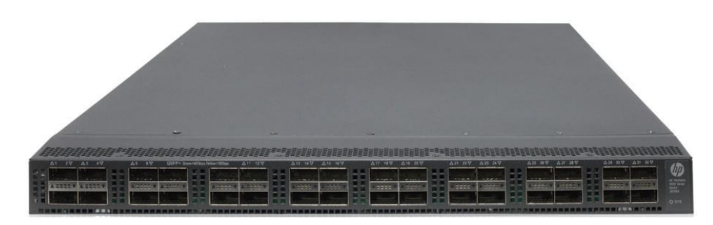
Figure 18 HPE FlexFabric 5930 32QSFP+ Switch (JG726A) / HPE FlexFabric 5930 32QSFP+ Switch TAA version (JG727A)