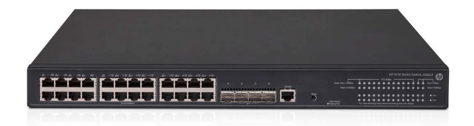
Figure 5 HPE FlexNetwork 5130 24G PoE+ 4SFP+ (370W) EI Switch (JG936A)