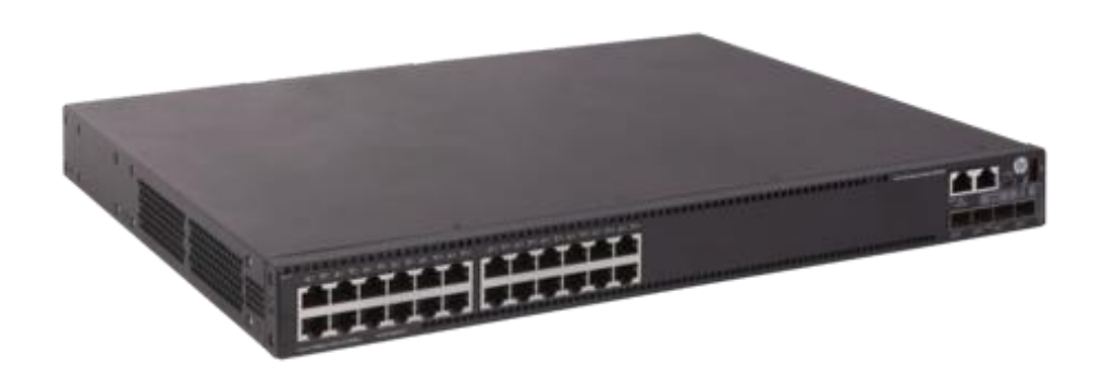
Figure 11 HPE 5130 24G 4SFP+ 1-slot HI Switch (JH323A) / HPE 5130 24G PoE+ 4SFP+ 1-slot HI Switch (JH325A)