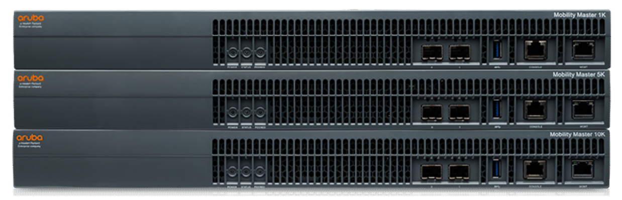
Figure 1 shows the front of the three Mobility Master Appliances (1K, 5K, 10K variants), and illustrates the following: