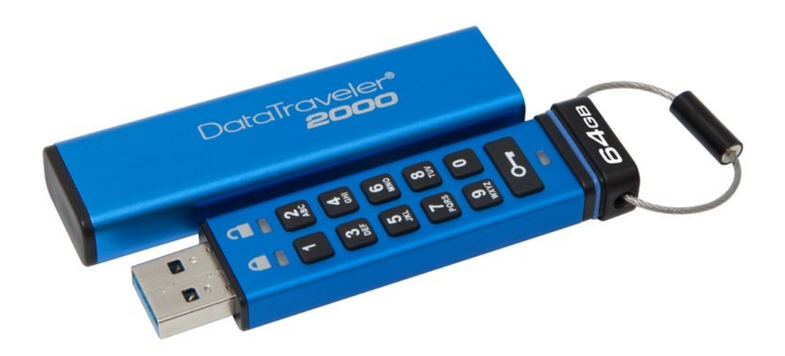
Figure 1: Kingston DataTraveler 2000 cryptographic boundary showing input buttons and status LEDs