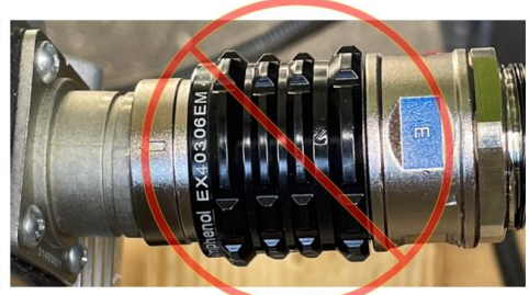
HVG1S403FC + EX40306EM