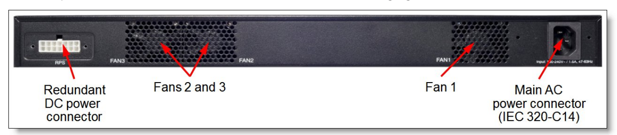
Figure 4. Rear panel of the RackSwitch G7052

The rear panel of the RackSwitch G7052 is shown in the following figure.