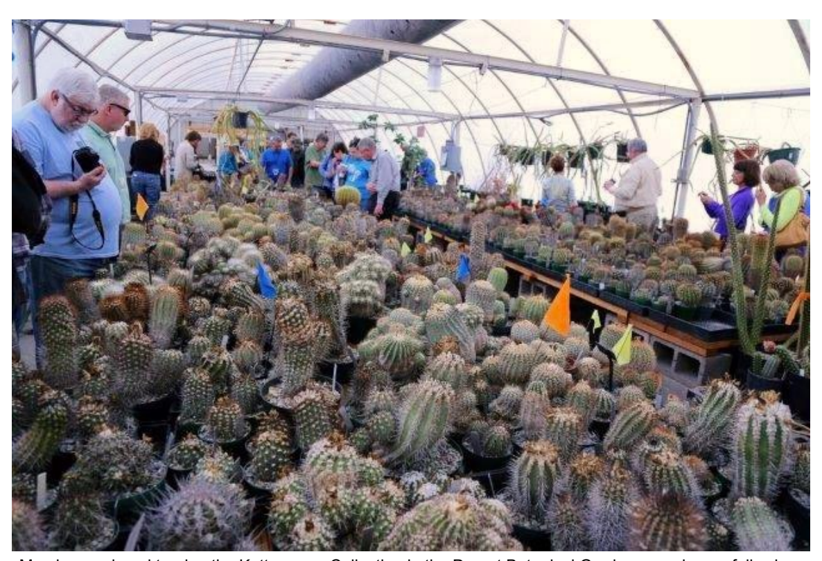
Members enjoyed touring the Kattermann Collection in the Desert Botanical Garden greenhouse following the January meeting.