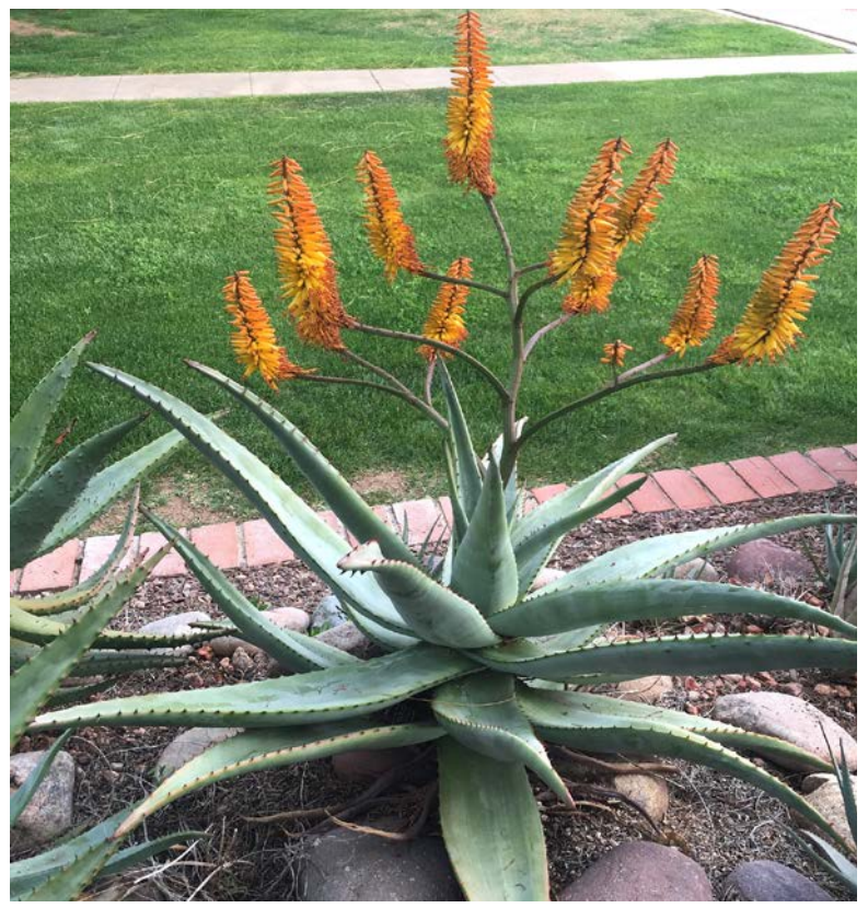
Page 11 of 13