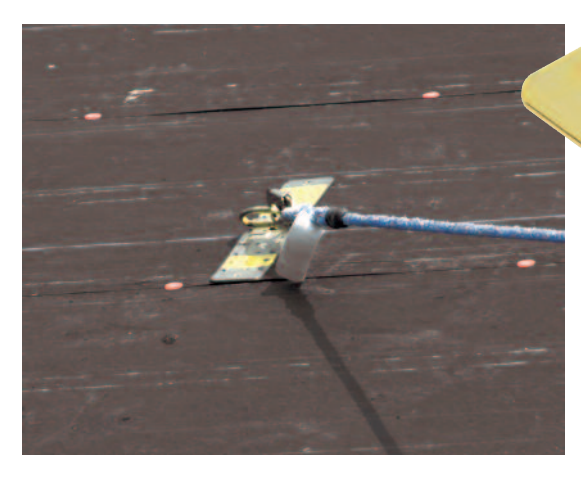
Reusable Roof Anchor installed off roof peak