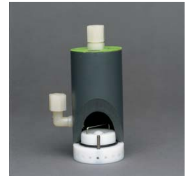
Proprietary sample probe allows accurate samples in a wide variety of environments.