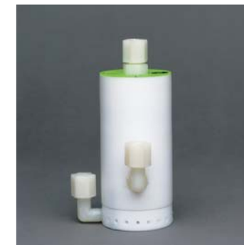
TFE sample probe for reactive environments. Other customizations are available.

All BVS liquid samplers utilize the flooded-suction concept of operation. With the sampling probe or pump submerged in the liquid to be sampled, liquid enters the sampling device by gravity, thereby giving a true representative sample of the liquid at that particular strata. The use of peristaltic or vacuum pumps, the suction concept of operation, does not give a true representative sample of the liquid that is being sampled. The use of suction changes the solubility of the sample by changing the gas/liquid balance. This change in solubility makes it impossible to get accurate measurements of dissolved gases.