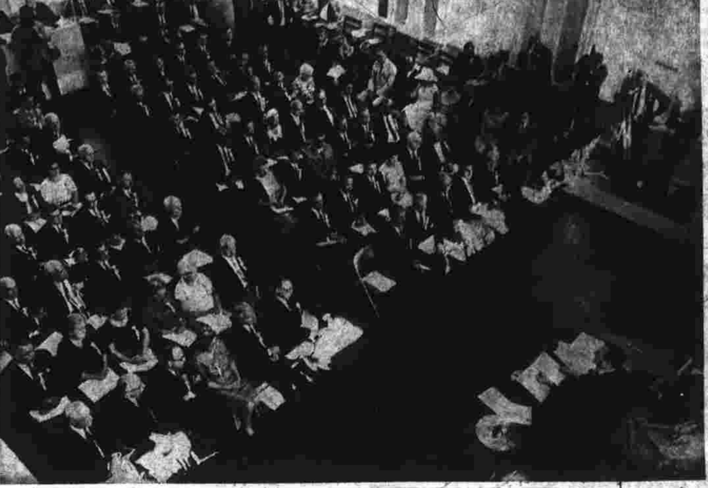
Gov. Dempsey Addresses Constitutional Convention Delegates

HARTFORD (AP) — Gov. John N. Dempsey called on delegates to the third constitutional convention in Connecticut history today to do their utmost toward "the swift and satisfactory discharge" of their duties facing them. "Our Connecticut constitution does not, according to judicial opinion, give every citizen his right to an equal vote," Dempsey told the opening session that met in an atmosphere of tradition and bipartisan accord. "The very first objective of this convention, then, must be to correct those portions of our constitution which have infringed upon these rights of the people." "Let us apply our maximum efforts to the swift and satisfactory discharge of the precise duties facing us." The opening session of the convention, the first since 1902, was held in the Old State House where the existing constitution was written at a convention in 1818. Dempsey said the convention will give "new expression to our Connecticut tradition of Democracy and to the role of the citizens and their government." He referred to the delegates to that session created the first written bill of rights in Connecticut's history, thereby guaranteeing civil liberties to each of our citizens." Dempsey told the delegates to act swiftly in accomplishing (See Page Ten)