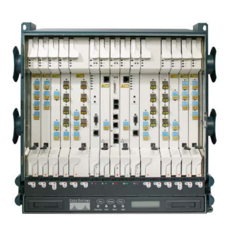
Figure 1. Cisco ONS 15454 Multiservice Transport Platform – ANSI (left) and ETSI (right) mechanics

Continuing with its tradition of innovation and leadership, Cisco has introduced the Cisco ONS 15454 Multiservice Transport Platform (MSTP), which is transforming DWDM networks. The Cisco ONS 15454 MSTP (Figure 1) allows a DWDM system to become as intelligent and flexible as the highly successful Cisco ONS 15454 MSPP, including wide service interface mix, service transparency, flexible topology, completely reconfigurable traffic pattern, and simplified operations.