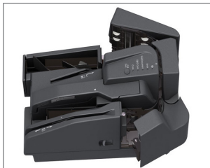
Paper paths easy to access