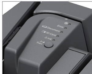
Easy operation with clear status LEDs