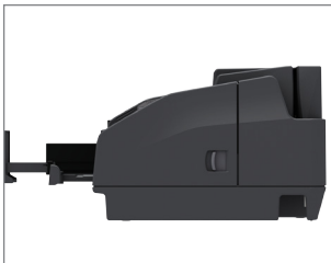
Compact design and small footprint