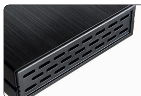
Front air vents