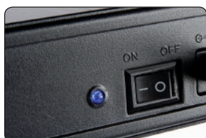
On/Off power switch and dual-mode status indicator (Power/Access)