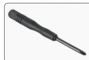
Screw driver included