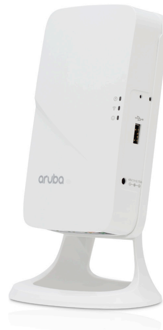
Desk mount (primary remote/branch deployment, using optional desk mount accessory)