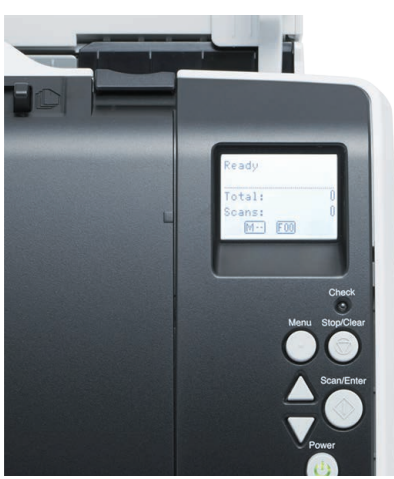
Integrated backlight enhanced LCD operating panel

As the smallest* A3 format scanners in their class capable of scanning even A2 and A1 size documents, the fi-7460 and fi-7480 are perfect for office use. Their versatile feeding capability runs from regular A8 to A3 sizes, and extends to folded A2 and A1 documents as well as small plastic cards. For maximum versatility, uninterrupted mixed batch scanning eliminates the need to sort your documents in advance.