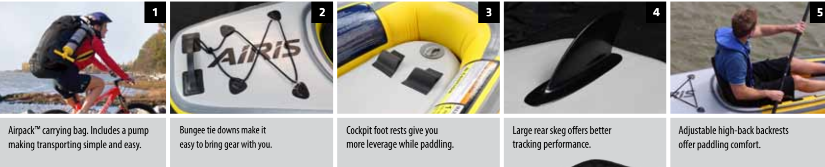
1 Airpack™ carrying bag. Includes a pump making transporting simple and easy.

Airis Kayaks are designed to be light and compact. Providing rigidity and durability through AirWeb™ High Pressure Patented Construction, Airis Kayaks are tear and abrasion resistant, quick to inflate, simple to use and so portable, they roll up to fit inside their own backpack (included). Now you can take fun with you wherever you go!