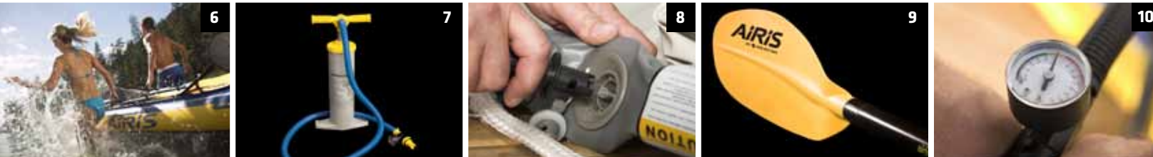
6 Carrying handles to make moving easy.